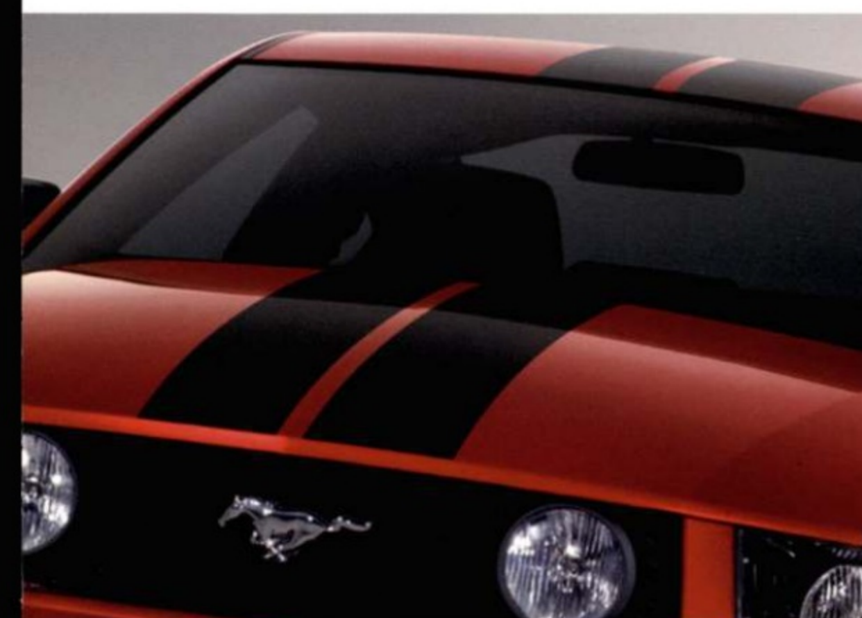
Racing Stripes. Add sporty style by personalizing your 'Stang with this best-selling kit. See page 5 for details.