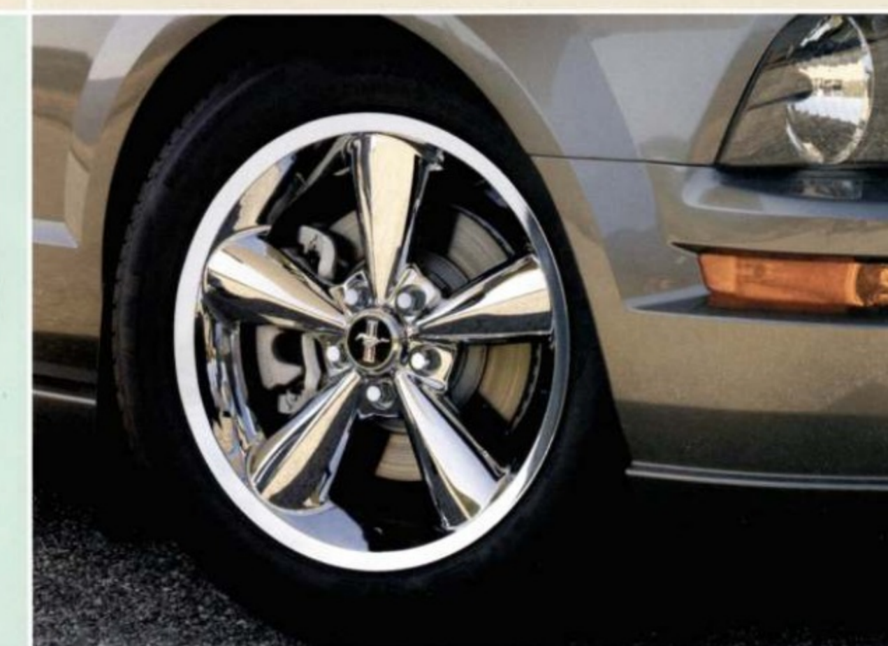
Custom Wheels. These new Mustang 18" wheels rock...and keep you rolling in style. You'll find a great selection of custom-designed wheels on page 6.