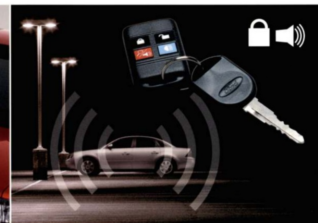
Vehicle Security System. On page 7, we offer products that are designed for your convenience and protection. This popular, state-of-the-art system protects your vehicle and its contents.