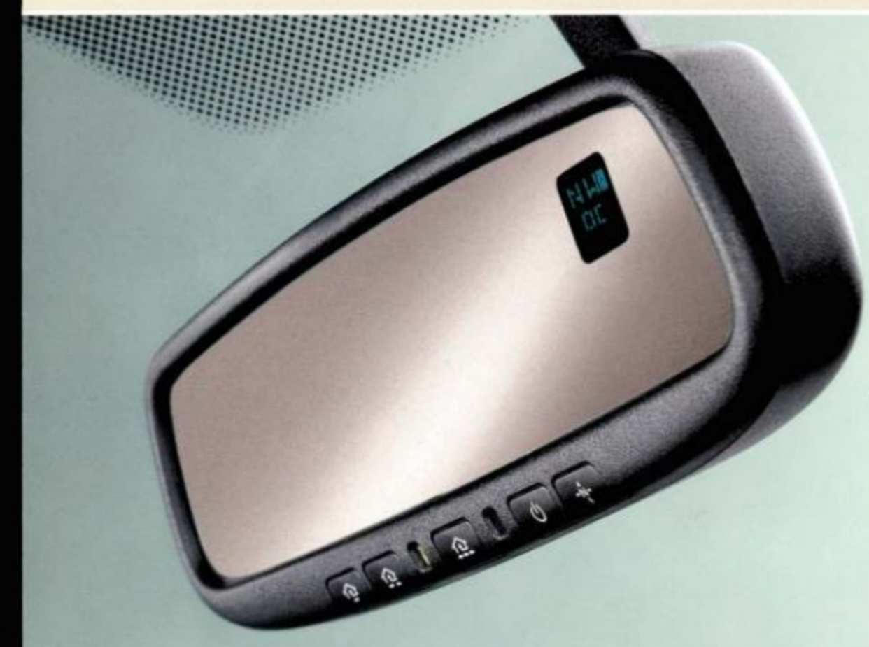
Electrochromic Mirrors and Electrochromic HomeLink® Mirrors. These top-selling mirrors eliminate headlight glare, plus much more! See page 6 for more details on their state-of-the-art features.