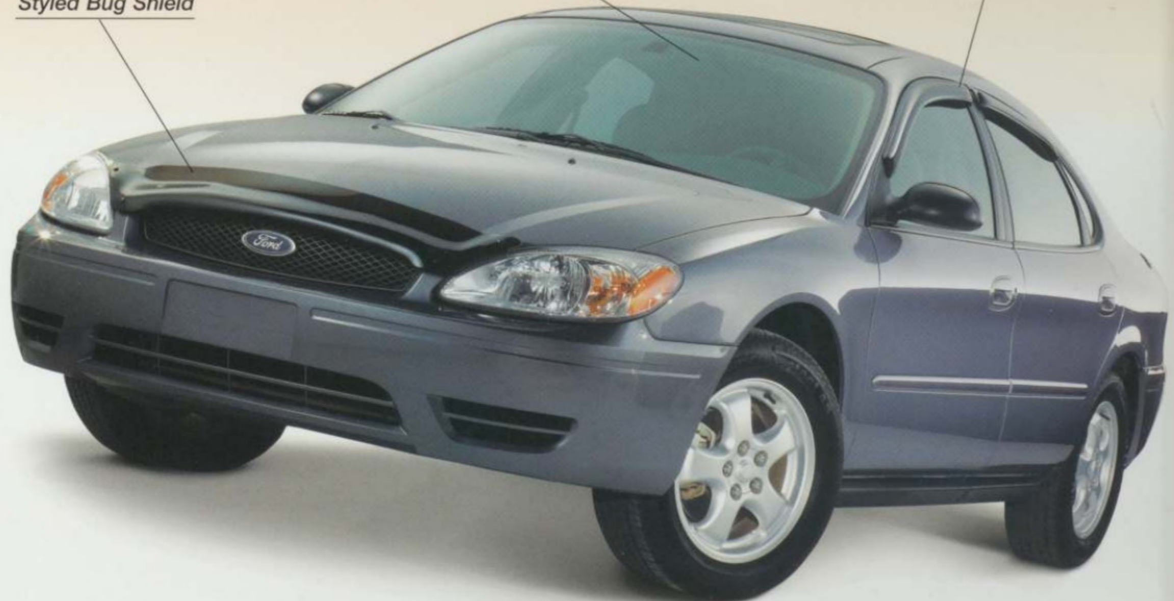
Side Window Deflectors

Turn the page and discover a complete catalog of great choices to help you personalize your new Taurus or Crown Victoria. Engineered by Ford for a perfect fit and long-wearing durability, Genuine Ford Accessories embody the classic style and performance that complement your good taste and make every drive complete. They're the perfect travel companions cross-town or cross-country. What's more, you can rely on precise professional installation at your Ford dealer and the backing of one of the industry's strongest limited warranties.