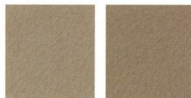
LIGHT CAMEL CAMEL