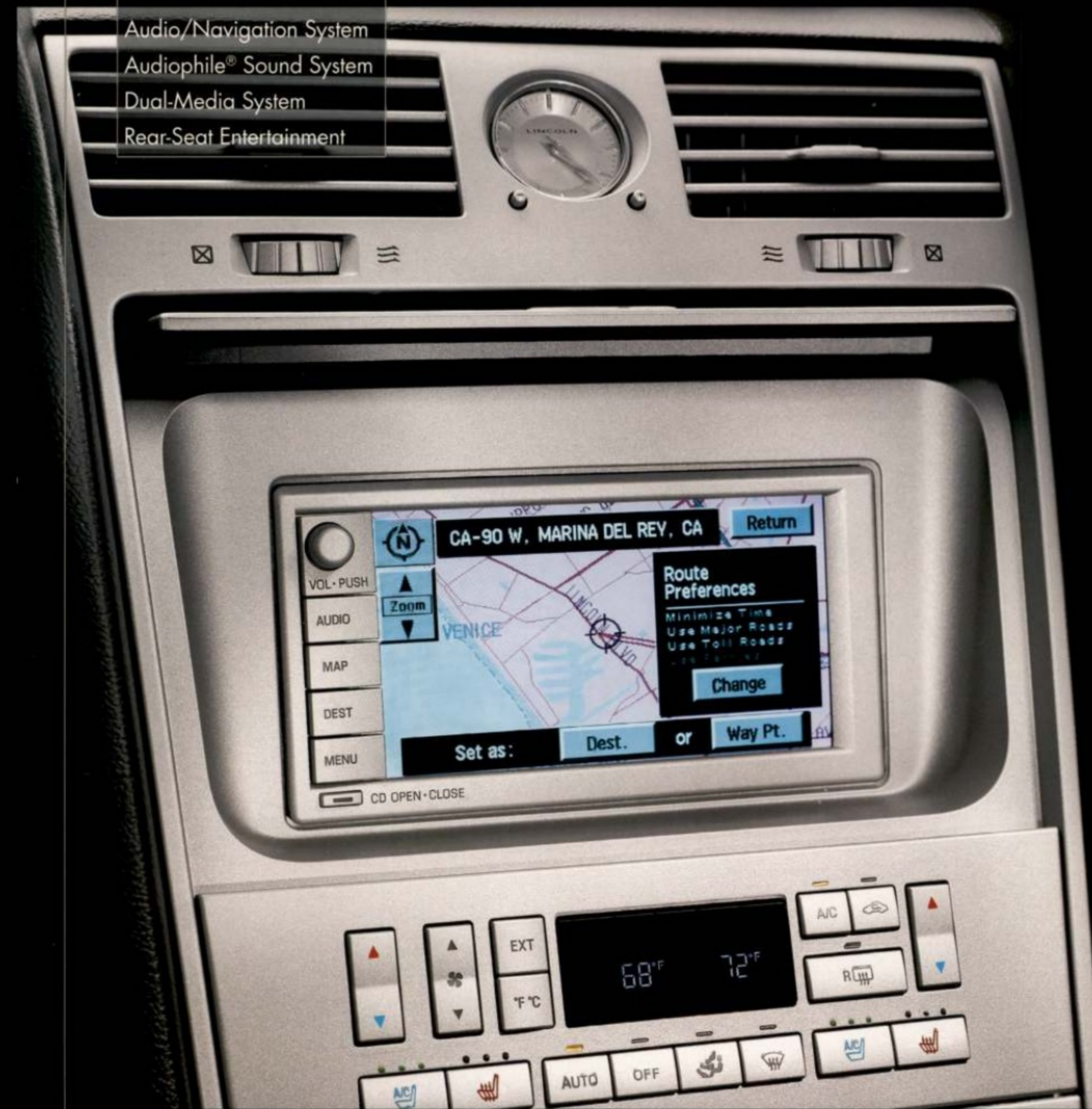
Available Lincoln Soundmark® THX™ Certified Audio and Navigation System with 6.5" color LCD touch screen.