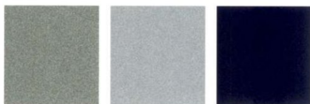
LIGHT TUNDRA LIGHT ICE BLUE DARK BLUE PEARL