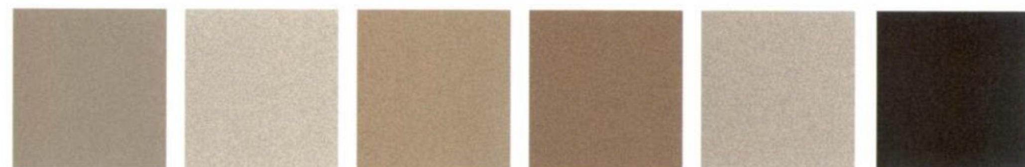
LIGHT SAGE CASHMERE TRI-COAT SMOKESTONE DUNE PEARL LIGHT FRENCH SILK CHARCOAL BEIGE