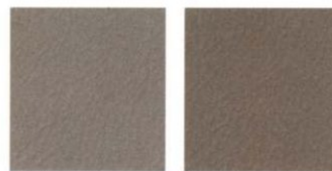
LIGHT STONE MEDIUM LIGHT STONE