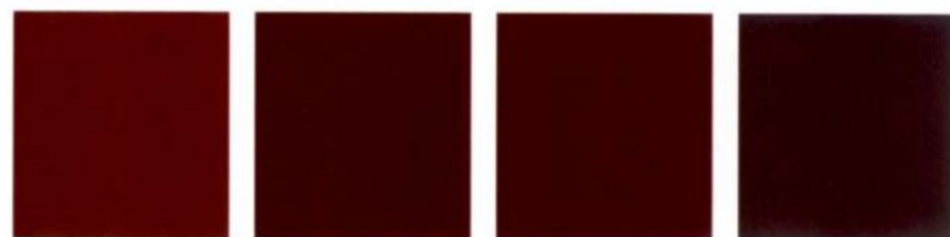
VIVID RED MERLOT DARK TOREADOR RED DARK CHERRY