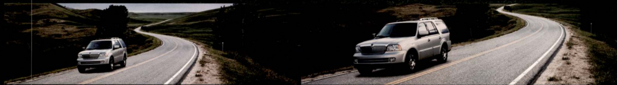
Lincoln Navigator Ultimate in Cashmere Tri-Coat (top) and Silver Birch Metallic (bottom) with available equipment.