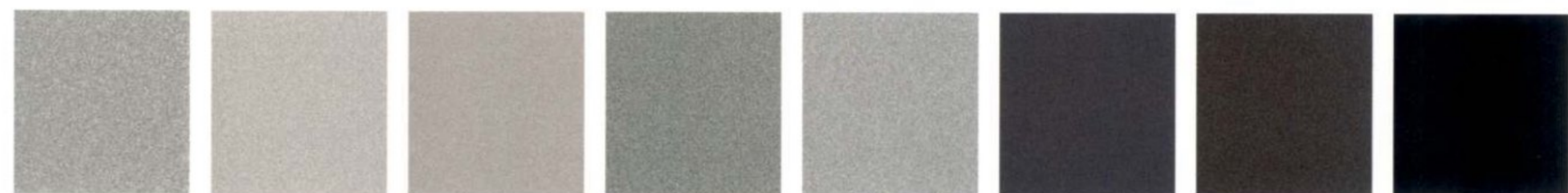
SILVER SILVER FROST SILVER BIRCH SATELLITE SILVER PEWTER TUNGSTEN GREY DARK SHADOW GREY BLACK