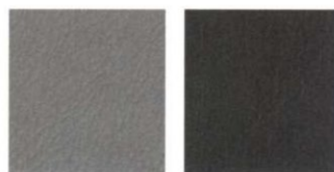
DOVE DOVE GREY