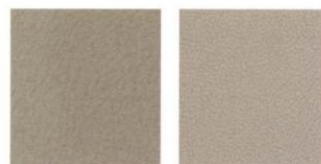
LIGHT PARCHMENT SAND