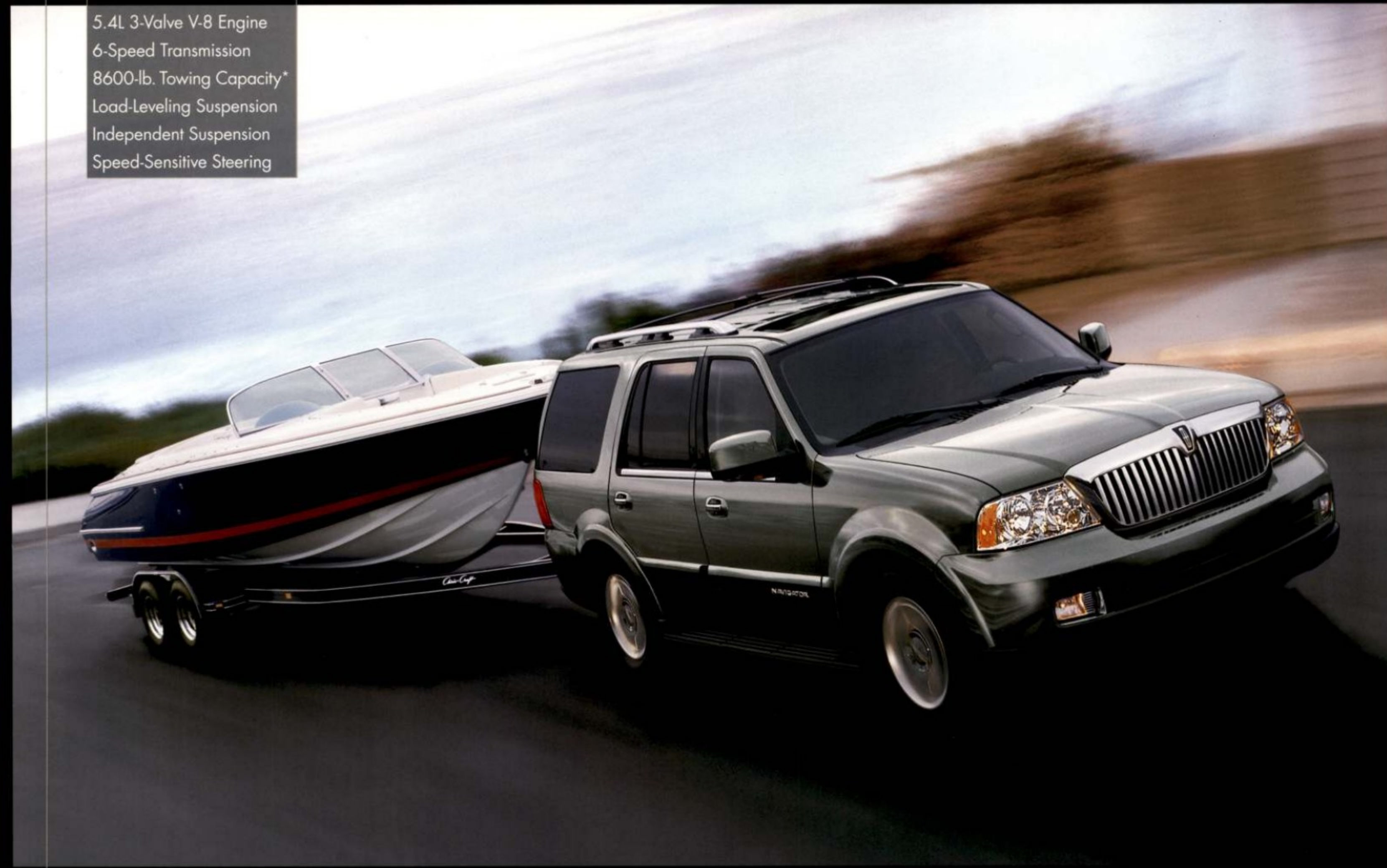
Lincoln Navigator Ultimate in Light Tundra Metallic with available equipment.