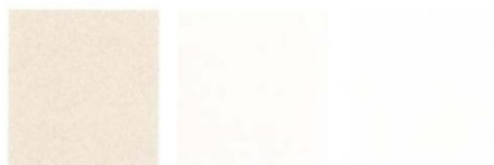
CERAMIC WHITE PEARLESCENT TRI-COAT VIBRANT WHITE OXFORD WHITE