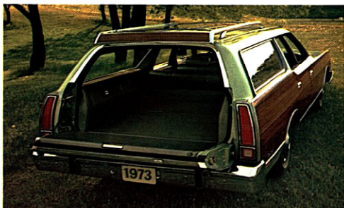
Use it as a drop gate to load cargo (above) or as a wide-swinging door for passengers (below).

No matter which Mercury wagon suits your needs best, one feature you'll appreciate whether you tote parcels or people is the tailgate that opens as a door (whether the rear window is rolled up or down) or drops down with the deck for easier loading of cargo.