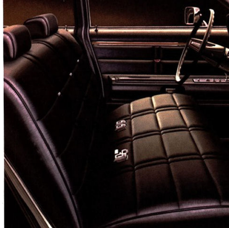
Marquis standard interior