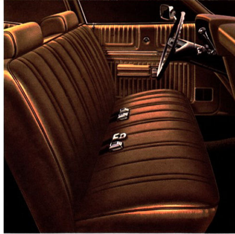
Montego MX interior