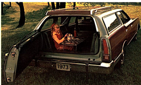
Make your Mercury wagon "playful" with this unique foldaway recreation table, available about December 4, 1972.