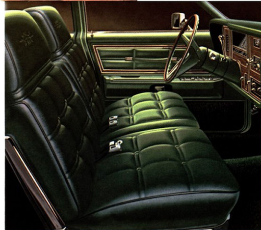
Colony Park with optional luxury trim and steering wheel