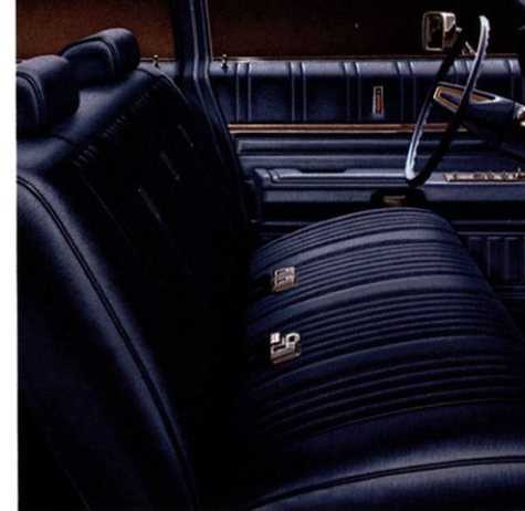
Monterey standard interior with optional steering wheel