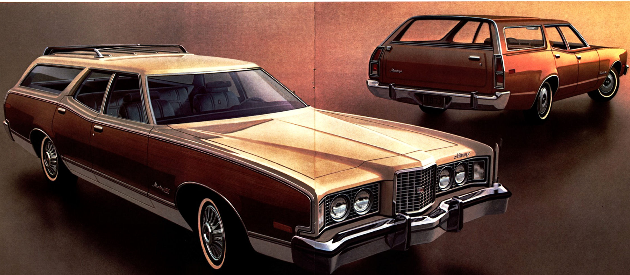
Mercury Montego MX Villager, foreground; Montego MX Station Wagon, background