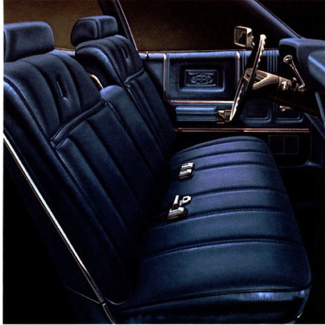
Montego MX Villager interior