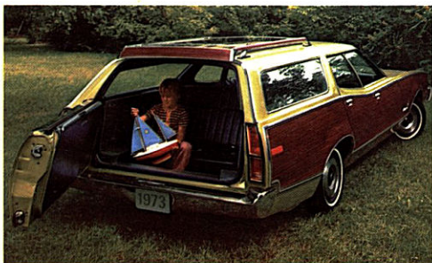
A scenic view for two is afforded in Villager and Montego MX wagons with the optional rear-facing third seat.