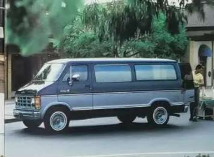
Ram Wagon is available in two wheelbases and three body lengths.

6985 L (246.7 cu. ft.) up to 8622 L (304.5 cu. ft.). Wheelbases of 2780 mm (109.6 in.) and 3240 mm (127.6 in.). Special option packages make Dodge Vans perfect for conversions. Caravan C/V offers front-wheel drive, power steering, plus front and rear gas-charged shocks for excellent driving comfort and handling ease. Engine choices range from a 2.5-liter four-cylinder to a 3.3-liter V6.