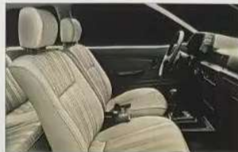
An impressive level of comfort and convenience touches can be found in the interior of Colt 200.

Real value is a matter of getting what you want for what you can afford. And what drivers want today is engineering integrity that translates into reliable day-to-day performance, easy handling, and that personal element of comfort and style. The highly acclaimed Colt 200 models meet those expectations with impressive packages of engineering and styling features ... at prices that mean real value. Colt 200 comes standard with the proven 1.5-litre fuel-efficient engine and slick five-speed manual - or optional automatic. A sporty 1.6-litre 16-valve DOHC engine is available in some models. Colt 200 3-door hatchback models have split fold-down rear seats for added versatility.