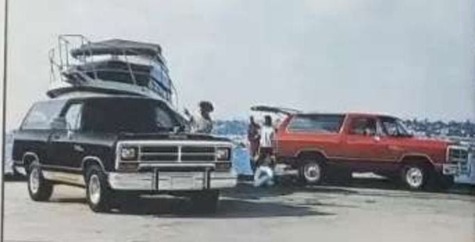
Standard equipped, two-wheel drive Ramcharger can hold up to 3447 kg (7600 lb.) of load or trailer.