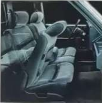
Spacious Club Cab interior offers optimal seating for up to six adults.