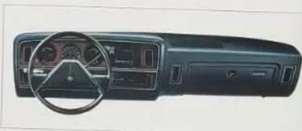
A revised instrument panel includes clearly readable gauges and easy-to-reach controls for maximum driving comfort and enjoyment.