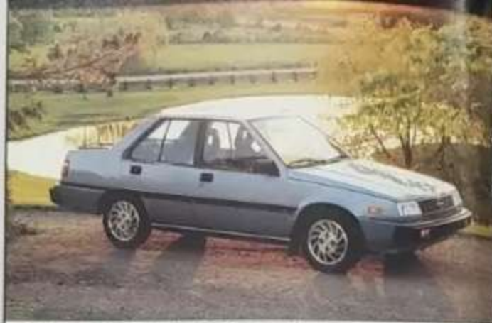
Colt 100 4-door sedan offers a wide selection of features and dimensions for your style of driving.

NA - Not Available SOHC - Single Overhead Camshaft 2V - Two Valve Fuel Injection