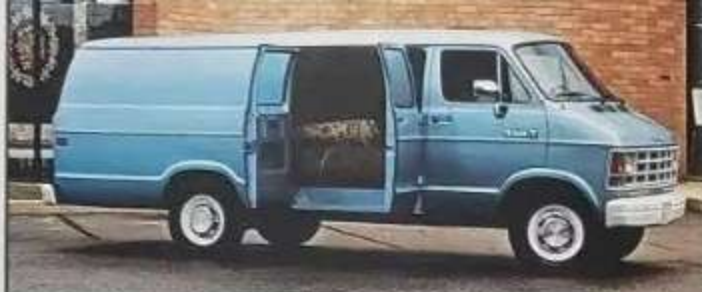
All full-size Ram Vans have standard dual-hinged doors, side and rear. Sliding side door and single-hinged rear door are options.