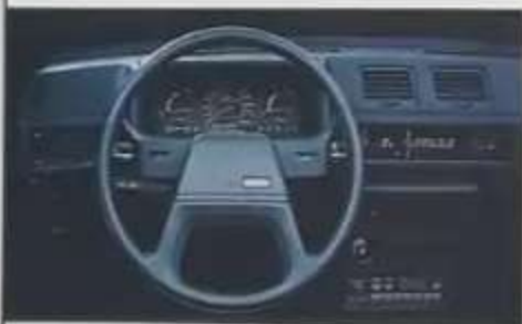
Colt 100 instrument panel is clear, informative and handsome, with all controls close at hand.