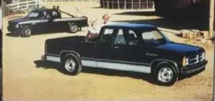
Club Cab models are available on two-wheel drive Base Dakota and Dakota Sport, as shown here.

The Dodge Ram lineup for 1990 includes a whole stable of D-Series two-wheel drive or W-Series 4x4 full-size pickups. On lighter-duty models, D & W 150 and value-oriented D & W 150S, there's a choice of box sizes: 2.0 m (6 1/2 ft.) or 2.4 m (8 ft.). 150 and 250 models are available in a new Club Cab version that adds two rear jump seats. Payload ratings run the gamut from a standard 720 kg (1590 lb.) on D150S to an optional 2485 kg (5475 lb.) on D350. There's get-tough power, too. A 3.9-litre EFI V6 is standard on D and W 150, 150S and 250, with a 5.2-litre EFI V8 optional. D & W 350 offers the standard 5.9-litre EFI V8. And on both 250 and 350 conventional cabs the Cummins 5.9-litre six-cylinder Turbo Diesel is available as an option.