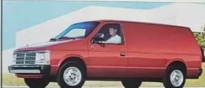
Compact Caravan C/V is available in both short and long wheelbase models.