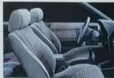
Sundance RS interior seating for five with a sports sedan flavour.

1990 Sundance brings to Canada what so many new car buyers are looking for. Its performance, comfort, and extensive list of standard features give new meaning to the word affordable. Sundance has the silhouette of a trim sedan, but with a standard hidden rear liftgate, a folding rear seat, the choice of two or four doors, and seating for five, there's surprising versatility. So pack it up, and take to the road. Sundance RS. New meaning to the word fun. With Performance front seats, featuring lumbar adjustment for the driver, full centre console, and equipment such as tinted glass, cassette radio and tilt steering column included as standard, RS adds enhancement in performance, comfort and looks. Dedicated to the person who expects zest to be part of the driving equation.