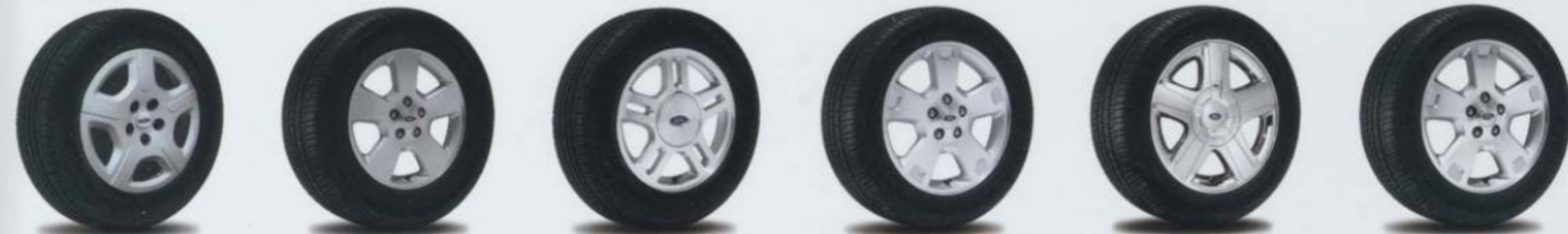
16" Steel with Full Wheel Covers Standard on SE 16" 5-Spoke Painted-Aluminum Sport Standard with SE Appearance Package 16" 5-Spoke Bright Machined-Aluminum Standard on SEL 17" Aluminum-Alloy Available with SE Appearance Package and on SEL 16" Chrome-Clad Standard on Limited 17" Polished Aluminum-Alloy Available on Limited