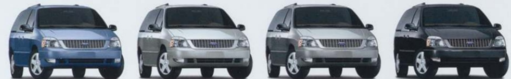
Windveil Blue Metallic Silver Frost Metallic Pewter Metallic Black*

*Freestar Limited only. Ford uses clearcoat paint for beauty and protection. Colors shown are representative only. Not all colors are available on all models. See your dealer for actual paint/trim options.