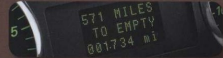
MESSAGE CENTER TRANSMITS FUEL AND MILEAGE DATA Standard on Limited; available on SEL