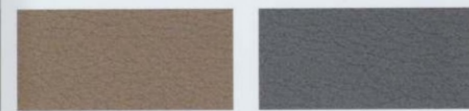
Pebble Leather Standard on Limited; Available on SEL Flint Leather