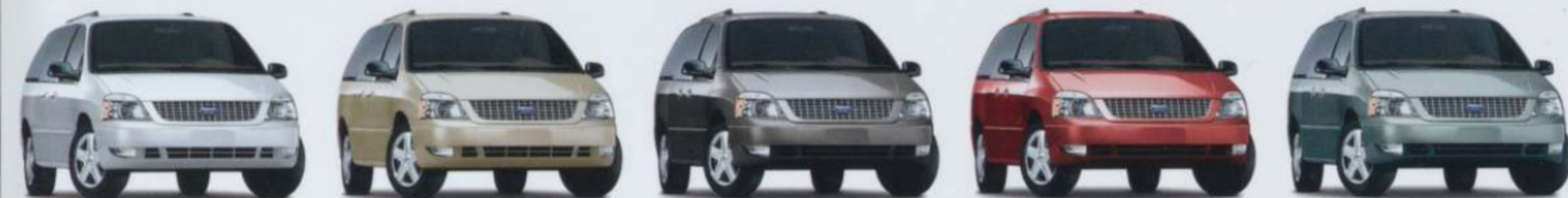
Vibrant White Dune Pearl Metallic Alloy Metallic Dark Toreador Red Metallic Light Tundra Metallic