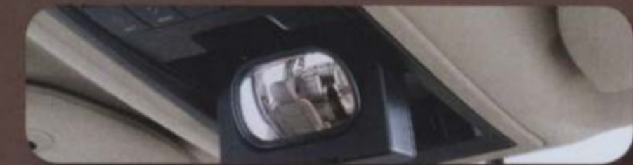
CONVERSATION MIRROR IS PART OF FULL OVERHEAD CONSOLE Standard on SEL and Limited