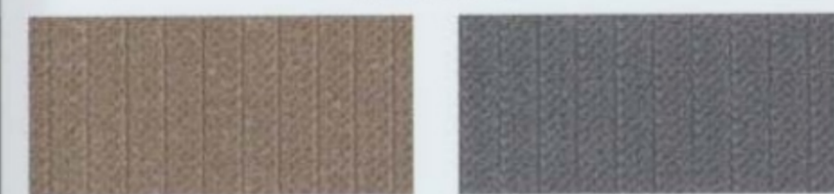
Pebble Cloth Included with SE Appearance Package Flint Cloth