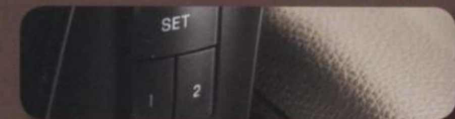
MEMORY FOR DRIVER'S SEAT, SIDEVIEW MIRRORS AND PEDALS Available on Limited; includes power-adjustable pedals