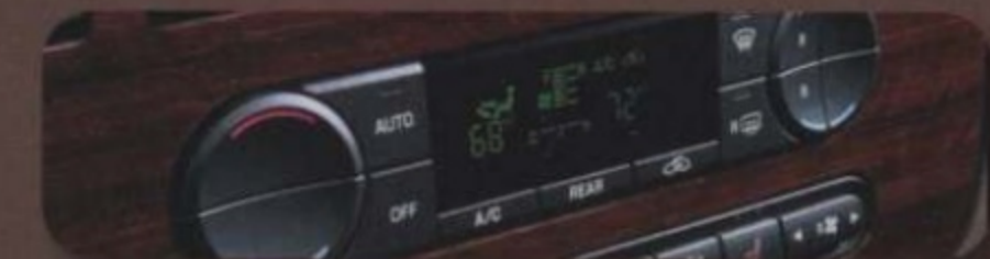
TRI-ZONE CLIMATE CONTROL Standard on Limited; includes Dual-zone Automatic Temperature Control