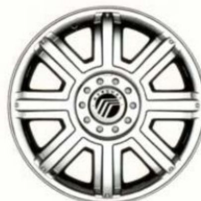
18" 8-SPOKE CHROME-CLAD ALUMINUM Optional on Montego and Montego Premier