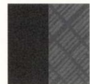
■ SHALE TWO-TONE CLOTH Not available on Dune Pearl