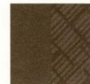
■ PEBBLE TWO-TONE CLOTH Not available on Silver Birch or Satellite Silver