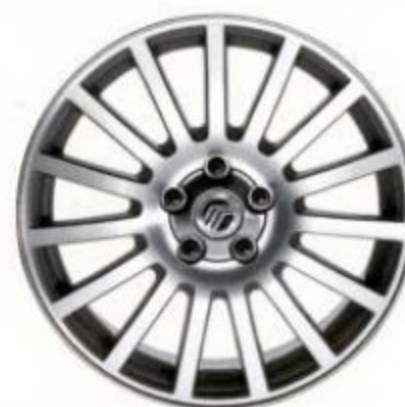
18" 15-SPOKE MACHINED-ALUMINUM Standard on Montego Premier