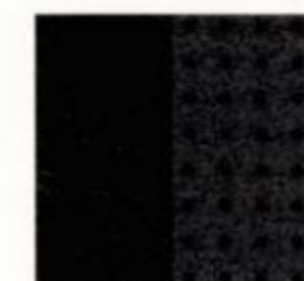
■ CHARCOAL BLACK LEATHER WITH MINI-PERFORATED INSERTS