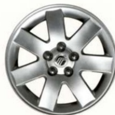
17" 7-SPOKE PAINTED-ALUMINUM Standard on Montego