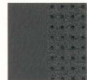
■ SHALE TWO-TONE LEATHER WITH MINI-PERFORATED INSERTS Not available on Dune Pearl