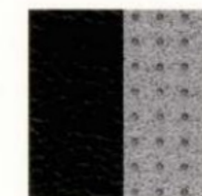
CHARCOAL LEATHER/ LIGHT FLINT PREFERRED SUEDE INSERTS