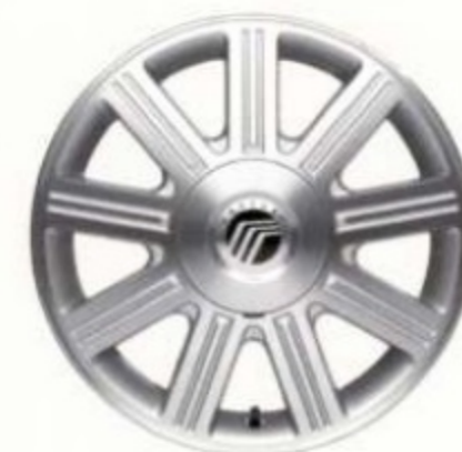
17" 9-SPOKE BRIGHT MACHINED-ALUMINUM Available