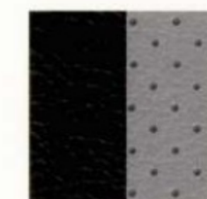
CHARCOAL LEATHER/ LIGHT FLINT PERFORATED INSERTS