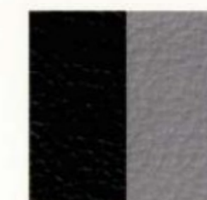
CHARCOAL LEATHER/ LIGHT FLINT INSERTS