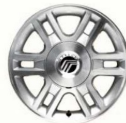
16" 6-SPLIT-SPOKE BRIGHT MACHINED-ALUMINUM Standard