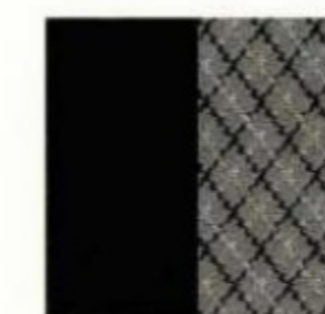
CHARCOAL CLOTH/ MEDIUM FLINT INSERTS