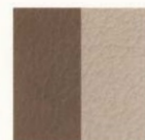
PEBBLE LEATHER/LIGHT PARCHMENT INSERTS