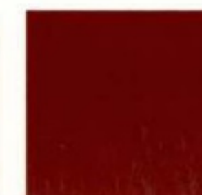
DARK TOREADOR RED