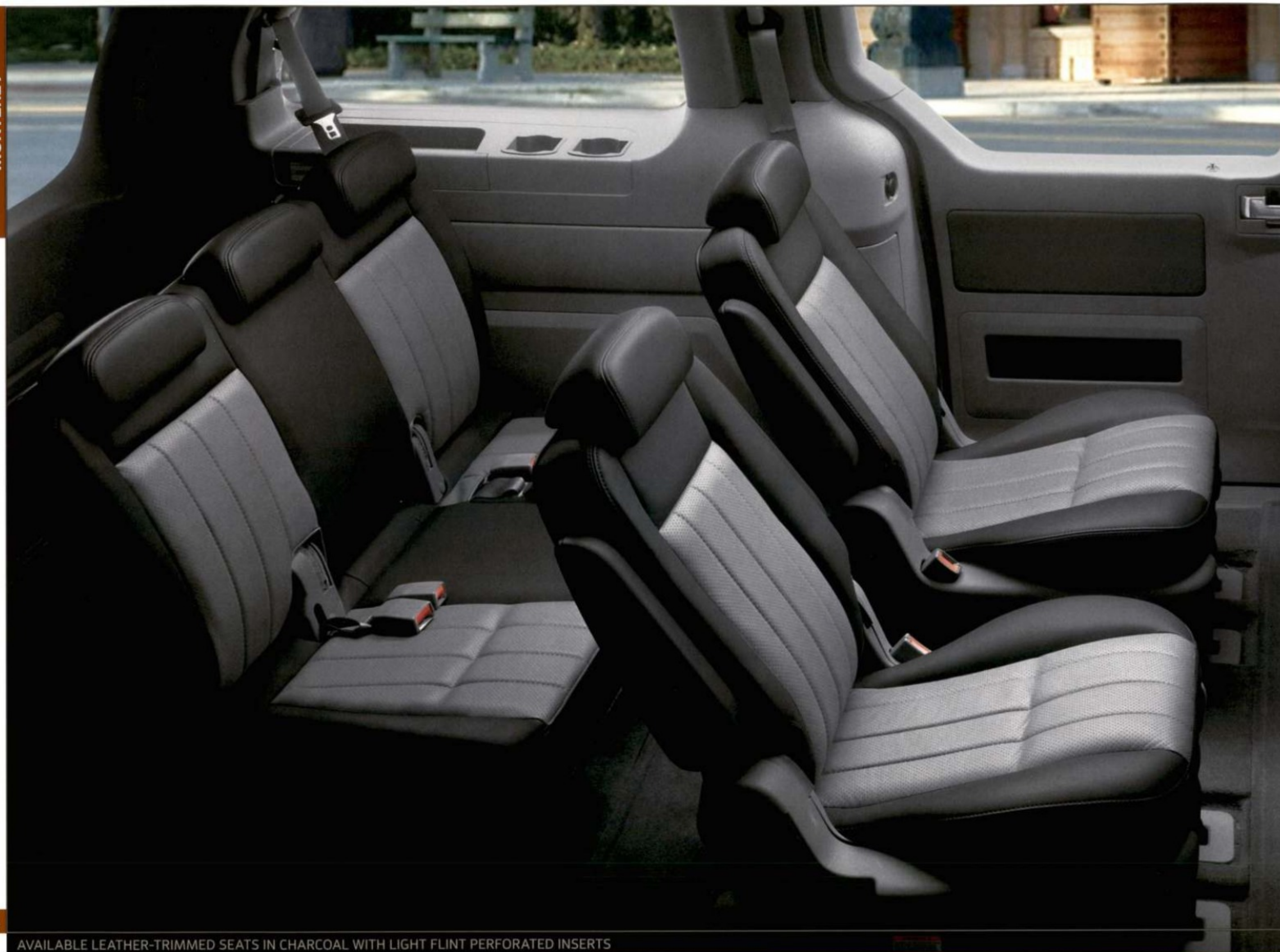
4 AVAILABLE LEATHER-TRIMMED SEATS IN CHARCOAL WITH LIGHT FLINT PERFORATED INSERTS