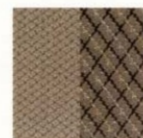
PEBBLE CLOTH/ PEBBLE INSERTS