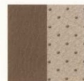
PEBBLE LEATHER/ LIGHT PARCHMENT PERFORATED INSERTS