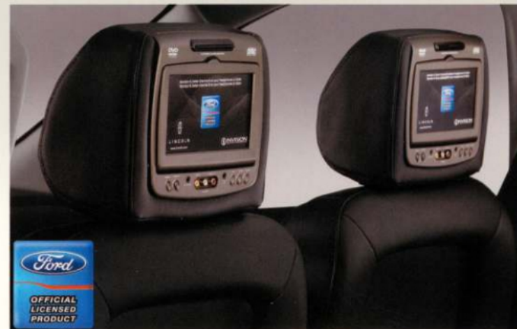
Headrest DVD Entertainment System

Ask your Lincoln or Mercury Dealer for details on these and other upcoming Ford Licensed Accessories.