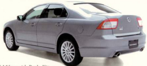
2007 Milan with Body Kit