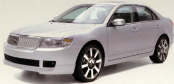
2007 Zephyr and 2007 MKZ with Body Kit

Our new Ford Licensed Accessories Program makes it faster than ever to bring you the popular products you want. Check out the bold body kits for the Zephyr, MKZ and Milan. They're available in 4-piece and 5-piece kits. And you can keep the kids occupied and friends entertained with the latest in on-the-road DVD technology: our new Headrest DVD Entertainment System, featuring two independent systems with 7" LCD widescreen monitors.