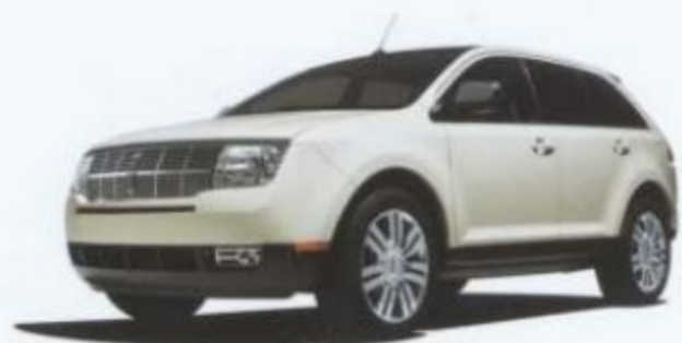
ALL-NEW 2007 LINCOLN MKX