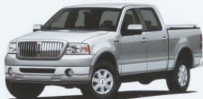
2006 MARK LT