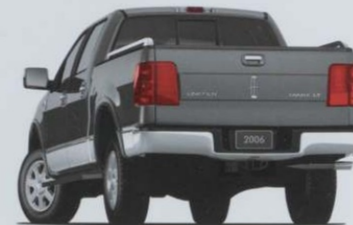
2006 MARK LT

Fully functional 5.5' bed. Throaty 3-valve V-8 engine with loads of low-end torque. And more luxury features than most trucks could even carry. So whether you tow, haul or explore the road less traveled, just relax and enjoy Mark LT's powerful performance, full functionality and true Lincoln luxury.