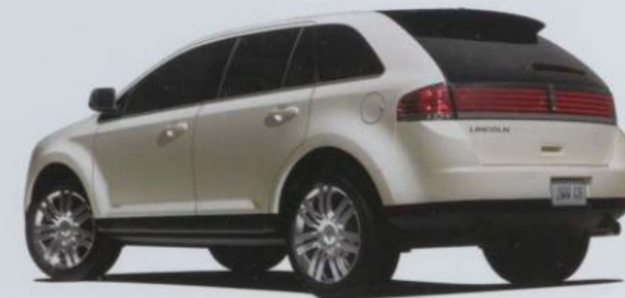
ALL-NEW 2007 LINCOLN MKX Arriving Fall 2006

With a jeweled grille up front, dramatic LEDs in the rear, and perfect proportions in between, the all-new 2007 Lincoln MKX fully reveals your penchant for dramatic design. Its agile road manners will smooth your quest for success, while your outlook will be brightened by MKX's optional Vista Roof™ full-glass panoramic moonroof.