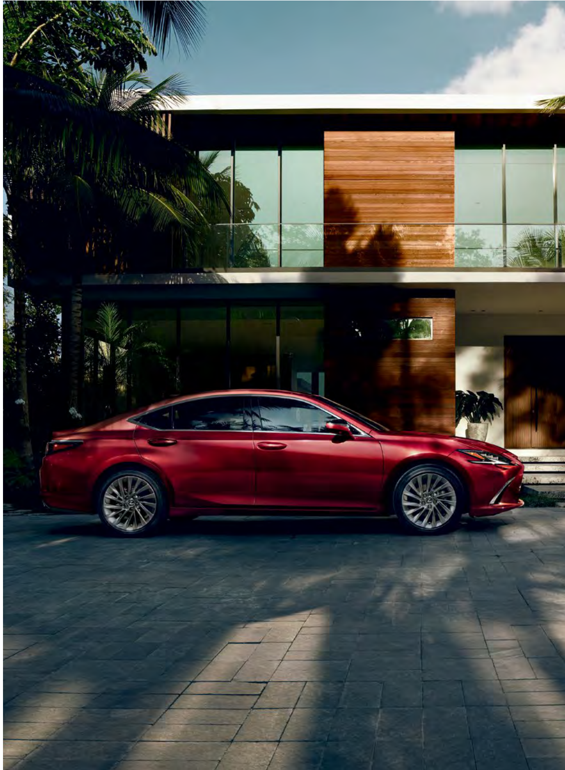
ES shown in Matador Red Mica