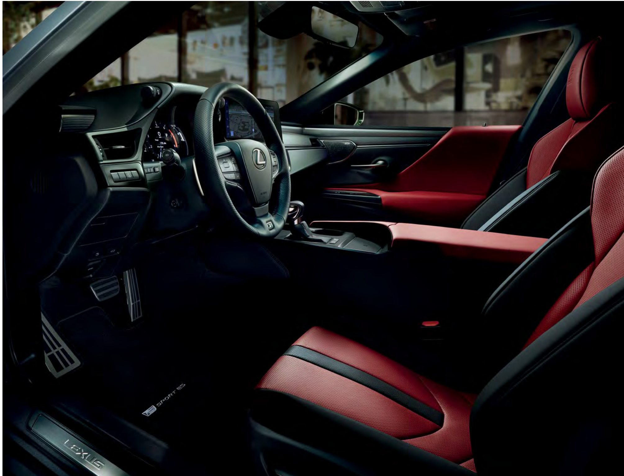
ES F SPORT Handling shown with Circuit Red NuLuxe® and Hadori Aluminum interior trim