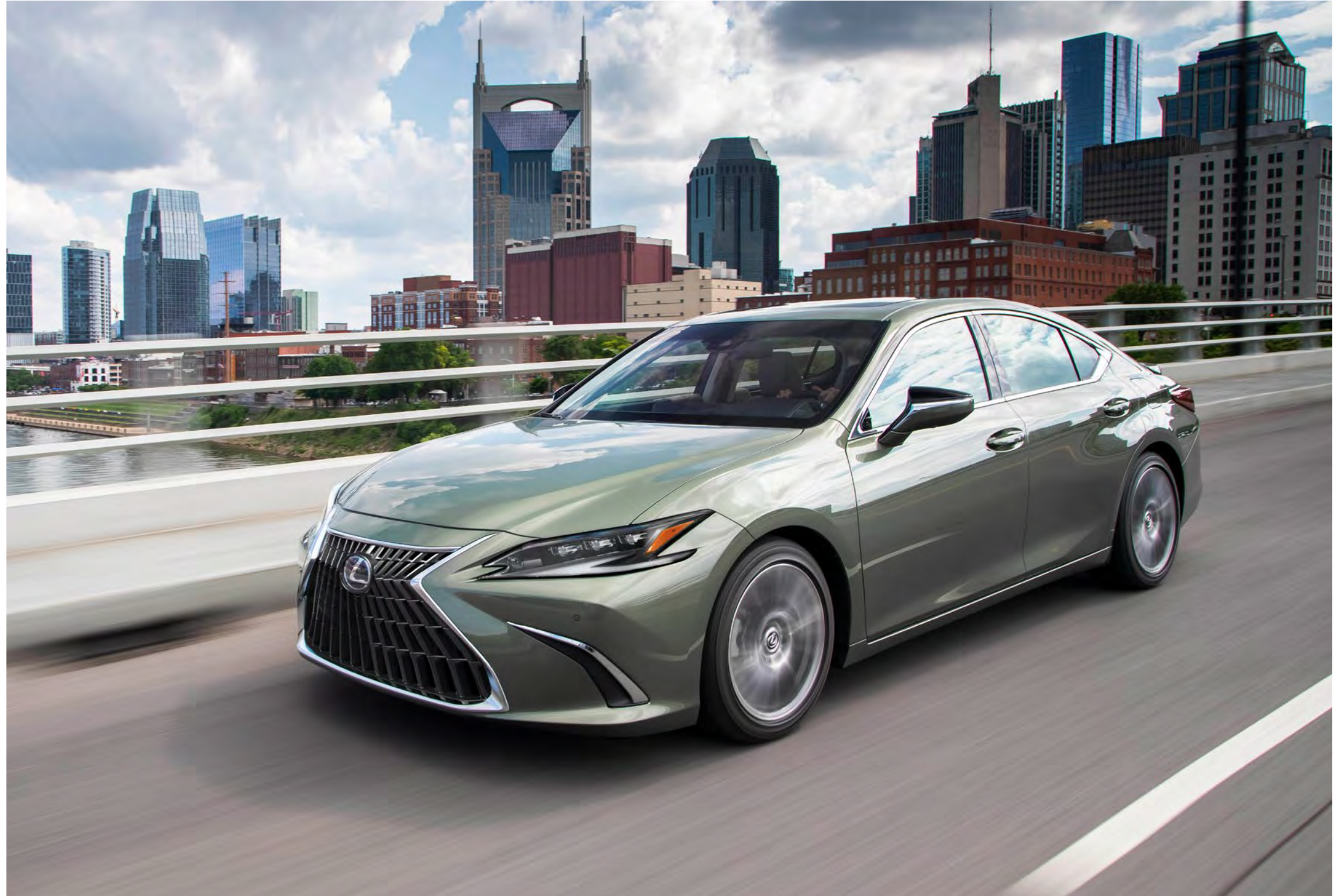
ES Hybrid shown in Sunlit Green

Combining next-generation hybrid technology and a highly potent 2.5-liter engine, this is the best of everything the ES has to offer. Its battery is not only remarkably small and lightweight but also strategically placed as close to the middle of the vehicle as possible for optimized front/rear weight distribution and a lower center of gravity. And with paddle shifters that deliver driving dynamics similar to the ES 250 AWD and ES 350, the ES Hybrid and ES Hybrid F SPORT models bring you even more of the amazing performance you've come to expect. Pairing powerful performance with a manufacturer-estimated 44 MPG combined, 2 it isn't just the most fuel-efficient Lexus sedan—it's the most fuel-efficient among all non-plug-in luxury sedans, 1 period.