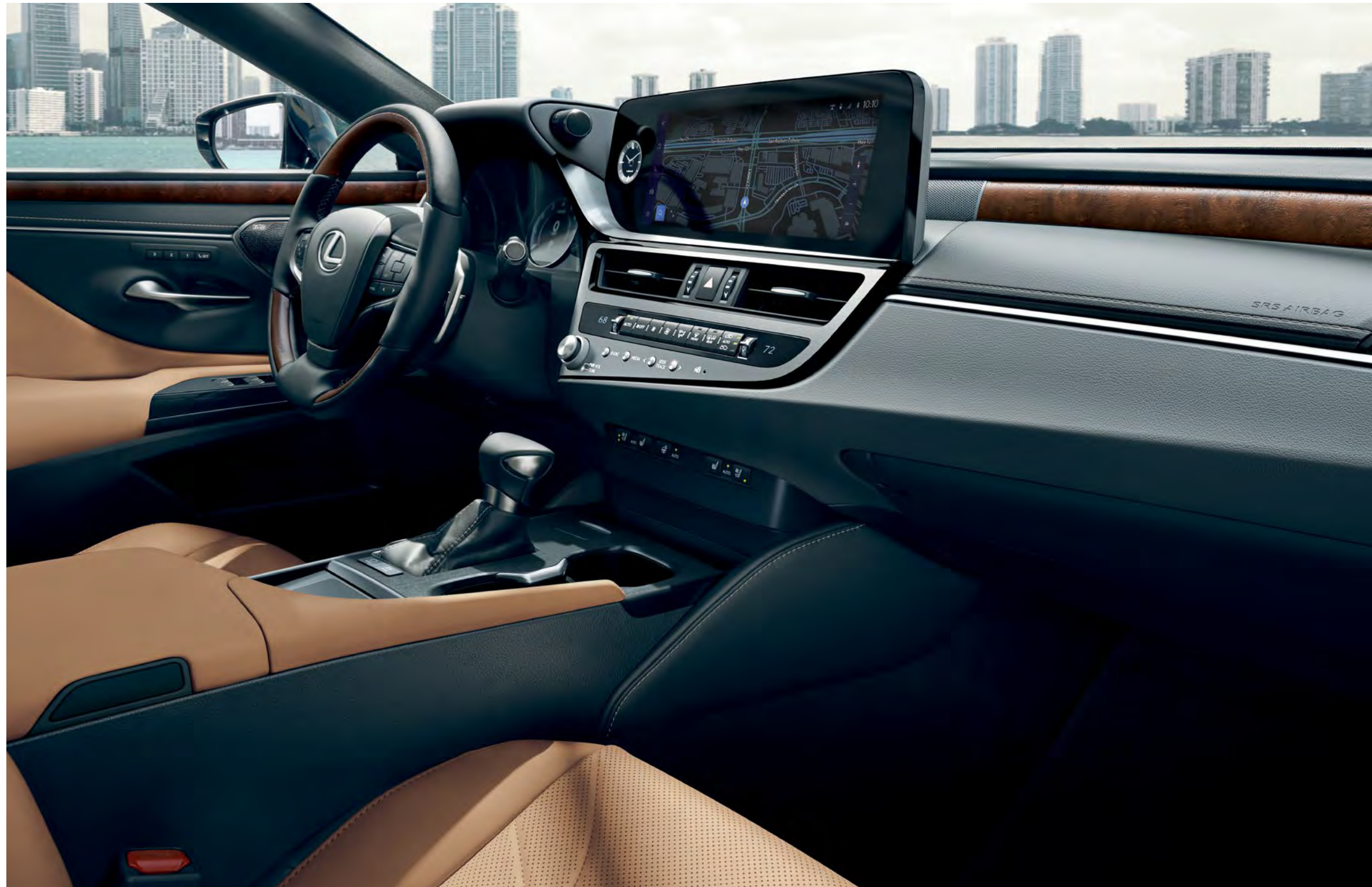
ES Hybrid shown with Palomino semi-aniline leather and Open-Pore Brown Walnut interior trim

With contemporary styling and cutting-edge technology, the ES offers a refreshing point of view on modern luxury. Discover thoughtful amenities like 10-way power-adjustable front seats with available heating and ventilation, designed to envelop you and connect you to the road. Unlike conventional ventilated seats, these pull air directly from the climate-control system to more effectively and efficiently cool you. These refined luxuries are complemented by numerous expressions of modern style and technology—from an intuitively positioned available 12.3-inch touchscreen display to available ambient lighting that accentuates the sculpted lines throughout the cabin.