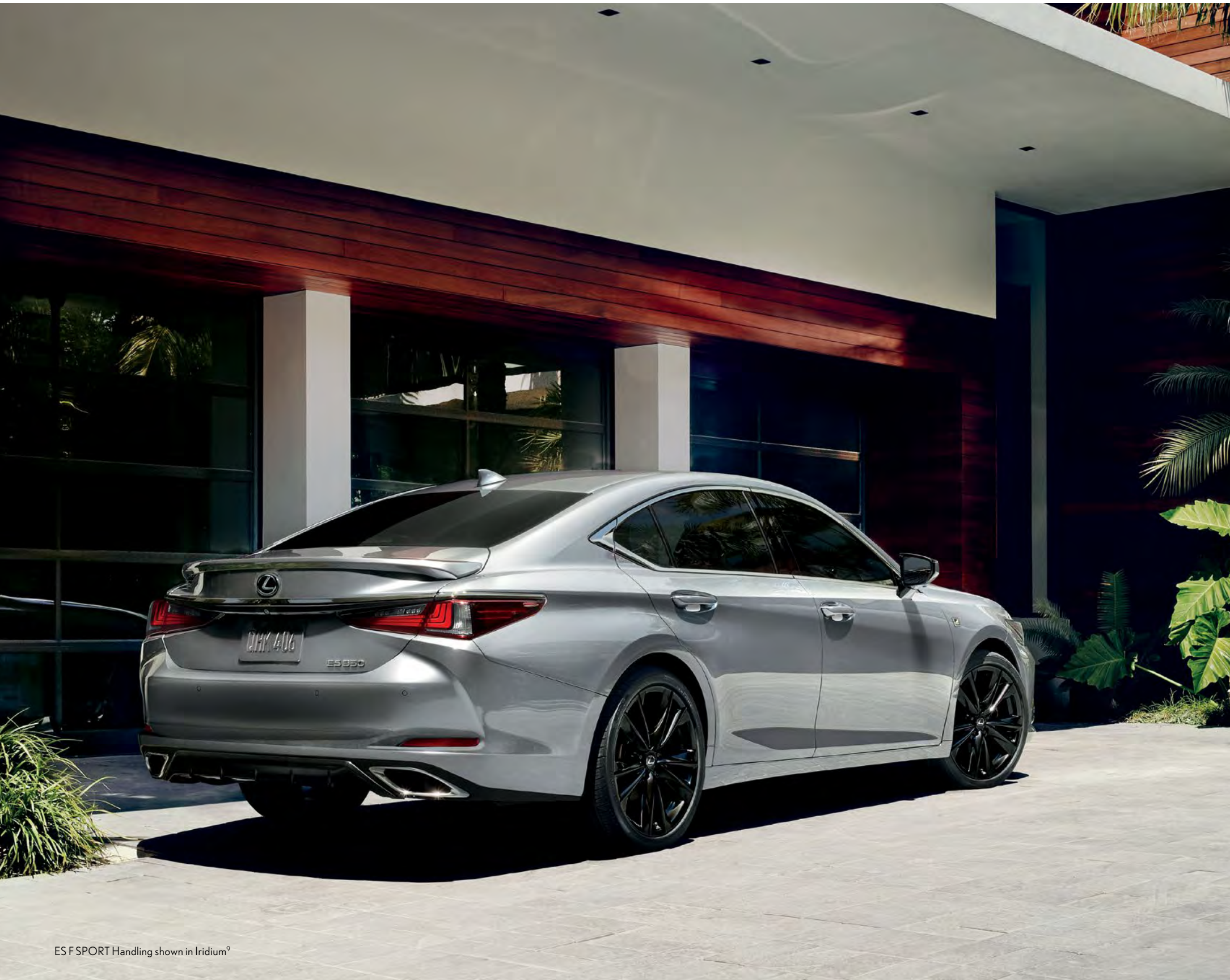
ES F SPORT Handling shown in Iridium 9