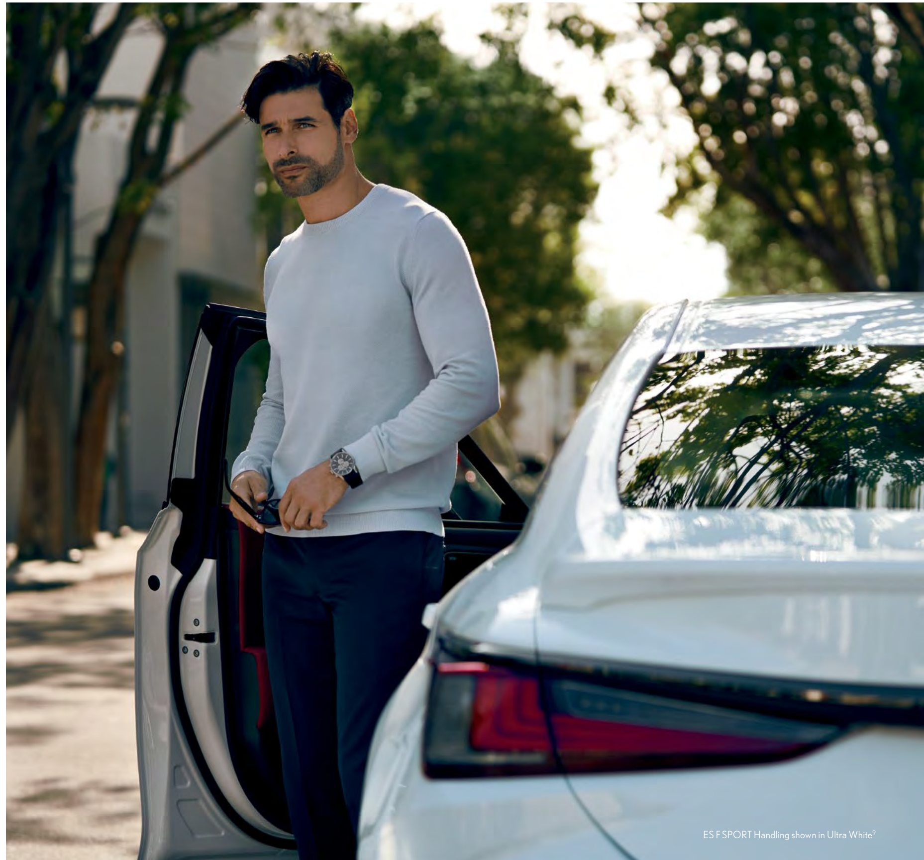
ES F SPORT Handling shown in Ultra White 9