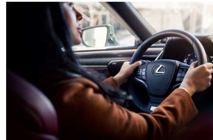
ES Hybrid shown with Apple CarPlay integration, Palomino semi-aniline leather and Open-Pore Brown Walnut interior trim

Featuring Lexus Interface 6 and innovations including wireless Apple CarPlay ®7 integration and an available Mark Levinson ®4 PurePlay audio system, the ES helps keep you connected.