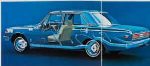
Some of the outstanding features

FULLY TRANSISTORIZED AM/FM RADIO or AM RADIO AND STEREO TAPE DECK are all available as options.