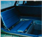
Illustration: Seats and instrument panel of the Crown series.