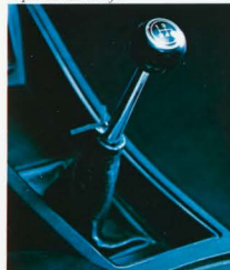
4-speed manual shift