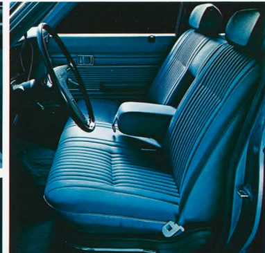
Comfortable, colored interior