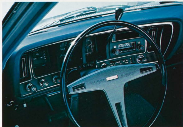
Cockpit type instrument panel

Front and rear seats have seat belts with pushbutton buckles, front seats have shoulder harness and all front seats adjust up to 5.5in. fore and aft. A flo-thru ventilation system keeps this luxurious interior always filled with fresh, clean air. Life on the road takes on a new quality in a Crown. See for yourself what special enjoyment this motorcar offers you.