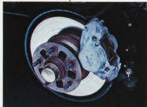
Front disc brakes