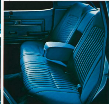
Spacious rear seat with seat belts