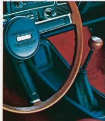
Hardtop's steering wheel