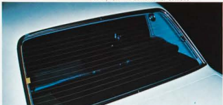
Rear window glass with heating wires