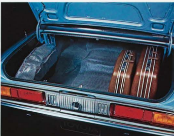
Spacious trunk with floor mat and spare tire cover