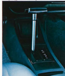
3-speed automatic shift