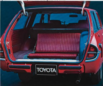
Fold-down type third seat on the Wagon