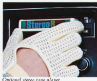
Optional stereo tape player