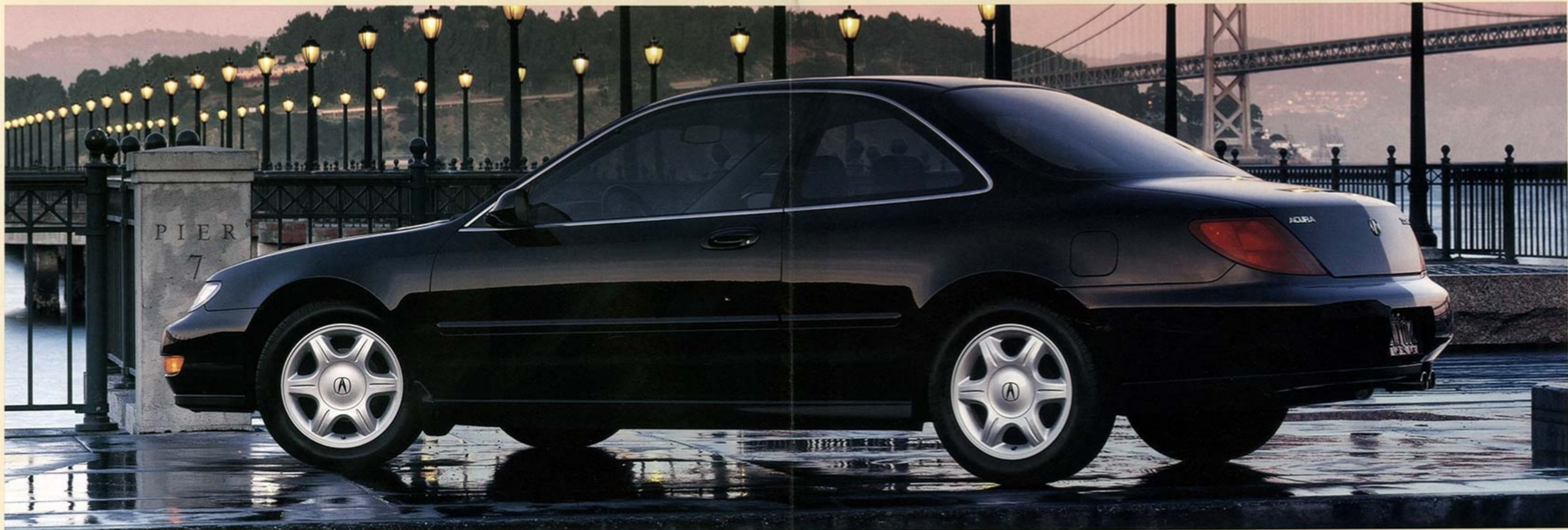
2.2CL shown in Flamenco Black Pearl

The all-new, made-in-America Acura CL is a breakthrough automobile—one that combines the powerful visual impact and gratifying comfort of a classic luxury coupe with the safety, performance and sophistication of a state-of-the-art sports touring car. As lavishly equipped as it is beautiful, the Acura CL sets an exciting new standard of style and refinement in the luxury sports coupe class.