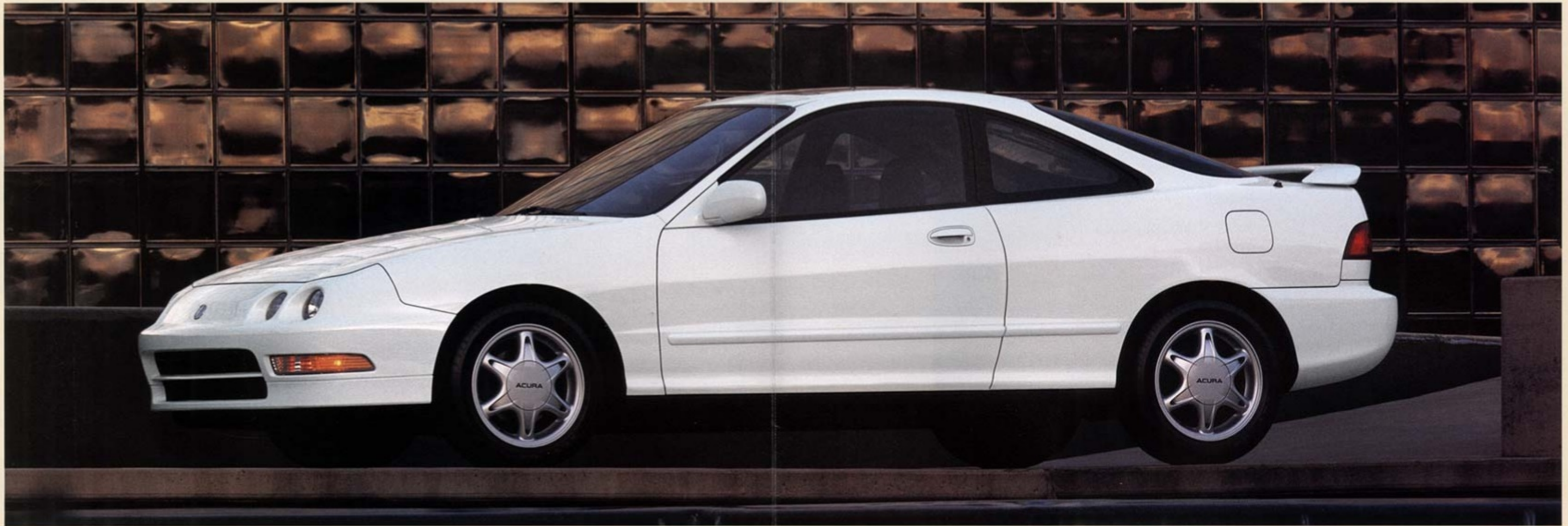
Integra GS-R Sports Coupe shown in Frost White

The Acura Integra Sports Coupe and Sports Sedan combine pulse-quickening performance, sensuous styling, engaging comfort and a