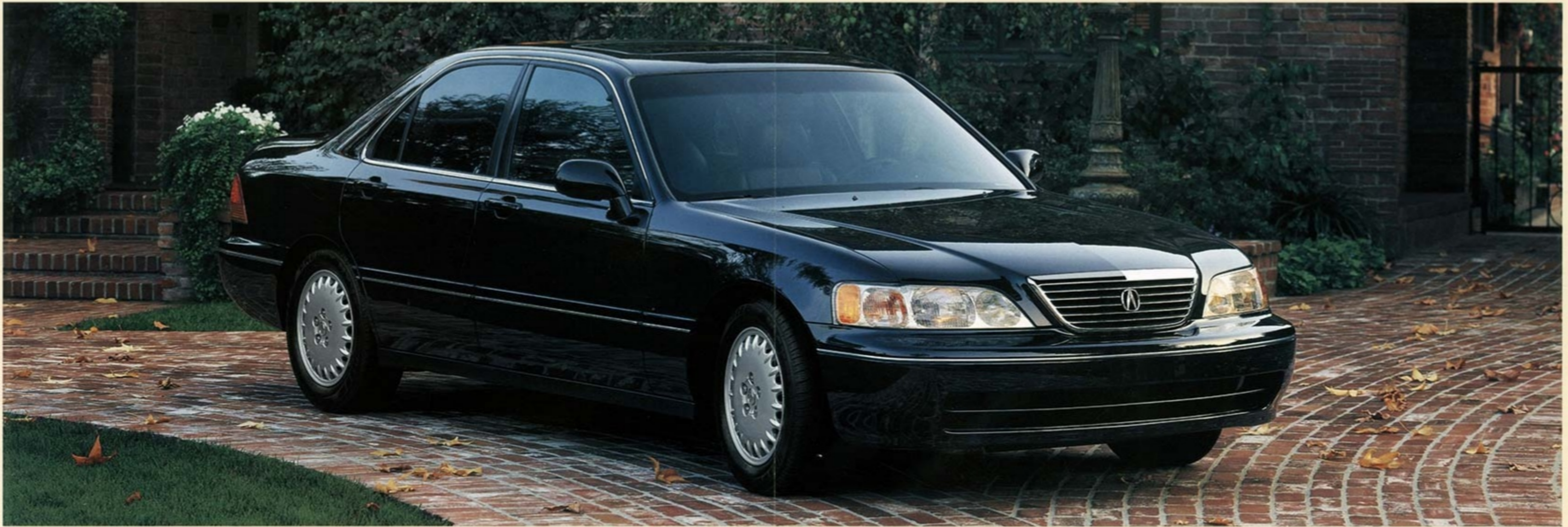
3.5RL shown in Flamenco Black Pearl

A decade ago, Acura changed forever how the world thinks about luxury automobiles. Now, with the introduction of the new Acura RL, we've