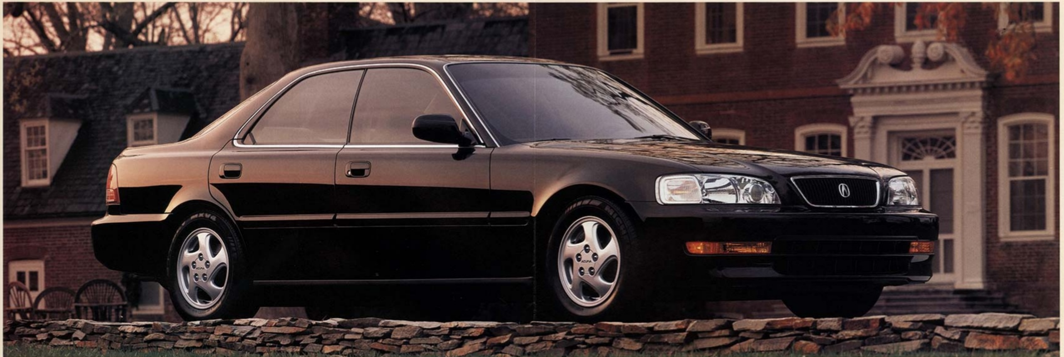
3.2TL shown in Flamenco Black Pearl

The TL Series of touring luxury sedans brings the comfortable interior, impressive amenities and remarkable performance of a flagship luxury