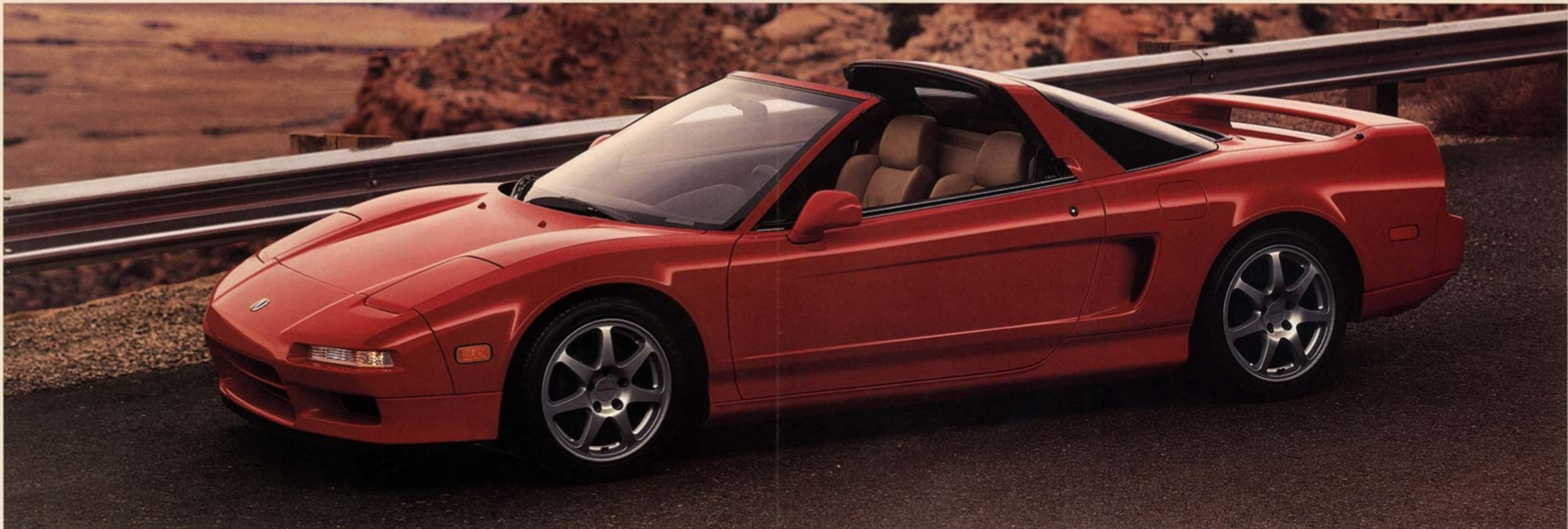
NSX-T shown in Formula Red

The NSX is, by all accounts, a remarkable exotic sports machine. But its stunning technology and breakthrough performance make it something