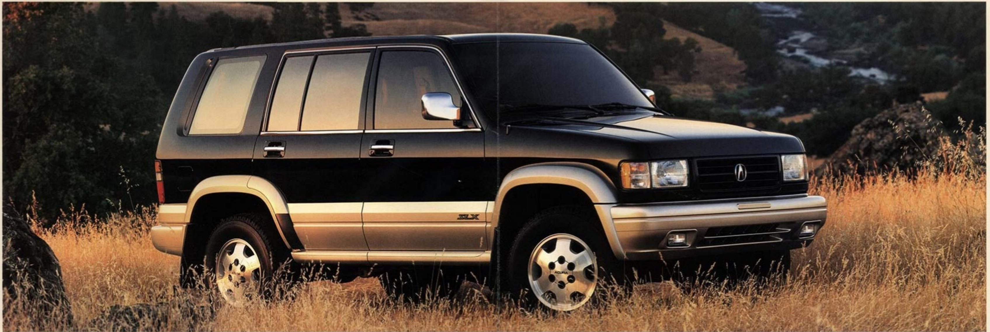
SLX with Premium Package shown in Ebony Black

The new Acura SLX sport luxury vehicle offers a truly remarkable range of talents, blending all-weather, multi-terrain performance