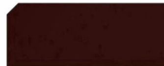
DEEP AUBURN PEARL