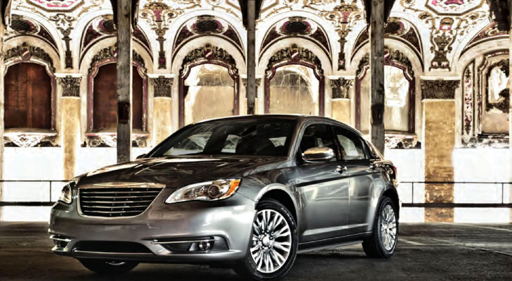
200 Limited shown in Tungsten Metallic

RAISE YOUR STANDARDS. IT HAS BEEN BUILT WITH PROMISE AND WITHOUT COMPROMISE. IT BOASTS ONE OF THE MOST POWERFUL V6 ENGINES IN ITS CLASS. (1) THE DYNAMIC RIDE AND HANDLING, OUTSTANDING V6 FUEL ECONOMY, AND LUXURY CONTENT ADD PREMIUM COMFORT AND CONVENIENCE TO YOUR DAILY COMMUTE.