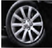
Standard (See LX for cloth options.)