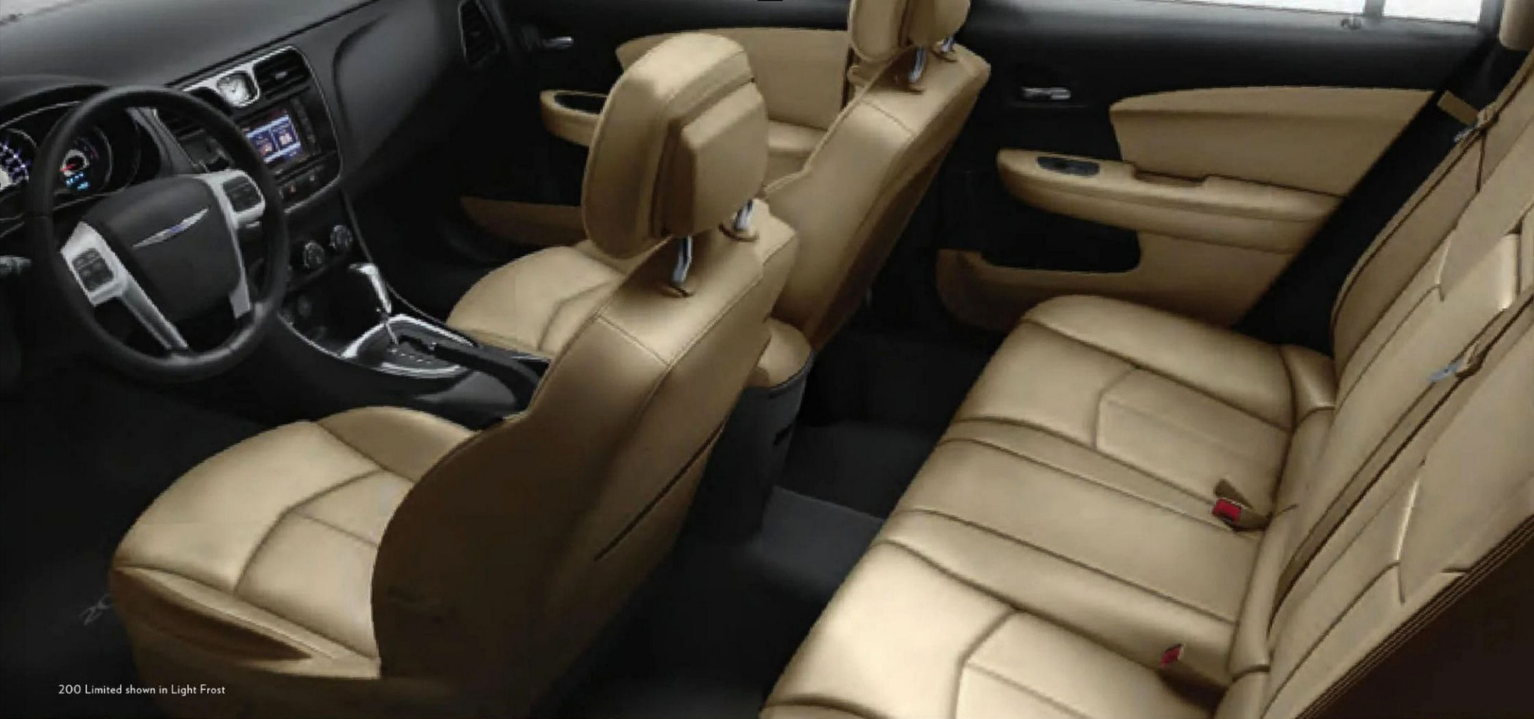
200 Limited shown in Light Frost