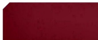
DEEP CHERRY RED CRYSTAL PEARL