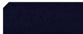
TRUE BLUE PEARL