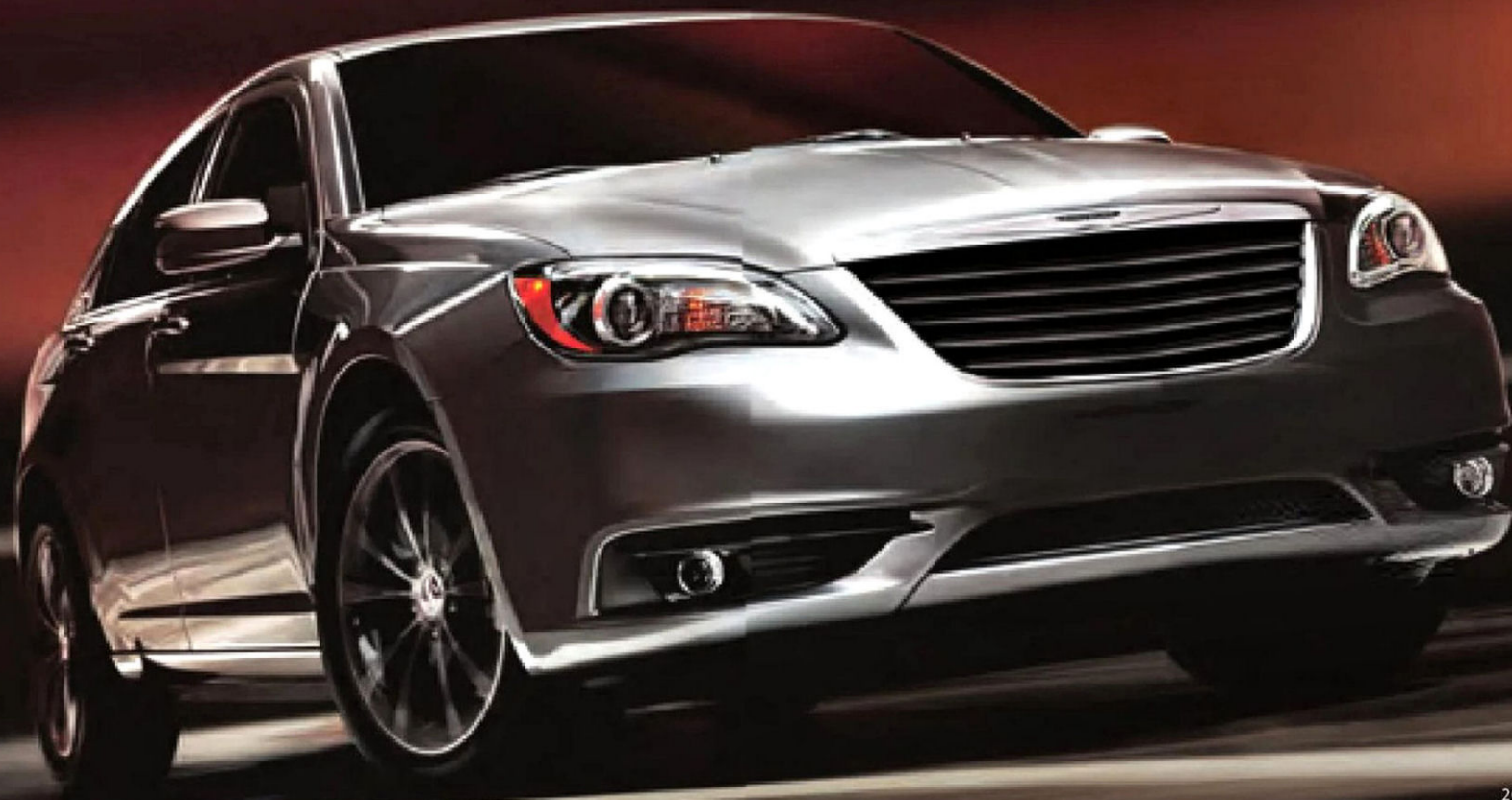
200 S shown in Billet Metallic