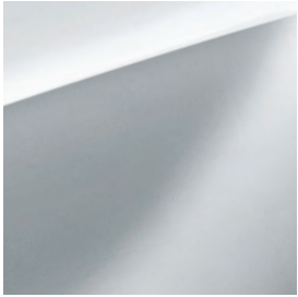
Snow White Pearl