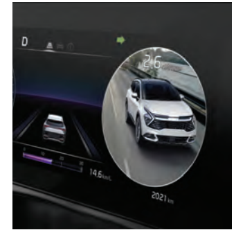
Blind view monitor displays the blind spot in the direction your turn signal is indicating.*