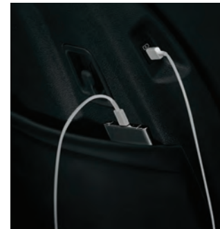
USB charging ports for rear passengers are located in the seatbacks ahead of them.