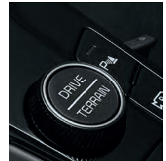
Terrain mode helps provide improved traction and control in mud, snow and sand.