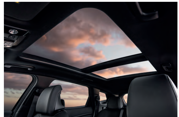
The panoramic sunroof lets the sunshine in for a brighter and airier cabin.