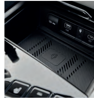
Wireless charging keeps your smartphone charged while you're on the road.