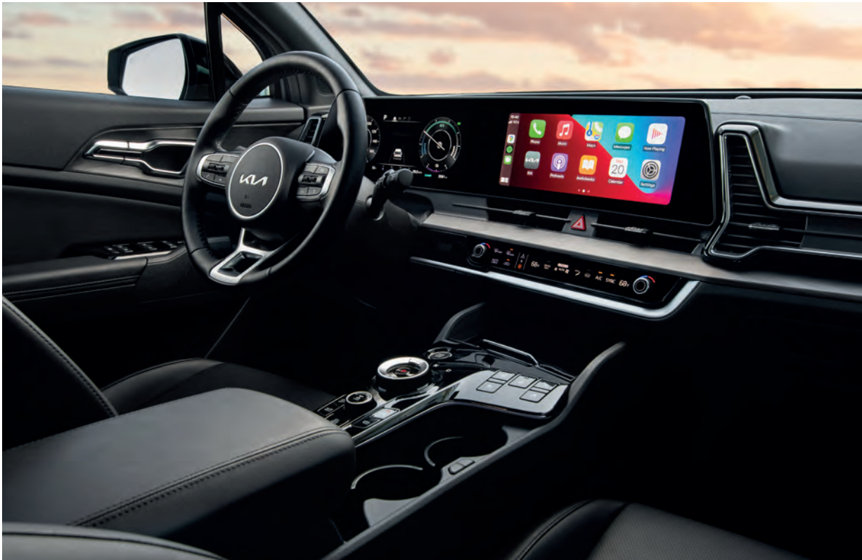
A 12.3" multimedia interface gives you at-a-glance control of navigation, audio and various vehicle system functions.