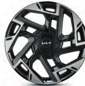
19" alloy wheels