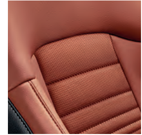
SX Carmine Red quilted leather (synthetic)