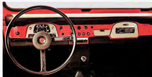
Hardtop and Vinyltop

Options: Power take-off winch. Electric winch with 8000-pound rated capacity. Free-wheeling front hubs. Wheel covers with hub holes. AM radio. Stereo tape system. Stereo FM cartridge (8-track required). Mud and snow tires. Indoor/outdoor carpeting. Floor mats for Hardtop and Vinyltop. And factory installed air conditioning for the Station Wagon.