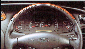
Luxury Momo steering wheel.