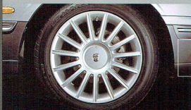
Unique 'Elegance' 17" wheel.