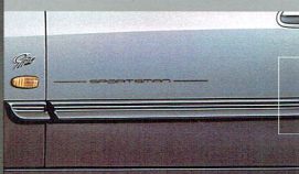
Distinctive two-tone exterior colour scheme†