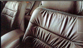
Luxury leather trim.