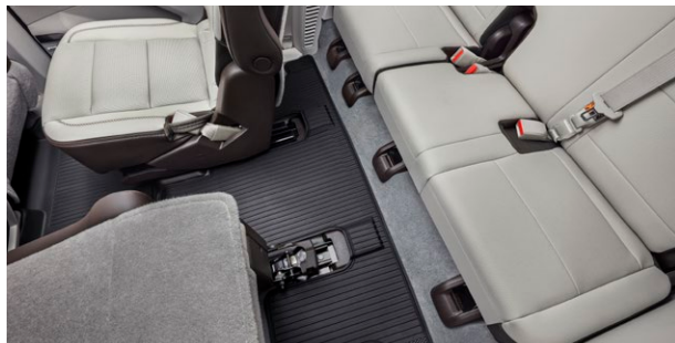
THIRD-ROW ONE-PIECE PREMIUM ALL-WEATHER FLOOR LINER IN JET BLACK