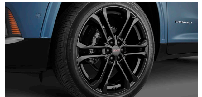
22" 6-SPLIT-SPOKE WHEELS IN GLOSS BLACK 1