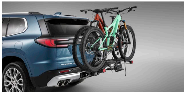
HITCH-MOUNTED 2-BIKE EASYFOLD XT BICYCLE CARRIER BY THULE®