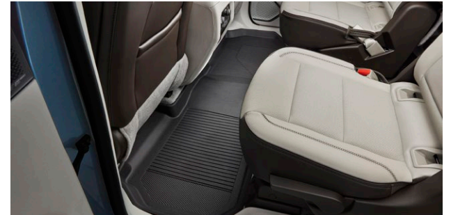
SECOND-ROW INTERLOCKING PREMIUM ALL-WEATHER FLOOR LINERS IN JET BLACK