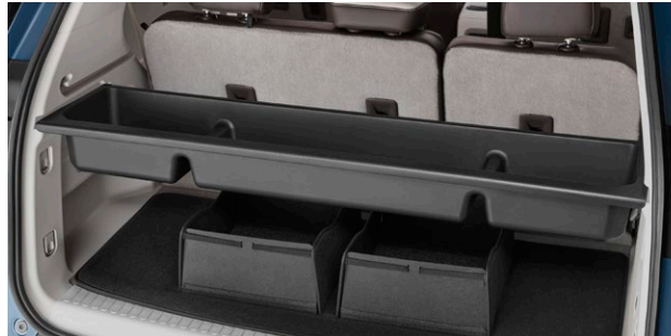
CARGO SHELF WITH DIVIDERS AND PREMIUM CARPETED CARGO AREA MAT WITH INTEGRATED CARGO BINS