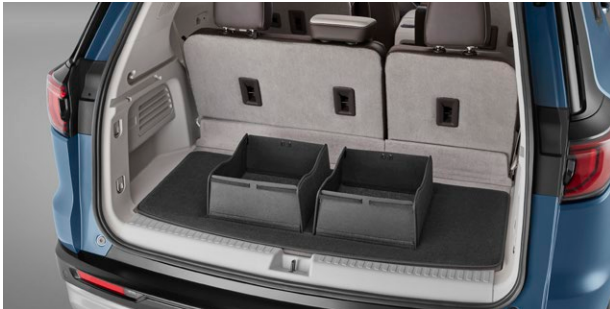
PREMIUM CARPETED CARGO AREA MAT IN JET BLACK WITH INTEGRATED CARGO BINS