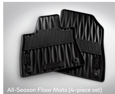
All-Season Floor Mats (4-piece set)