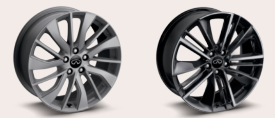
19 X 7.5-inch silver-painted aluminum-alloy wheels 20 X 8.5-inch dark-painted and machine-finished aluminum-alloy wheels**

*INFINITI has taken care to ensure that the color swatches presented here are the closest possible representations of actual vehicle colors. Swatches may vary slightly due to the printing process and whether viewed in daylight, fluorescent or incandescent light. Please see the actual colors at your retailer. **Extra cost option.