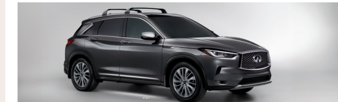
Accessories shown: Black Roof Rail Crossbars, 13 Matte Chrome Outside Mirror Covers, Matte Chrome Body Side Moldings, INFINITI Radiant® Exterior Welcome Lighting w/ Logo, Front and Rear Splash Guards, Matte Chrome Front Lip Finisher and Painted Silver Grille w/o Camera