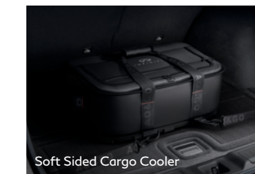
Soft Sided Cargo Cooler

INTERIOR Embrace your adventurous nature with All-Season Floor Mats (4-piece set) that collect dirt and debris, preserving your interior footwells. Keep your everyday essentials organized and handy with a Seatback Organizer , designed to attach to the back of the front seat.