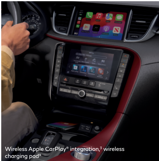
Wireless Apple CarPlay ® integration, 3 wireless charging pad 9