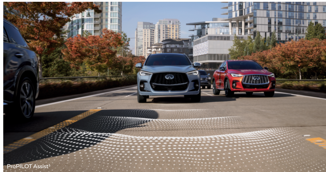
ProPILOT Assist 1