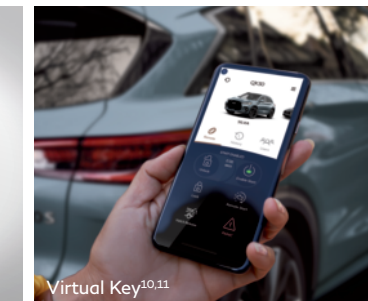
Virtual Key 10,11

EXTERIOR 20" Diamond Cut Bright Metallic Gray Painted Wheels add a commanding stance to your QX50's visual presence, while Black Roof Rail Crossbars integrate with a variety of Affiliated: Yakima® roof rack accessories to maximize your utility. 12,13 Protect your rear bumper from dings and scratches while enhancing your style with a Brushed Stainless Steel Rear Bumper Protector .