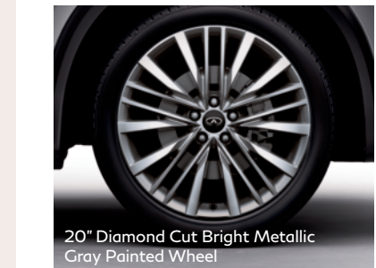
20" Diamond Cut Bright Metallic Gray Painted Wheel