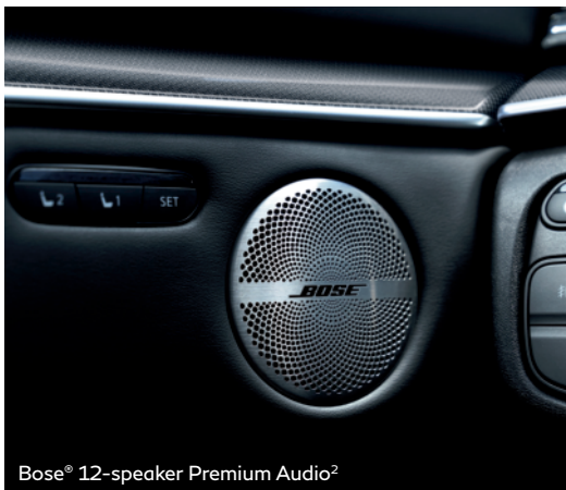
Bose ® 12-speaker Premium Audio 2