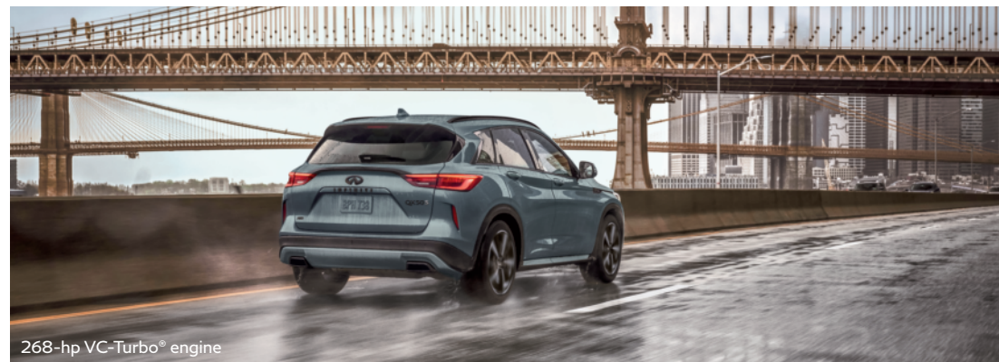
268-hp VC-Turbo ® engine