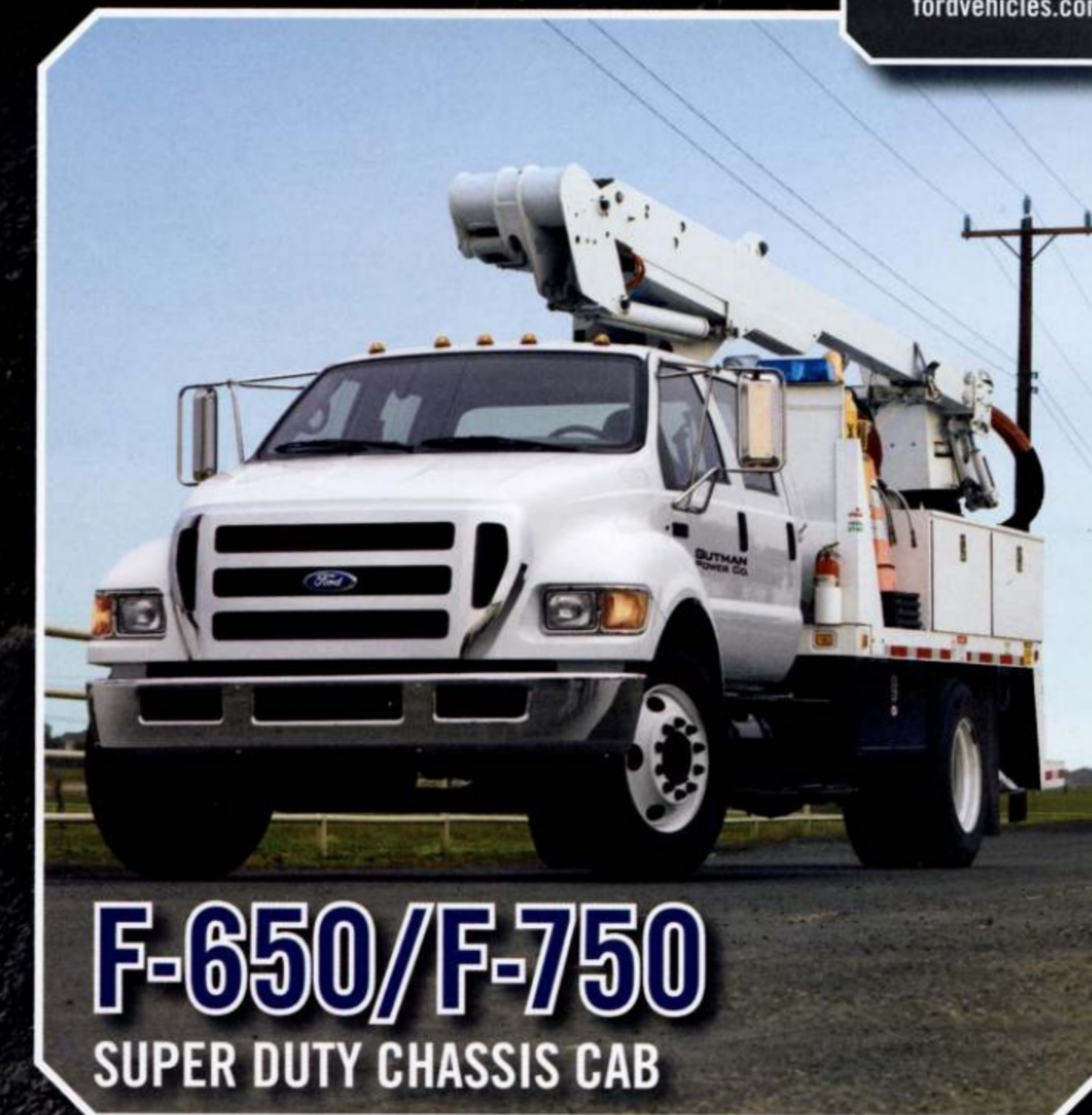
F-650/F-750 SUPER DUTY CHASSIS CAB