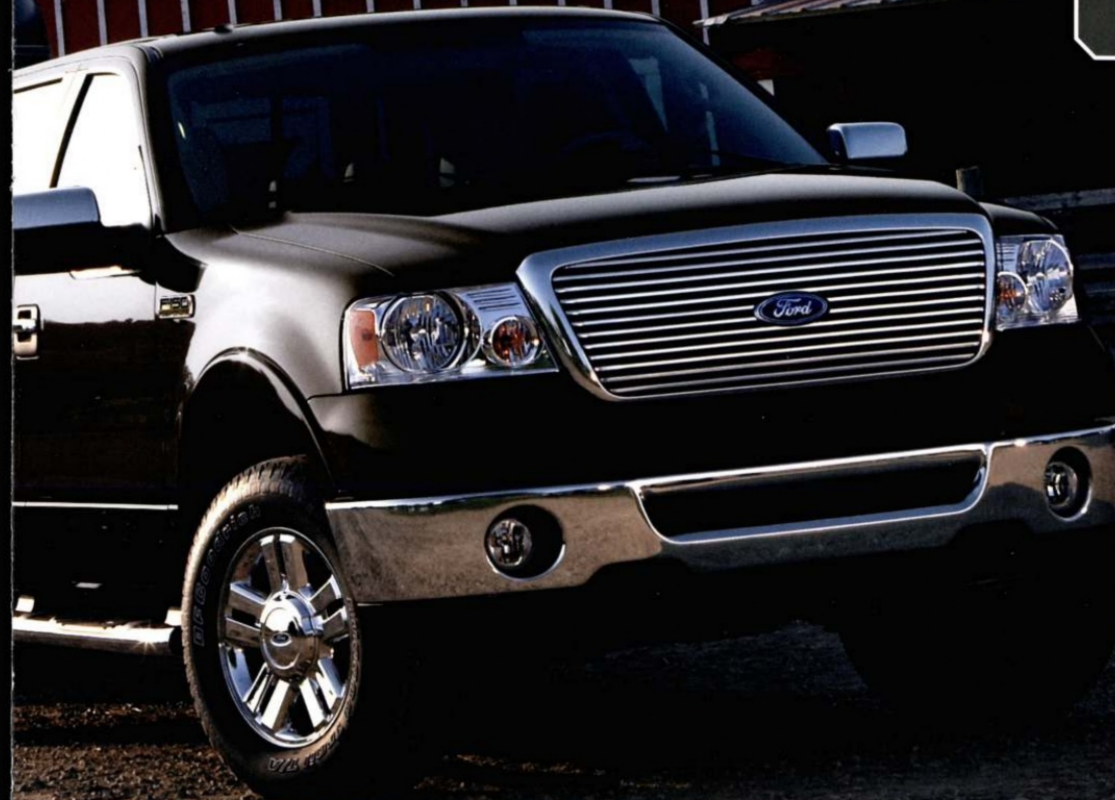
F-150 LARIAT SuperCrew 4x4 in Stone Green with optional LARIAT Chrome Package, 6.5' box and other equipment