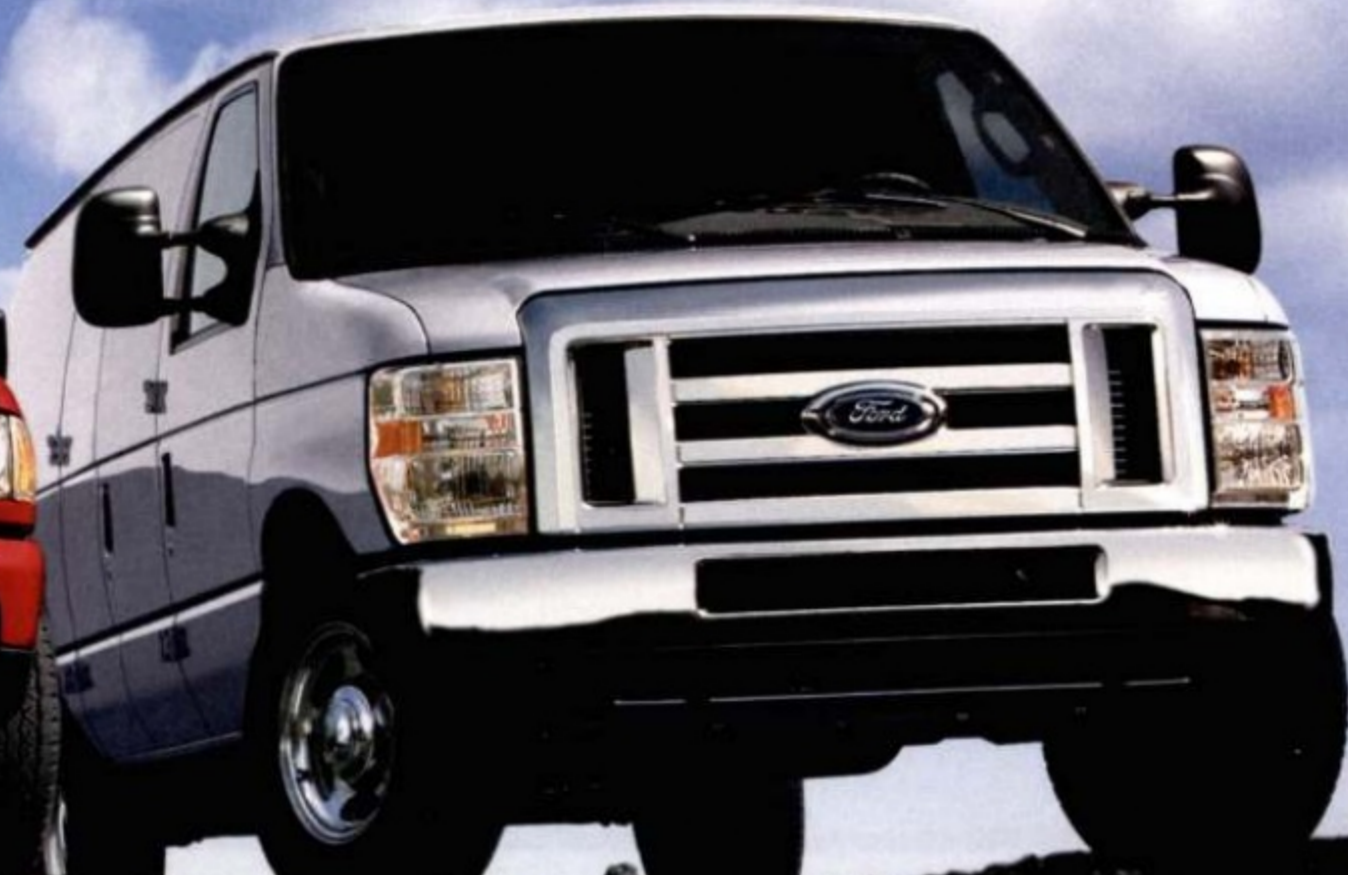
E-SERIES BEST-SELLING VAN – 28 YEARS