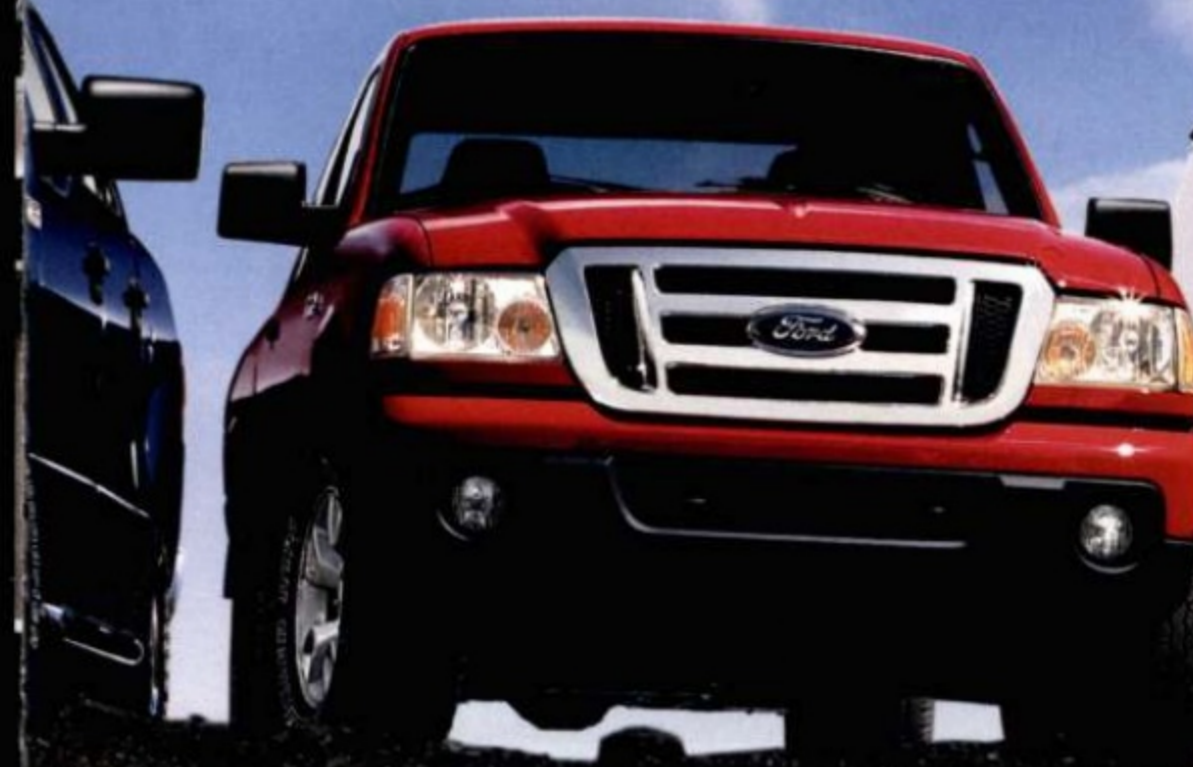
RANGER MOST FUEL-EFFICIENT PICKUP IN AMERICA