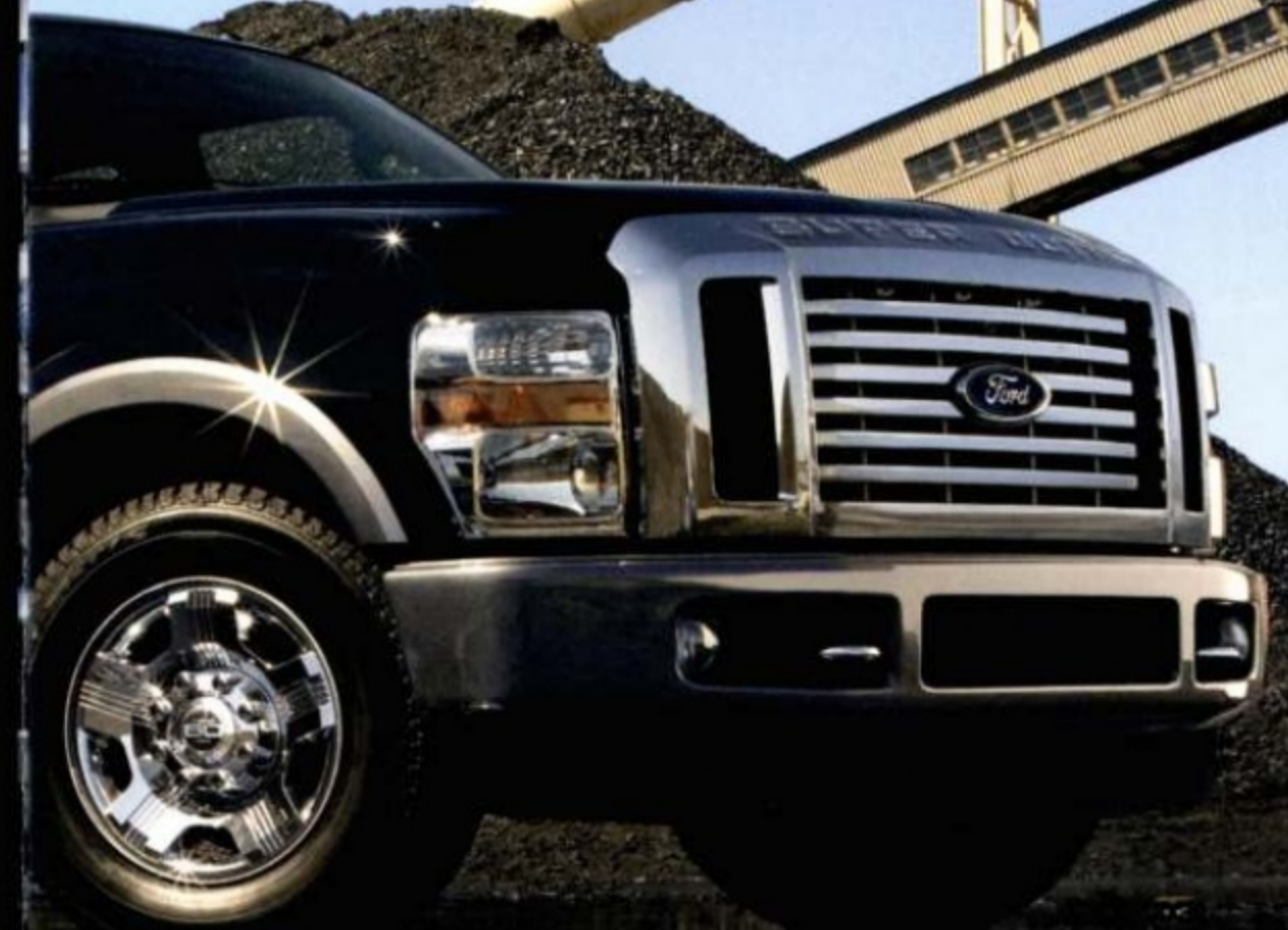
F-150 XLT 60 th Anniversary Edition in Dark Shadow Grey/Black two-tone and F-250 Super Duty XLT 60 th Anniversary Edition in Black/Dark Shadow Grey two-tone. Both shown with optional equipment.