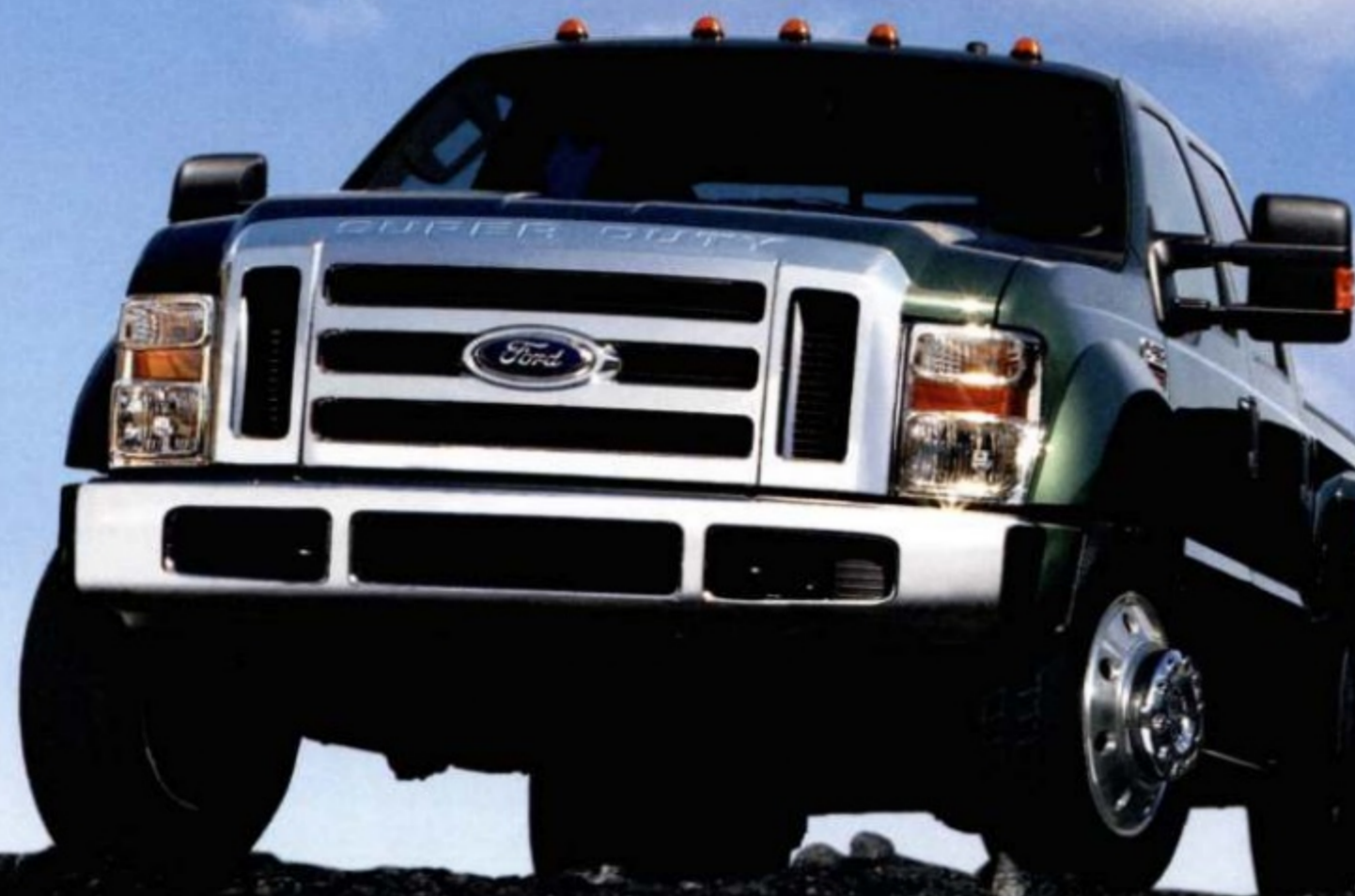
F-SERIES SUPER DUTY AMERICA'S MOST CAPABLE PICKUP