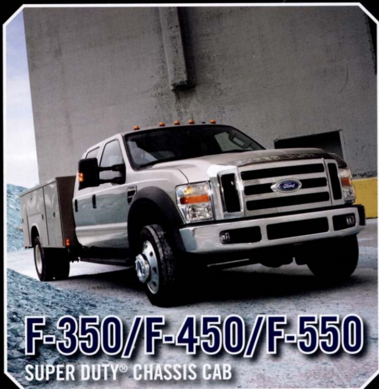
F-350/F-450/F-550 SUPER DUTY® CHASSIS CAB