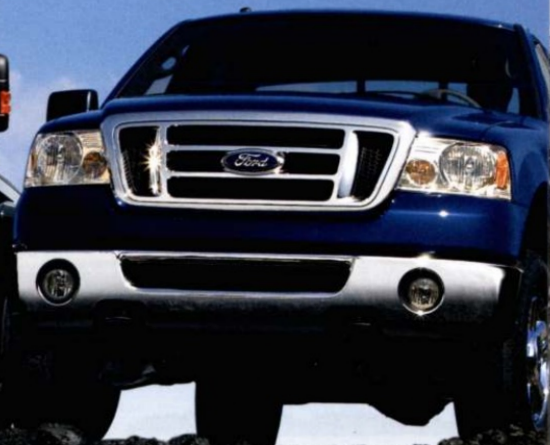
F-150 STRONGEST PICKUP IN ITS CLASS