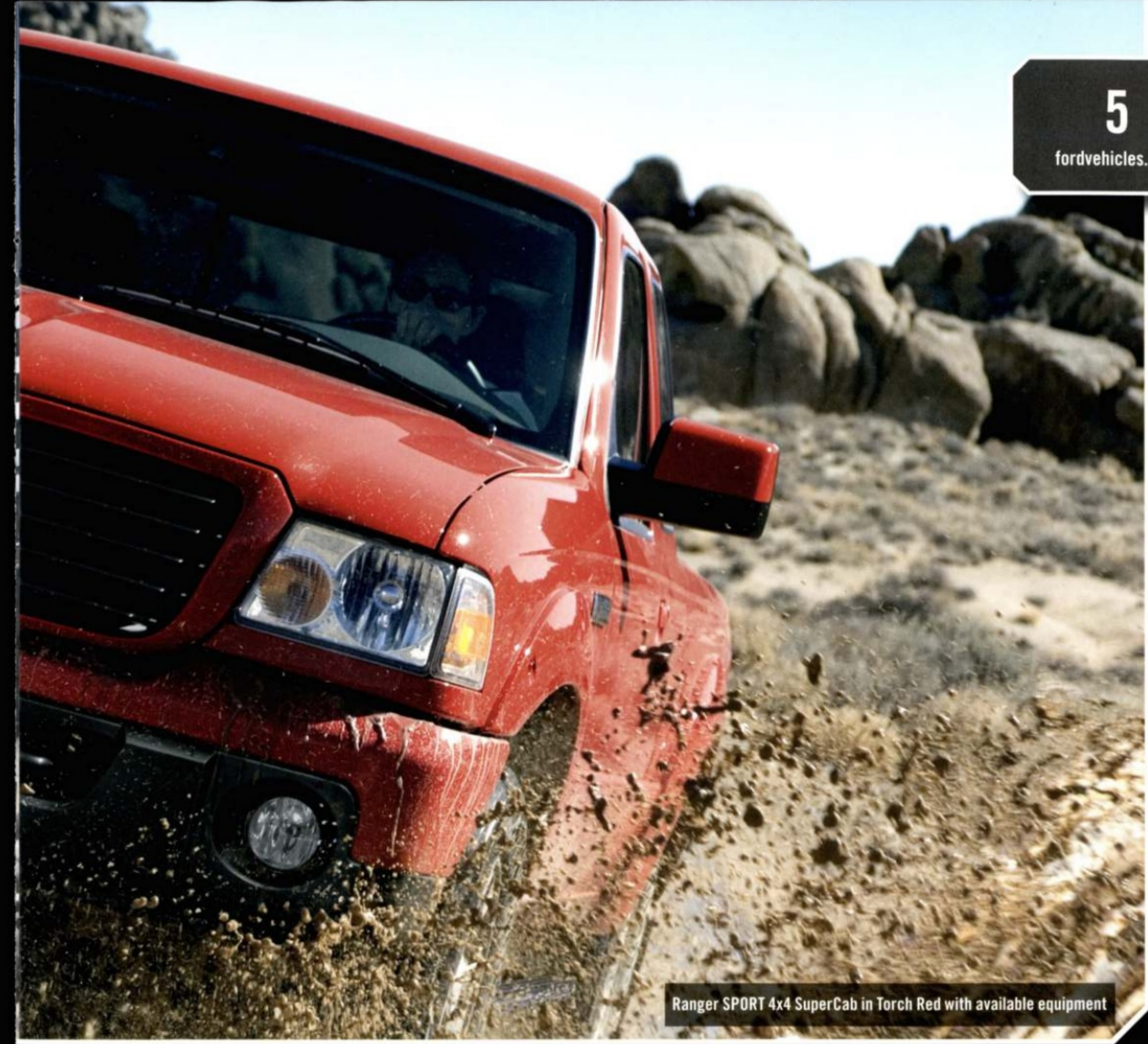
Ranger SPORT 4x4 SuperCab in Torch Red with available equipment