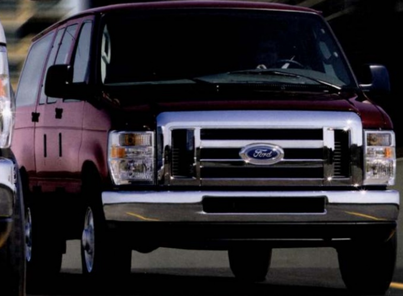
E-350 SRW Cutaway upfit in Oxford White, E-250 Cargo Van in Silver with Exterior Upgrade Package, and E-150 XLT Wagon in Dark Toreador Red. All shown with optional equipment.

DYNAMIC STRENGTH, VERSATILITY and Built Ford Tough ® determination give the new E-Series Cargo Vans, Cutaways and Wagons all the powers they need to help get your jobs done. From moving people and products, to delivering emergency medical care and more, no other line of full-size vans delivers so much flexibility and choice. With every E-Series boasting a GVWR of over 8,500 lbs., it's easier than ever to design vehicles that suit your needs. No wonder businesses, community organizations and families have made these hardworking heroes the best-selling vehicles in their class since 1979.