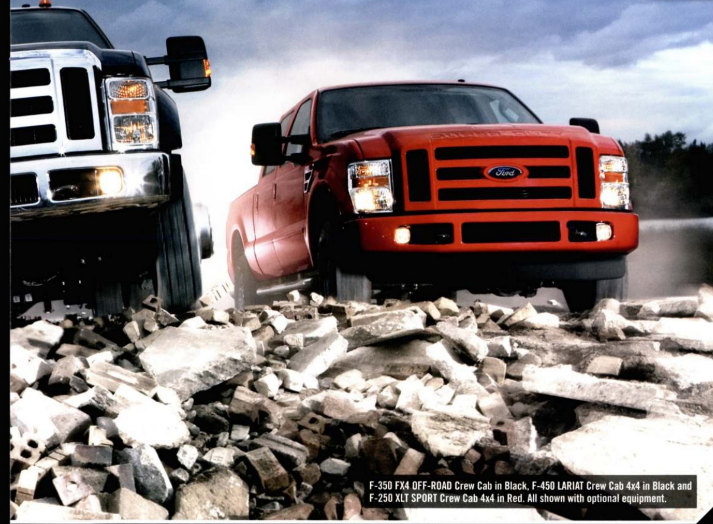
F-350 FX4 OFF-ROAD Crew Cab in Black, F-450 LARIAT Crew Cab 4x4 in Black and F-250 XLT SPORT Crew Cab 4x4 in Red. All shown with optional equipment.