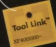
Tool Link RFID Tag

Full mobile office capability. Ford joins forces with Sprint®, MAGNETI MARELLI and Garmin® to offer a Microsoft® Auto Windows CE-based in-dash computing system with broadband Internet capability, 7 navigation and Bluetooth® functionality, all with the ease of a touch screen. Of course, it's ruggedly designed to operate in extreme temps.