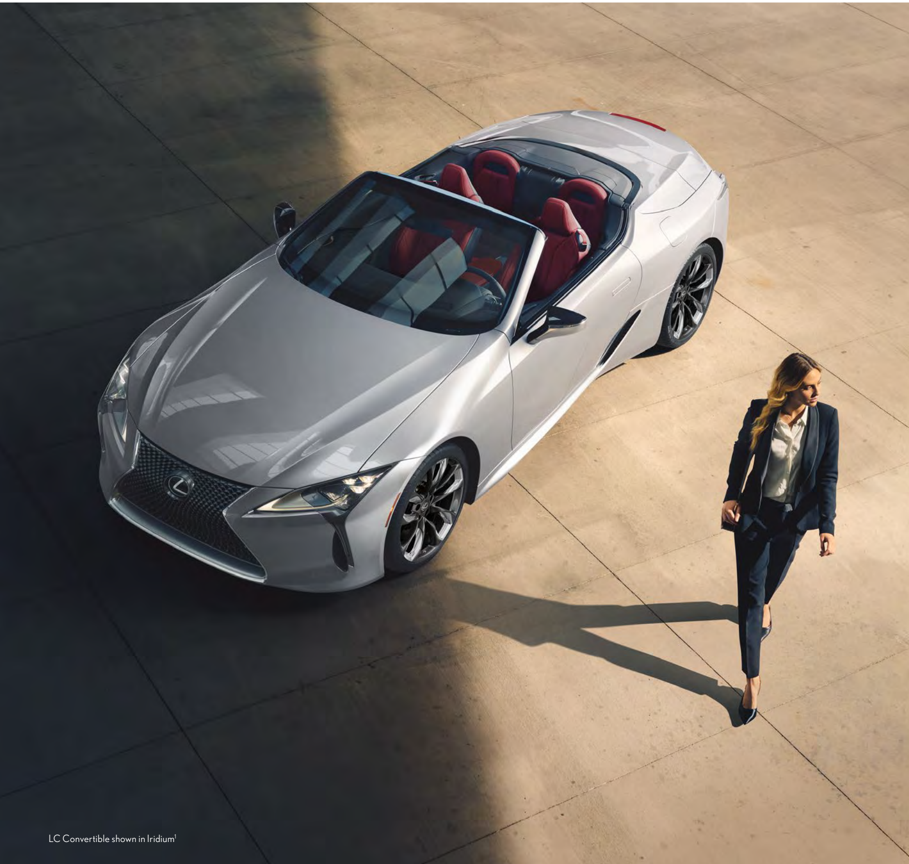
LC Convertible shown in Iridium 1