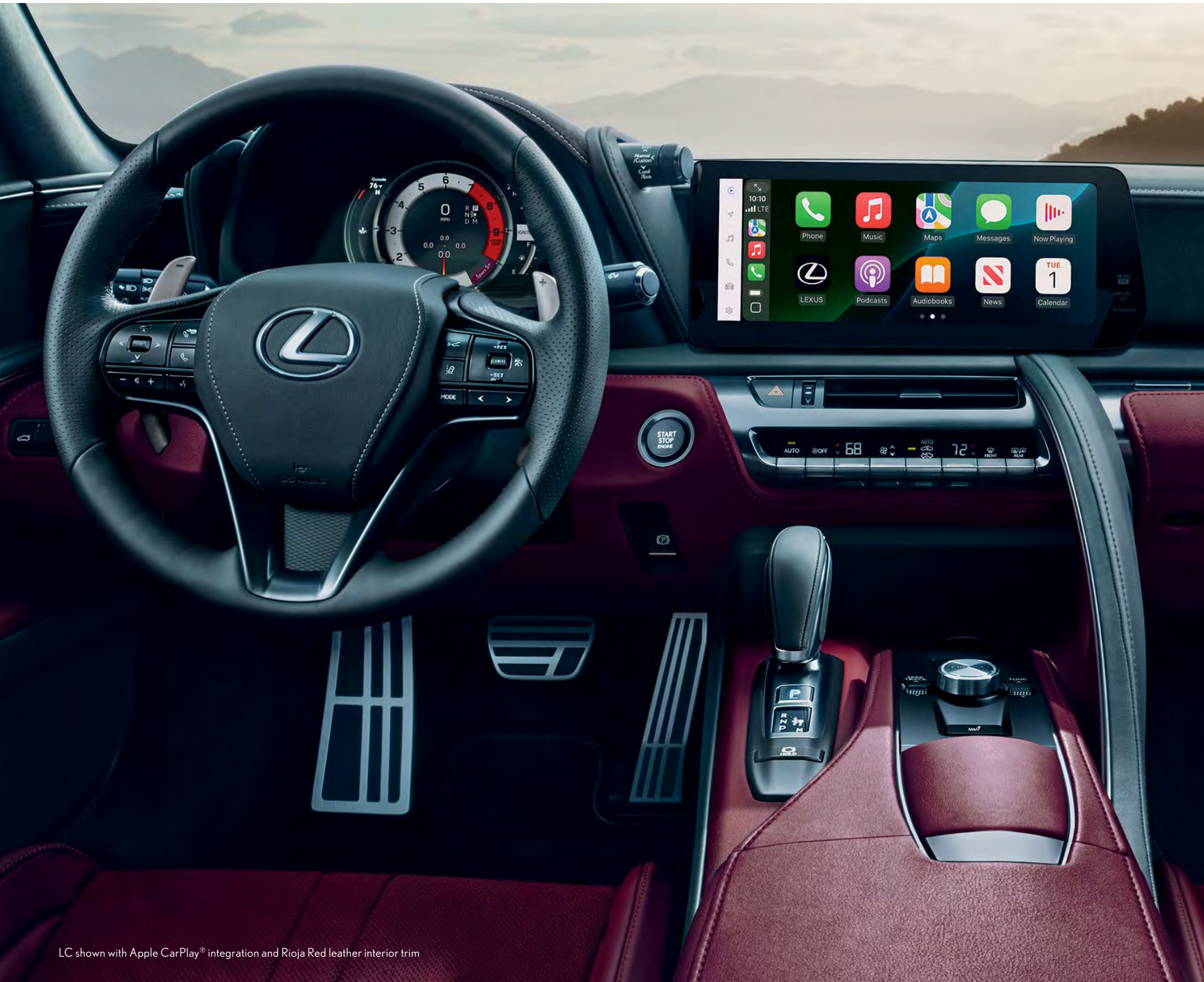
LC shown with Apple CarPlay® integration and Rioja Red leather interior trim