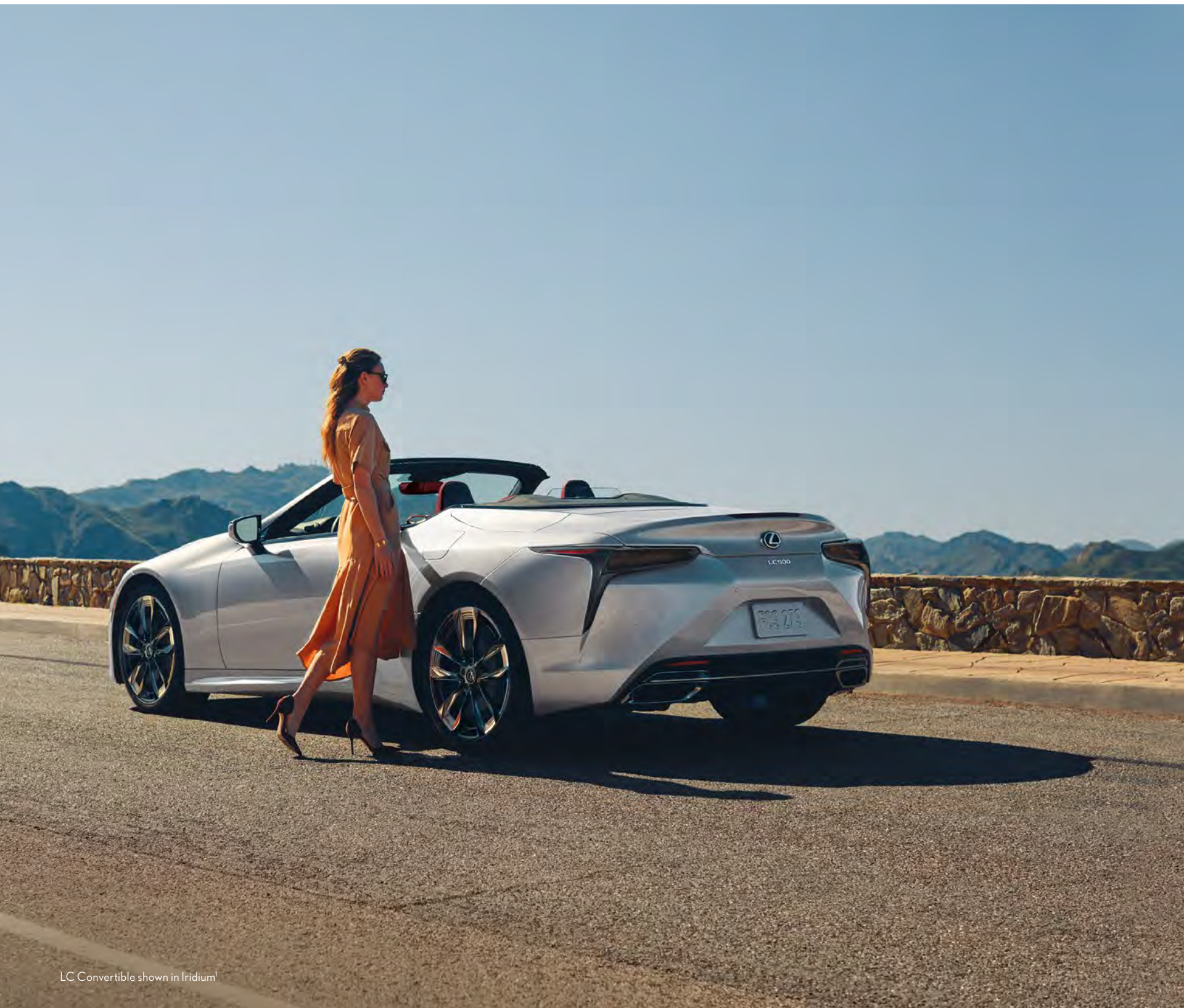
LC Convertible shown in Iridium