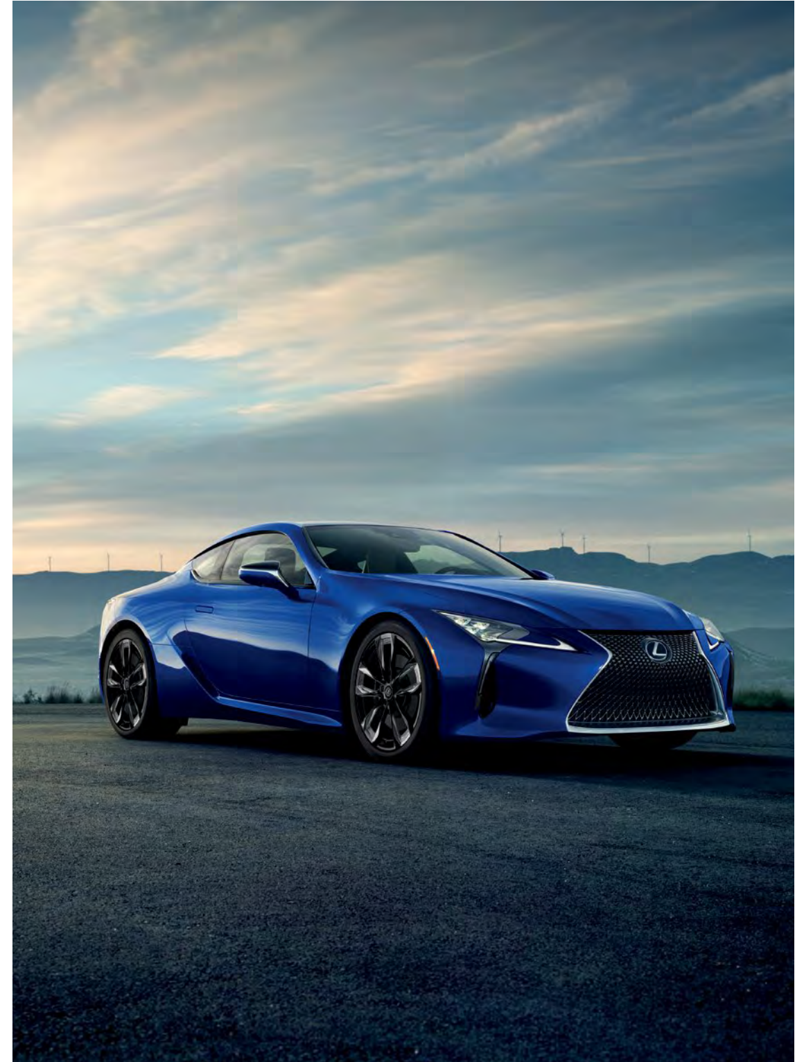
LCh shown in Ultrasonic Blue Mica 2.0 1

From the customizable Bespoke Build models to the thoughtful details you'll discover in the incomparable LC Convertible, every element is designed to elicit a response from the driver.