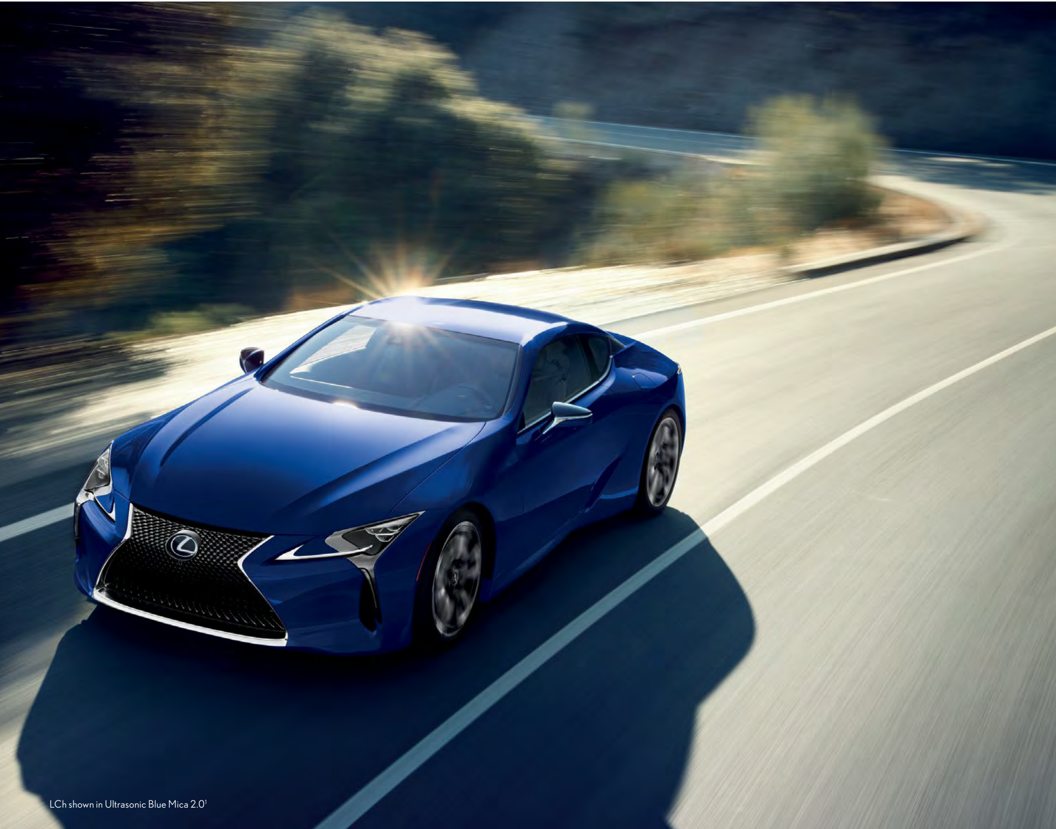
LC shown in Ultrasonic Blue Mica 2.0 1