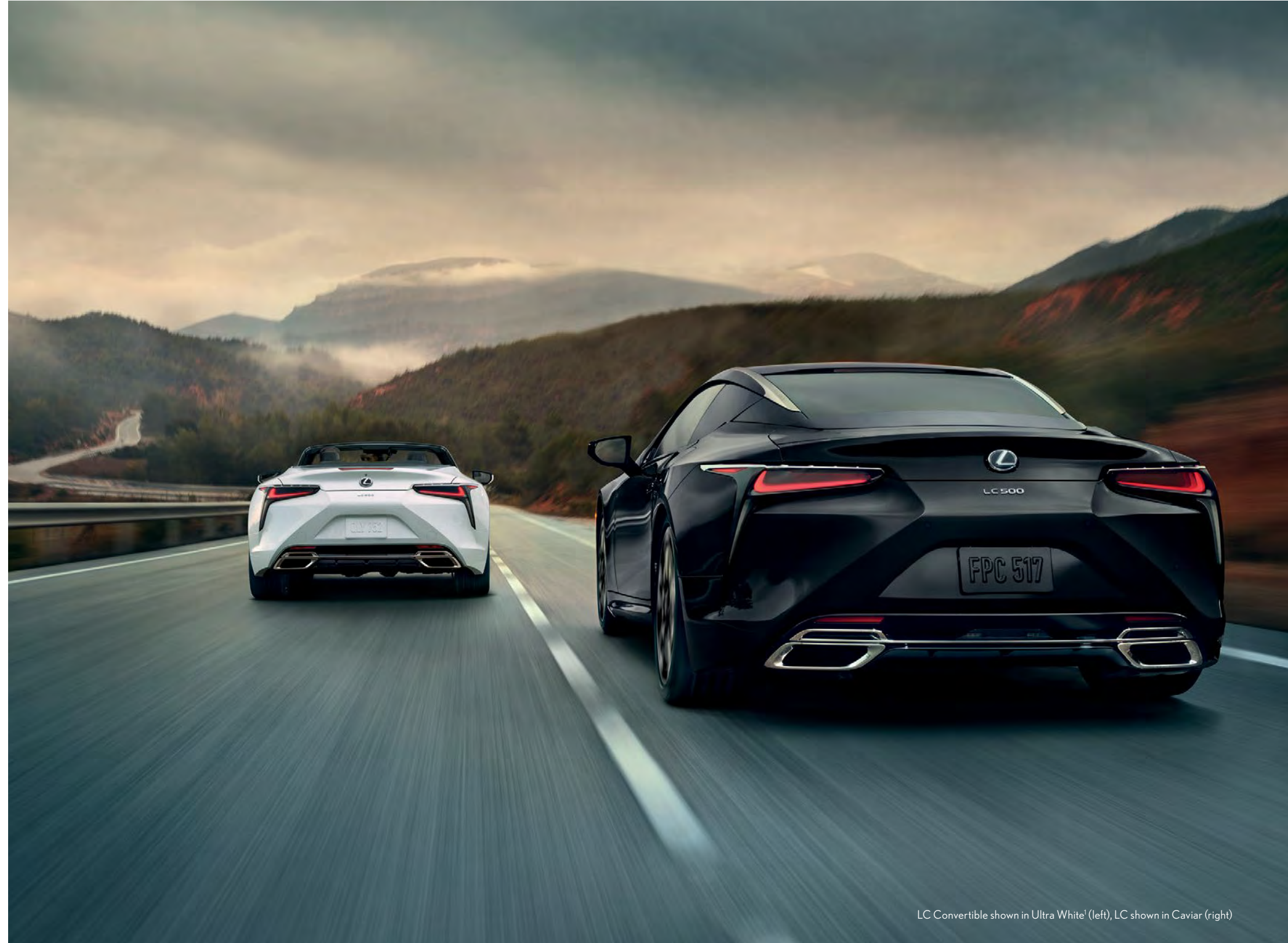
LC Convertible shown in Ultra White 1 (left), LC shown in Caviar (right)

A 10-speed Direct-Shift automatic transmission with magnesium paddle shifters was specifically designed for the LC. It changes gears in 0.12 seconds. Or, half the time it takes the average human to blink. The system also learns your habits every time you drive, selecting the optimum gear based on vehicle speed, acceleration and your driving style—even choosing the ideal gear while cornering.