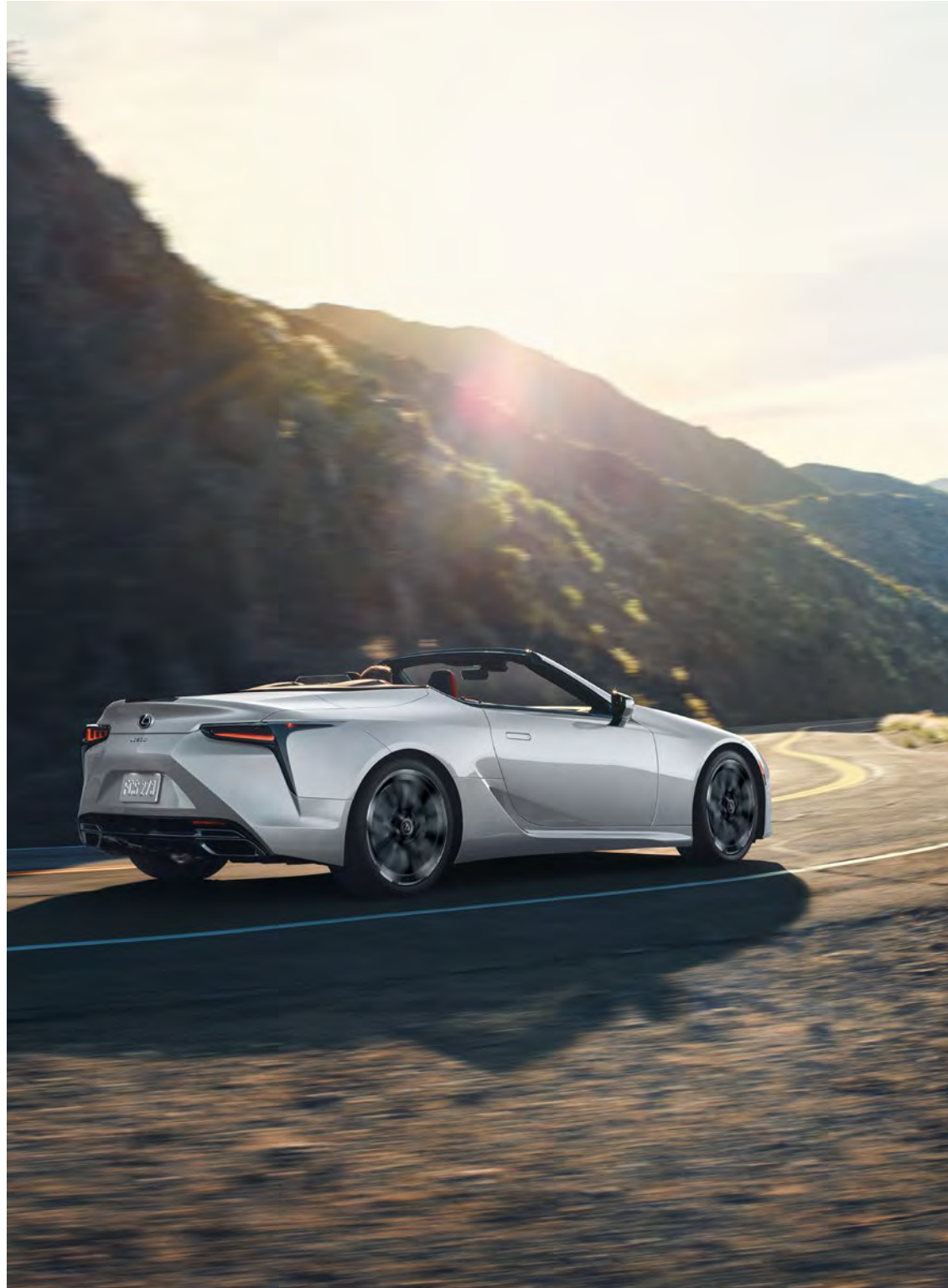
LC Convertible shown in Iridium 1