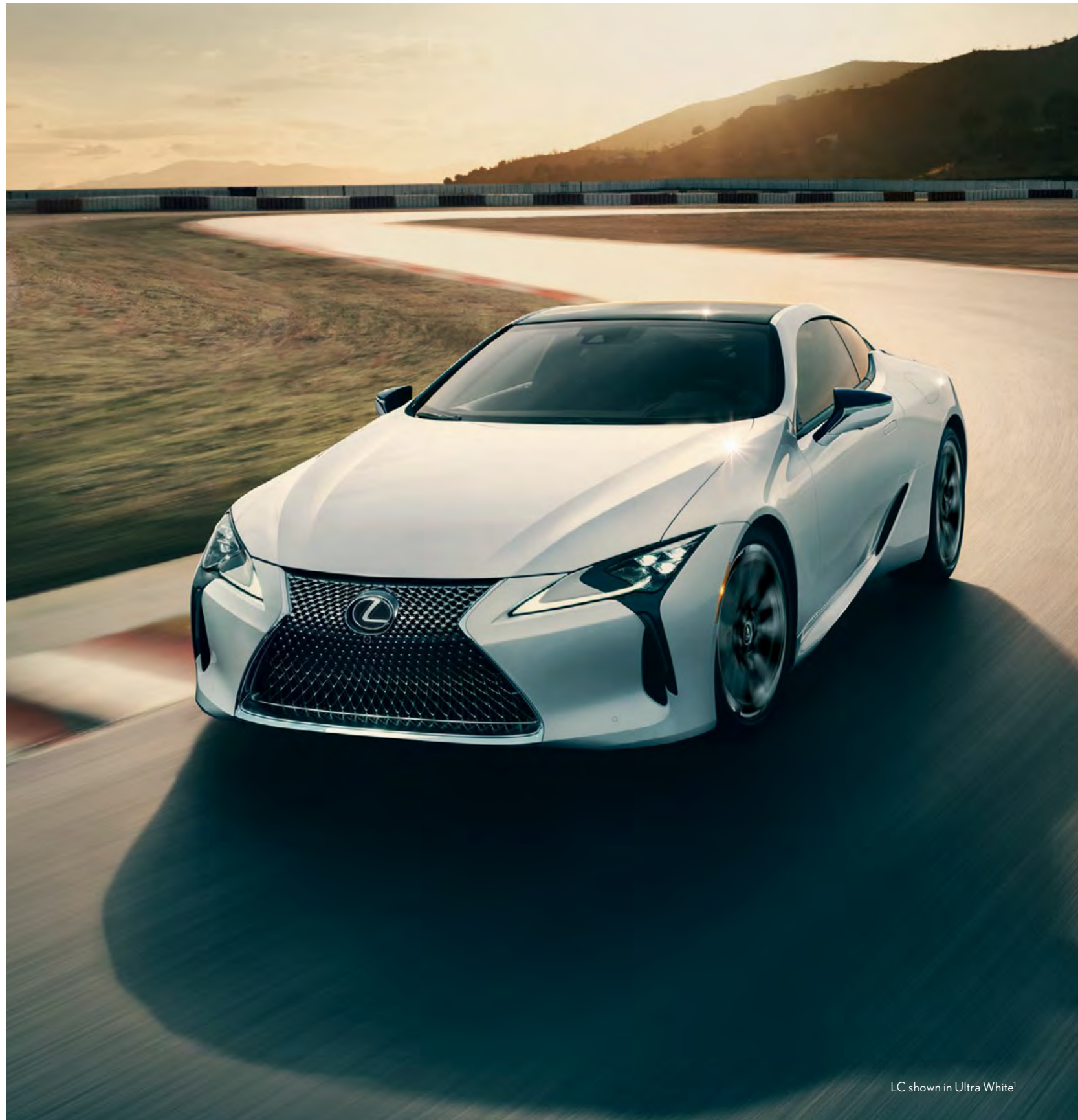
LC shown in Ultra White!