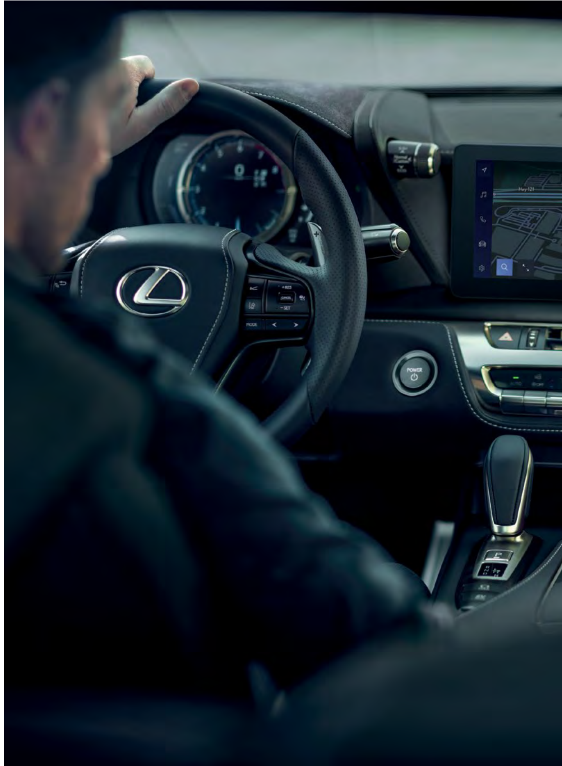
LC shown with Black leather interior trim