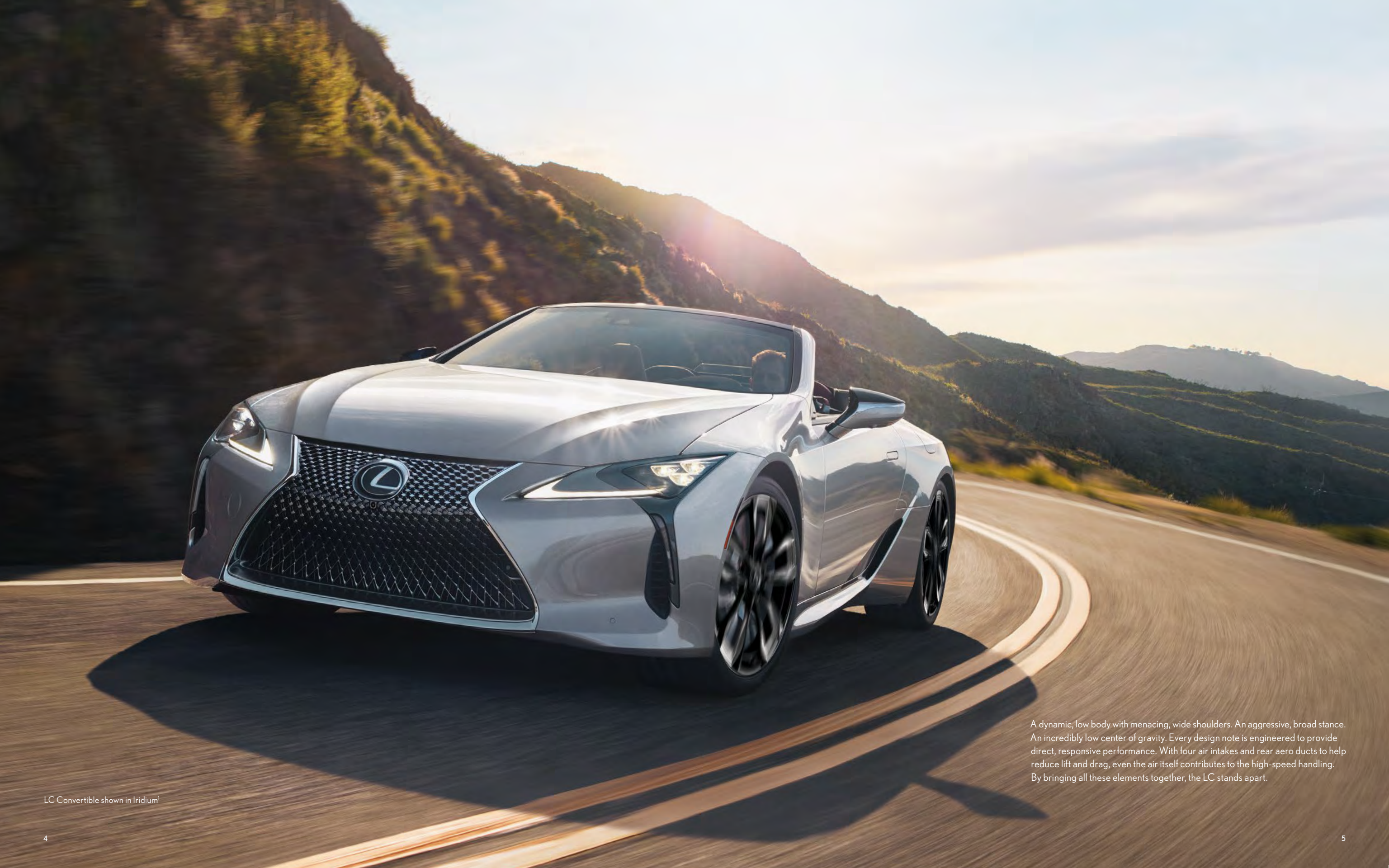
LC Convertible shown in Iridium 1

A dynamic, low body with menacing, wide shoulders. An aggressive, broad stance. An incredibly low center of gravity. Every design note is engineered to provide direct, responsive performance. With four air intakes and rear aero ducts to help reduce lift and drag, even the air itself contributes to the high-speed handling. By bringing all these elements together, the LC stands apart.