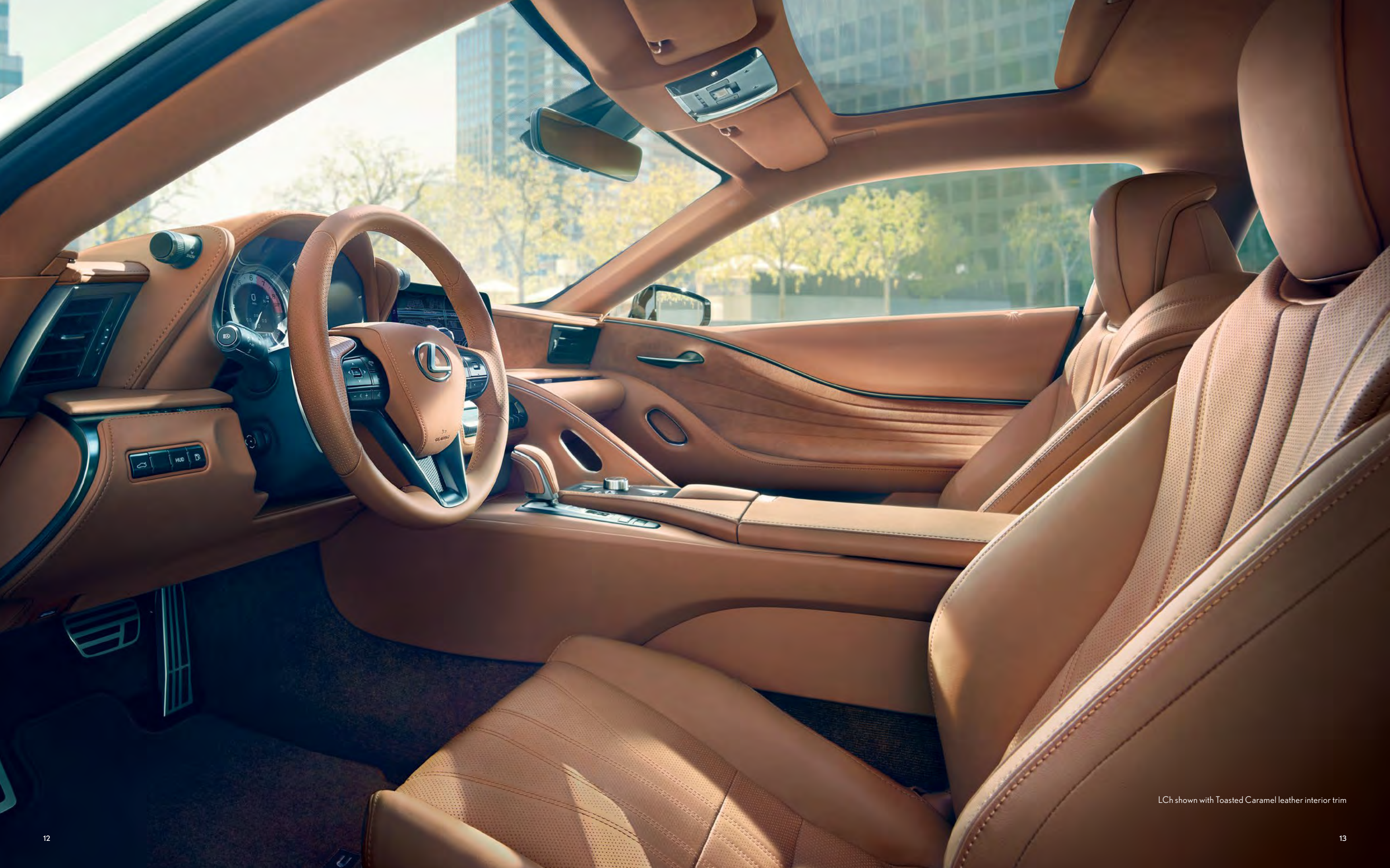
LCh shown with Toasted Caramel leather interior trim