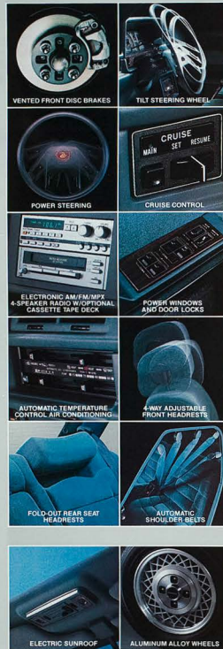
Standard features and options pictured above vary according to models. See Features chart for complete details.

To personalize your Cressida, you'll find options like an electric sunroof or aluminum alloy wheels and others listed on the chart at right.