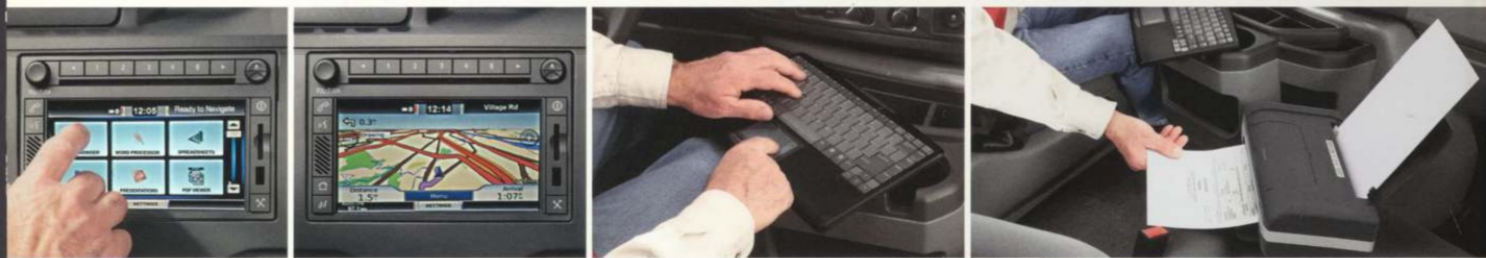
> In-dash computing offers word processing, spreadsheets, hands-free telephone capability and voice-activated nav > The included wireless keyboard lets you work right from the cab > Print documents with the available wireless printer

Only the toughest name in trucks could assemble this all-star lineup to help you take care of business. From communications and computing, to navigation, fleet tracking and security , every position is filled by a pro. Now your Built Ford Tough® truck can be a productivity powerhouse. Run your business remotely. Combat tool loss, theft and downtime. Track your fleet for top efficiency. Ford Work Solutions® components are optional on F-150, 2010 Transit Connect, E-Series, F-Series Super Duty® Pickup and F-Series Super Duty Chassis Cab. You ask, Ford delivers. Visit fordworksolutions.com .