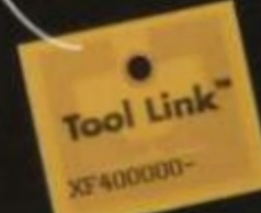
Tool Link RFID Tag

Full mobile office capability. Ford joins forces with Sprint®, MAGNETI MARELLI and Garmin® to offer a Microsoft® Auto Windows CE-based in-dash computing system with broadband Internet capability, 7 navigation and Bluetooth® functionality, all with the ease of a touch screen. Of course, it's ruggedly designed to operate in extreme temps.