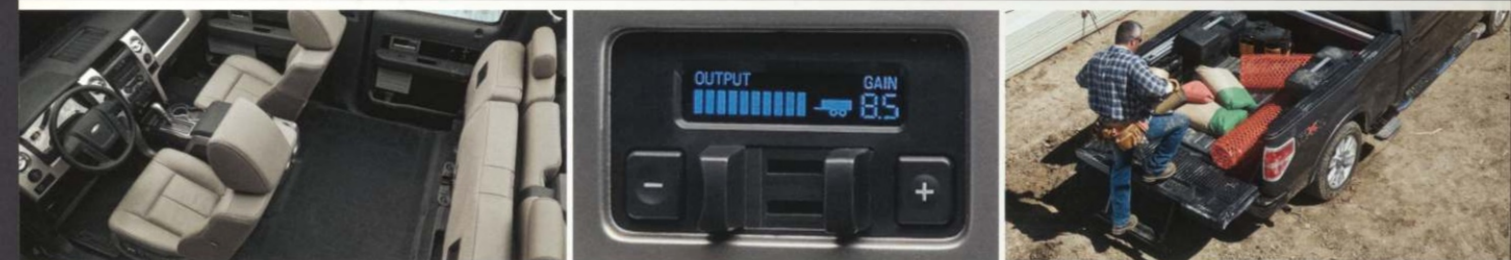
> New flat loadfloor (shown in SuperCrew) eliminates the center "hump" to make loading cargo easier > Available factory-integrated Trailer Brake Controller > New available Tailgate Step makes cargo box entry and exit a breeze

The all-new F-150 delivers increased productivity and toughness at every turn, best-in-class 1 towing and payload , plus impressive technologies like standard Trailer Sway Control and an available integrated Trailer Brake Controller. 2 The new SFE Package provides unsurpassed fuel economy of up to 21 mpg 3 . And the most advanced safety features standard on a pickup put your protection first. In fact, one group of truck experts was so impressed that they gave F-150 their most prestigious award: 2009 Motor Trend Truck of the Year. TM Read all about it at fordvehicles.com/F150 .