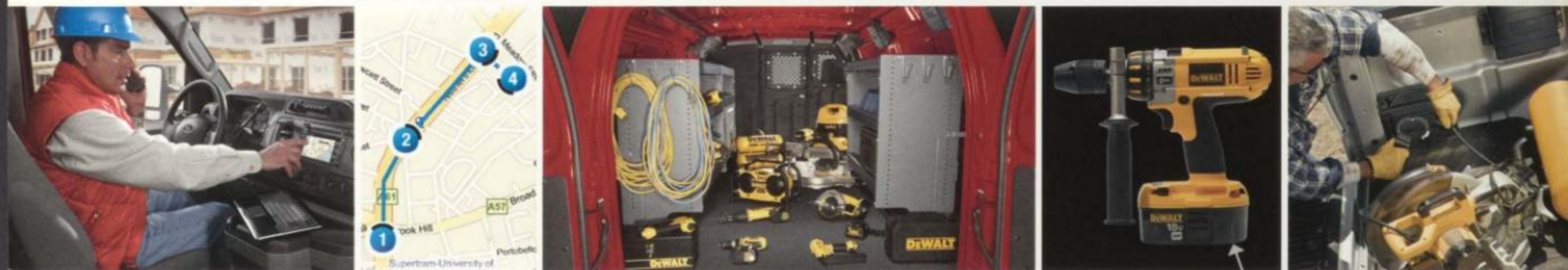
> The Crew Chief™ fleet management system lets you track your fleet 24/7 from any Internet-connected computer > Tool Link™ helps you keep track of your tools and combat tool loss > Cable Lock can help stop "grab and dash" thefts