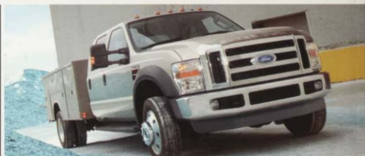
> Wide-open Crew Cab is available with front captain's chairs and center floor console > A choice of heavy-duty alternator systems pump out the amps > Chassis Cabs are prime for aftermarket utility bodies