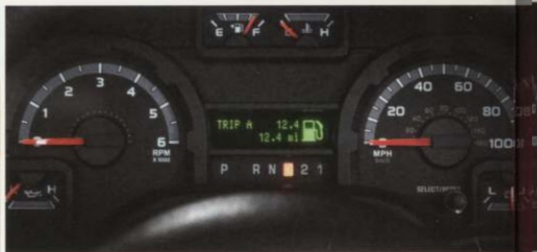
> All-new instrument panel is easy to use and provides plenty of storage too > E-Series Vans, Cutaways and Wagons offer you the most configurations > The new instrument cluster is clear, concise and includes a new optional message center