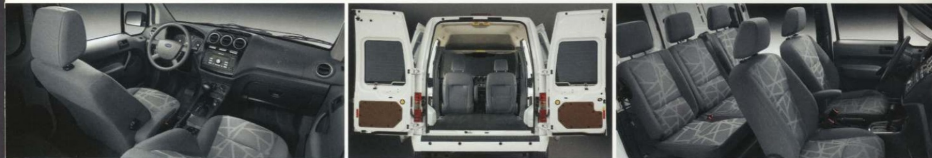
> A very comfortable cabin helps the workday ease on by > A cavernous cargo area features 4-door access > Wagon model offers flexible seating for up to 5

The breakthrough Transit Connect brings an entirely new class of vehicles to America, the small cargo van . Industrial strength. Serious payload. Best-in-class fuel economy 9 . Impressive cargo box flexibility. Tall cargo height . Six doors. Agile city-smart handling. And dual-purpose functionality with available 5-passenger seating. Since its European introduction in 2002, Transit Connect has proven, real-world reliability — and a stack of awards naming it the best, most reliable vehicle of its kind. See it now at fordvehicles.com/transitconnect .