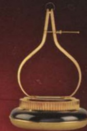
2009 Motor Trend Truck of the Year ™