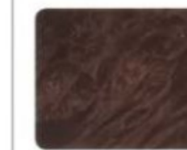
Prussian Burl Wood

Available with exterior colours 1, 3, 4, 5, 6, 7