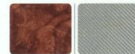
Brown Swirl Walnut Wood