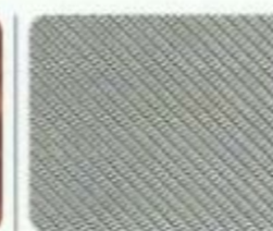
Woven Metal 2