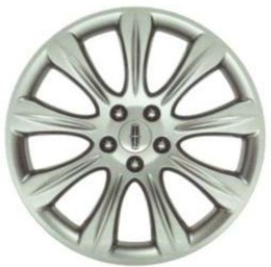
19" Premium Luster Nickel-Painted Aluminum Standard

Comparisons based on competitive models (class is Luxury Large Utilities based on Lincoln segmentation), publicly available information and Ford certification data at the time of printing. Some features discussed may be optional. Vehicles shown may contain optional equipment. Features shown may be offered only in combination with other options or subject to additional ordering requirements or limitations. Dimensions shown may vary due to optional features and/or production variability. Information is provided on an "as is" basis and could include technical, typographical or other errors. Ford Motor Company of Canada, Limited, makes no warranties, representations, or guarantees of any kind, express or implied, including but not limited to, accuracy, currency, or completeness, the operation of the information, materials, content, availability, and products. Your local Lincoln Dealer is your best source for up-to-date information. Lincoln, Ford Motor Company of Canada, Limited, reserves the right to change product specifications at any time without incurring obligations. Colours may not be exactly as illustrated due to restrictions of the printing process. Please see your sales consultant for specific colour and model availability.