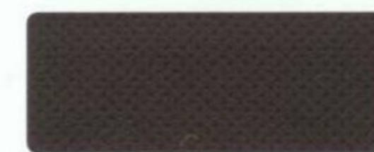
Charcoal Black Leather