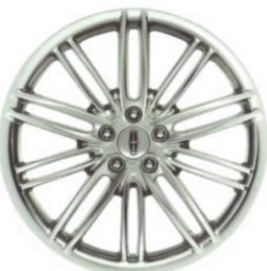
20" Polished Aluminum Optional