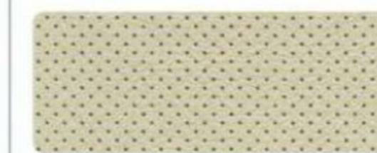
Light Dune Leather