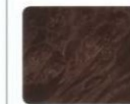
Prussian Burl Wood