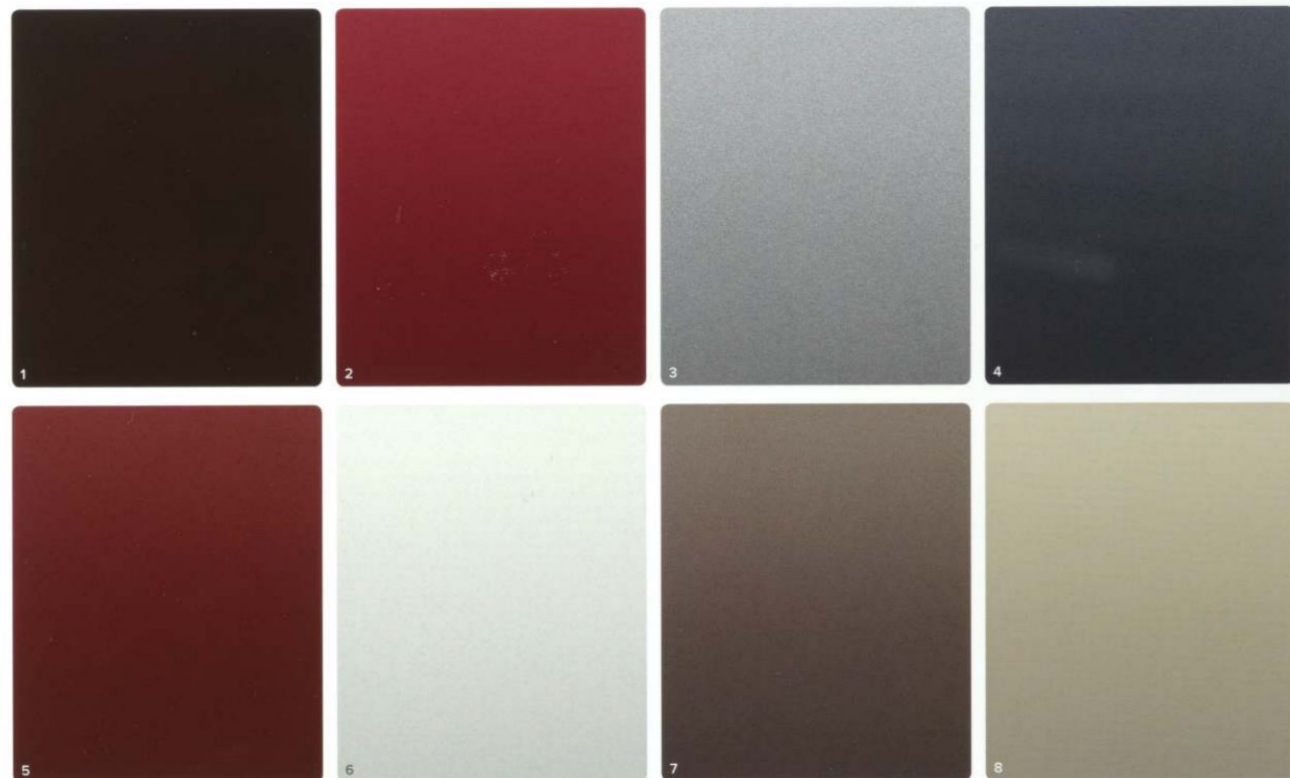
1. Black Velvet 2. Ruby Red Metallic Tinted Clearcoat 1 3. Ingot Silver Metallic 4. Allure Blue Metallic 5. Bronze Fire Metallic Tinted Clearcoat 1 6. White Platinum Metallic Tri-coat 1 7. Luxe Metallic 8. Platinum Dune Metallic Tri-coat 1