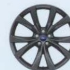
21" premium Dark Tarnish low gloss-painted aluminum