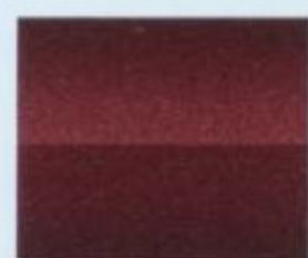
Burgundy Velvet Metallic Tinted Clearcoat**