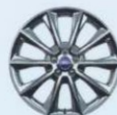
20" premium polished aluminum