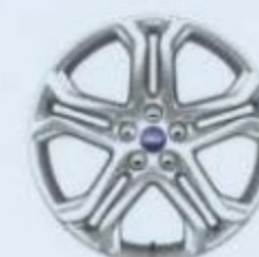
19" nickel-painted aluminum