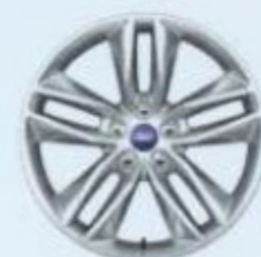
18" Sparkle Silver-painted split-spoke aluminum