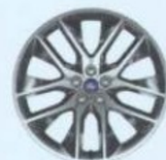
20" bright-machined aluminum with premium dark stainless-painted pockets