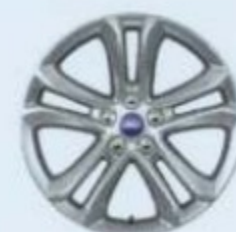
18" polished aluminum