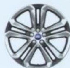
20" polished aluminum with Magnetic low gloss-painted pockets