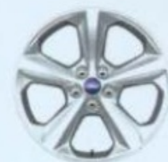
18" Sparkle Silver-painted aluminum