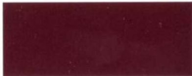
Burgundy Velvet Metallic Tinted Clearcoat 1