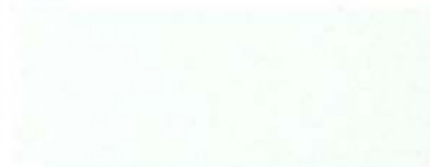
White Platinum Metallic Tri-coat 1