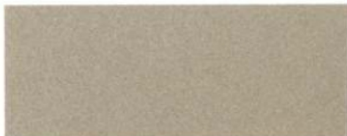
Palladium Gold Metallic