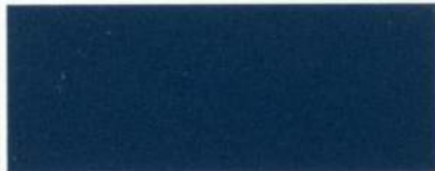
Midnight Sapphire Metallic