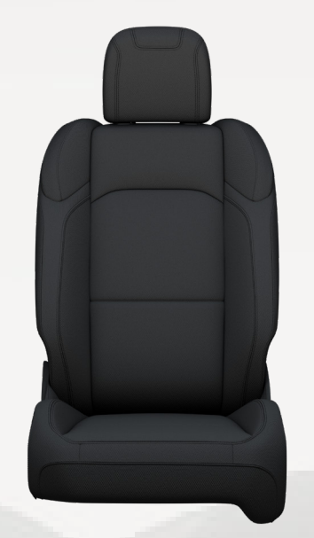
Soulmate cloth seat with Peak embossment with tonal stitching and Silver Platinum-painted mid-bolster — Black (standard)