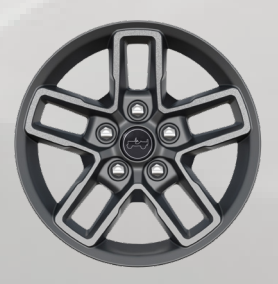
17-inch Dark Graypainted aluminum wheel (standard)