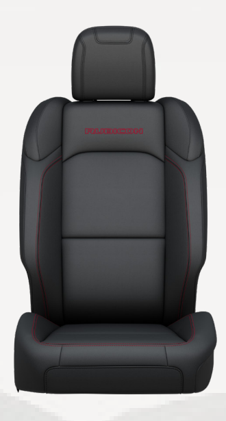
Nappa leather-trimmed seat with Rubicon Red accent stitching, Redical Dash mid-panel and embroidered Rubicon logo — Black (available)