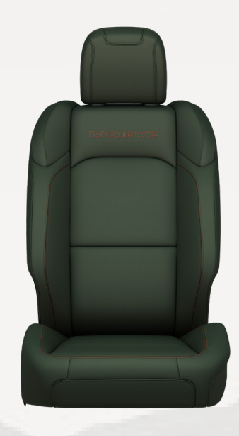
Leather-trimmed seat — Mantis Green (available with X Package)