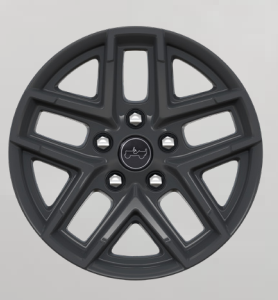
17-inch Gray aluminum wheel (standard)