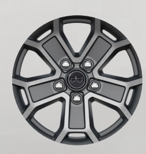
17-inch Dark Gray-painted machined aluminum wheel (available)