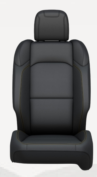
Premium McKinley leathertrimmed seat (available with Premium Package)