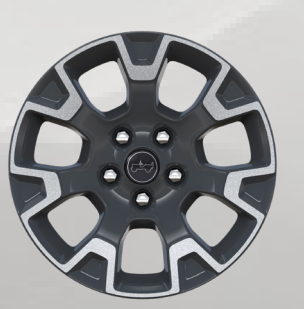
18-inch Gray-painted machined wheel (standard)