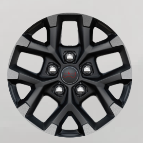
17-inch machined aluminum wheel with Black pockets (available)