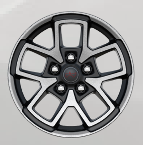
17-inch Black-painted machined aluminum wheel (standard)