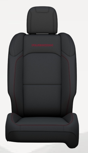
Cloth seat with Rubicon Red accent stitching, Redical Dash mid-panel and embroidered Rubicon logo — Black (standard)