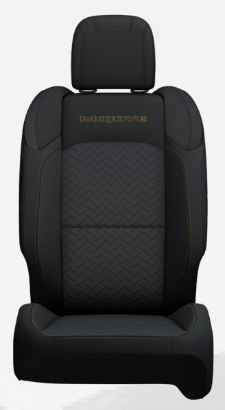
Premium cloth seat with Terracotta accent stitching, Sport bolster, Textured Ash Dash mid-panel and embroidered Mojave logo — Black (standard)