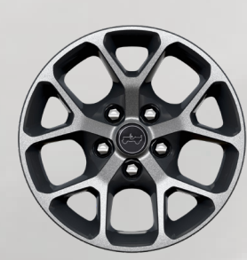
17-inch aluminum wheel with Black pockets (optional)