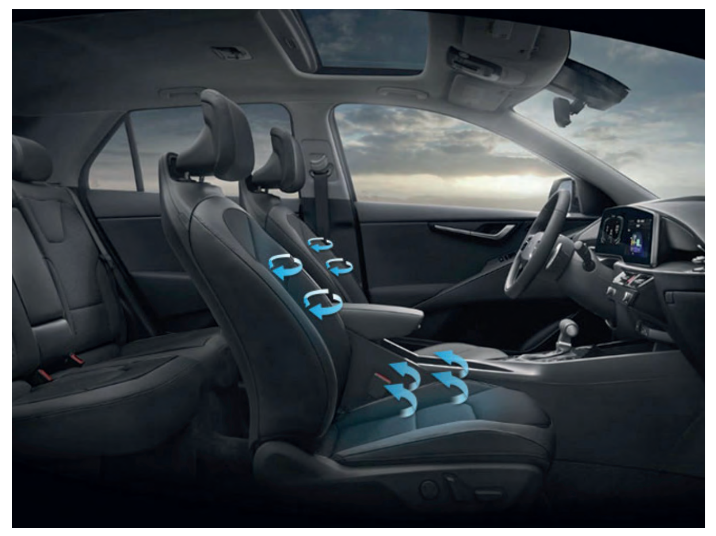
The heated front seats are also available with air cooling and a convenient driver's seat memory function*