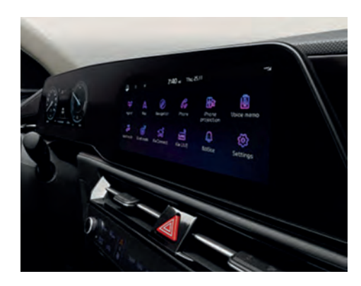
A 10.25" multimedia interface gives you at-a-glance control of navigation, audio and various vehicle system functions*