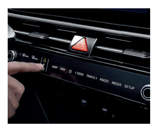
Infotainment/climate switchable controller share the same LCD softkey keyboard*