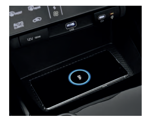
Charge your smartphone by simply placing it on the wireless charging tray*