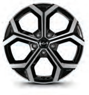
SX 18" alloy wheels