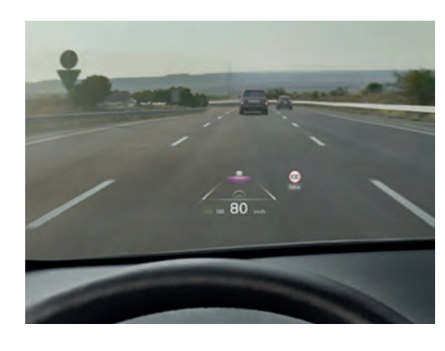
The heads-up display feature projects important data including vehicle speed directly onto the windshield*