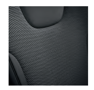
Charcoal cloth and synthetic leather combination