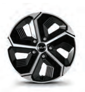
LX & EX 16" alloy wheels