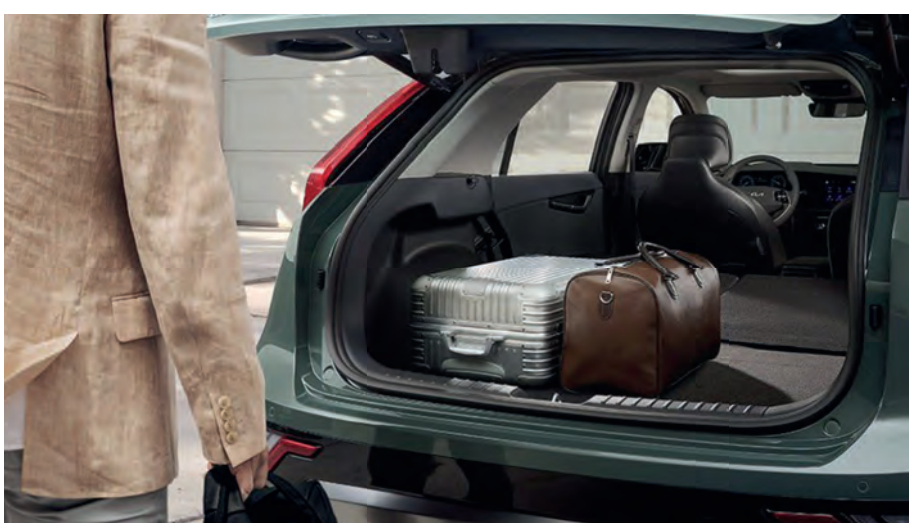
The smart power liftgate opens automatically —and lets you set a maximum opening height*

* Available feature. Visit kia.ca for full details.