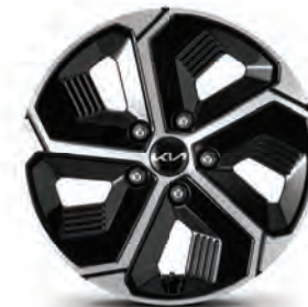
16" alloy wheels