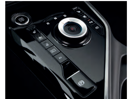
Effortlessly shift between transmission modes with electronic shift by wire