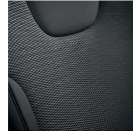
Charcoal cloth and synthetic leather combination