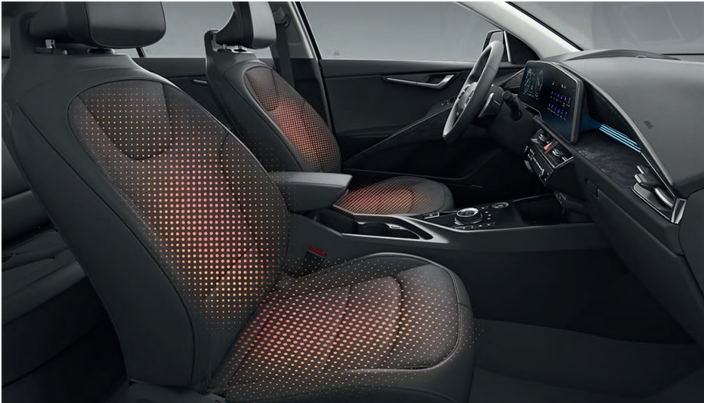
Heated front seats and steering wheel help keep you warm on even the coldest winter days*