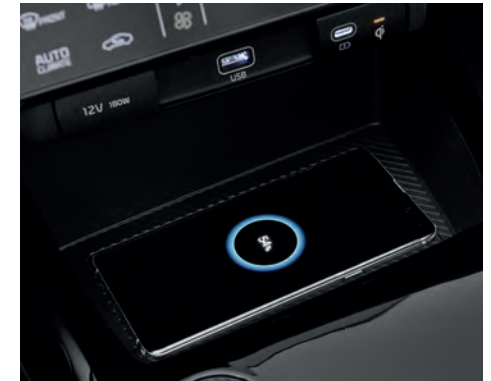
Charge your smartphone by simply placing it on the wireless charging tray*