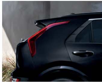
Aurora Black Pearl