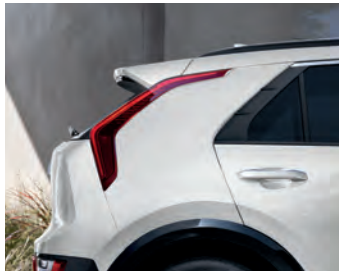
Snow White Pearl