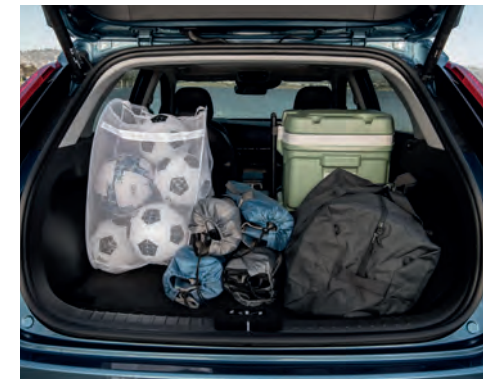
The smart power liftgate opens up to 1,546 L (54.6 cu. ft.) of cargo volume when the rear seats are folded*