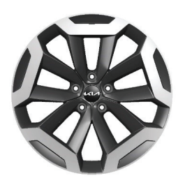
EX 20" alloy wheels with machine finish