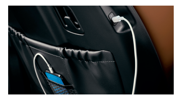
USB-C charging ports in every row provide easy access for all passengers to charge their devices.