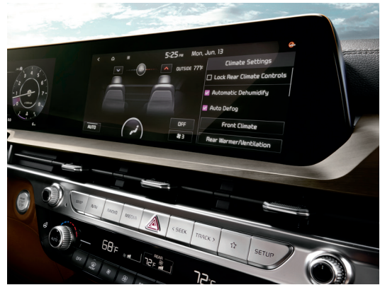
Tri-zone automatic climate control gives driver, front, and rear passengers separate controls to maintain their own personal climate zone.