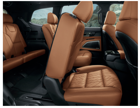
One-touch slide and fold 2nd-row seats slide and fold forward to give 3rd-row passengers easy access.