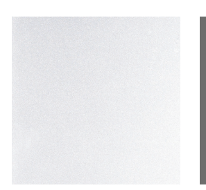
Glacial White Pearl