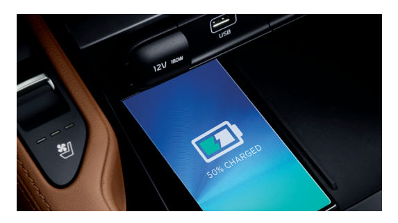
Wireless charging<sup>3</sup> keeps your compatible smartphone charged while you're on the road.