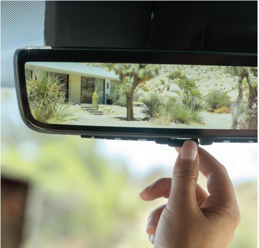
Full display digital rear-view mirror <sup>1</sup> turns the mirror into a digital display with an unobstructed, panoramic view of the rear of the vehicle.

lets you use your smartphone as a secure key, allowing you to lock and unlock the doors and start the engine without the need for a keyfob.