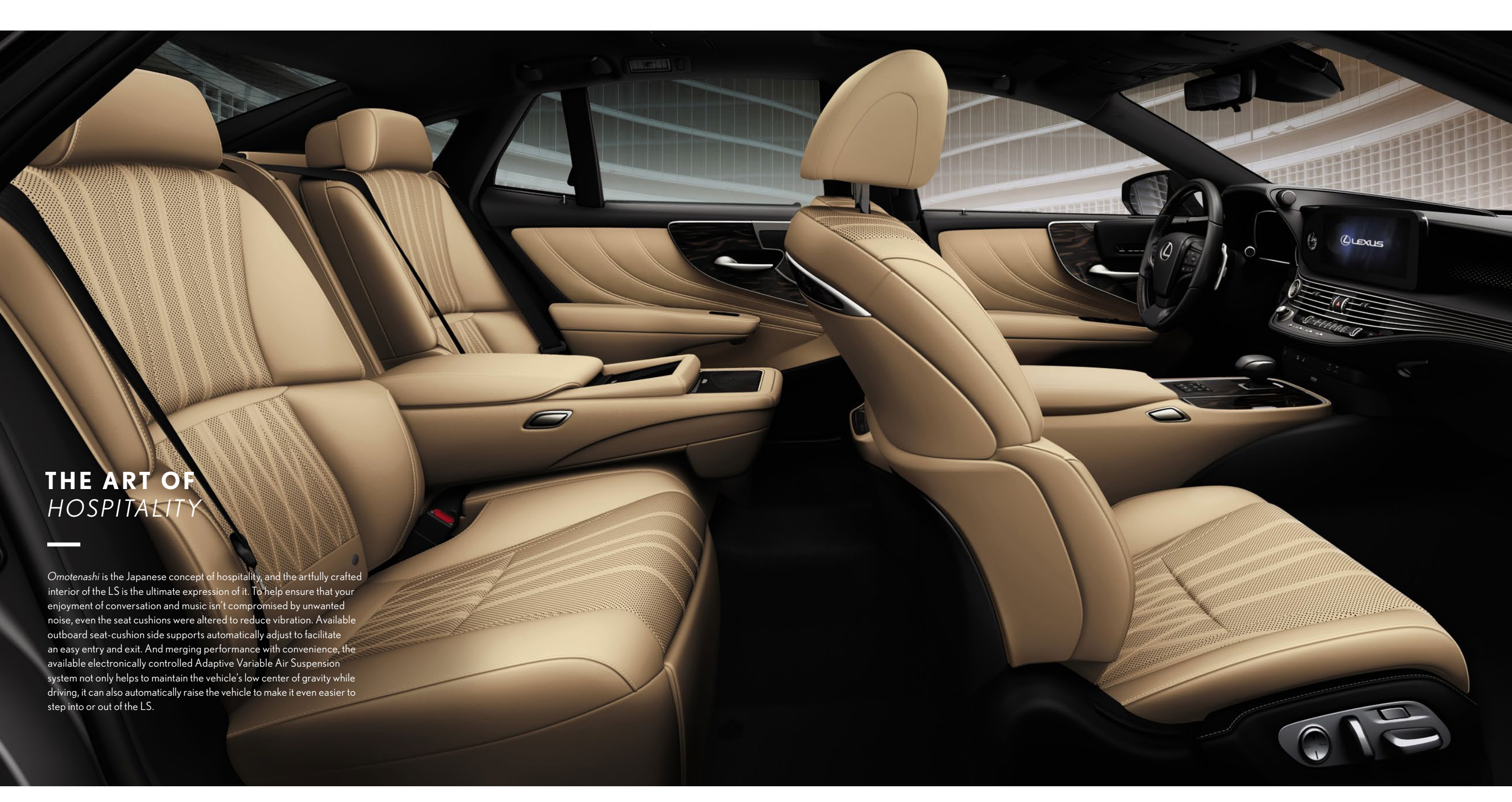
LS shown with Palomino leather and Artwood Organic Gloss interior trim