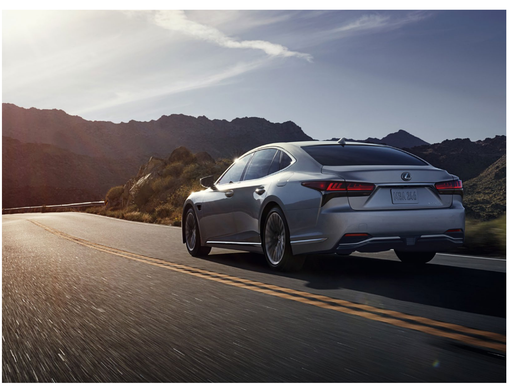
LSh shown in Atomic Silver

Crafted to deliver exceptional refinement, power and response, the LS 500h AWD is the definitive multistage hybrid prestige luxury sedan. Its advanced powertrain pairs a 3.5-liter V6 with powerful electric motors and a compact lithium-ion battery to deliver a potent 354 net combined horsepower. And with its intelligent all-wheel drive system and next-generation driver-assistance technology, the LS 500h AWD continues to define the entire concept of excellence in the category.