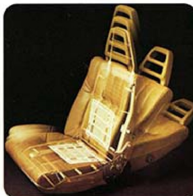
The Volvo seat adjusts nine ways to give you a more comfortable ride.

The front passenger seat is also fully adjustable (the seat height can