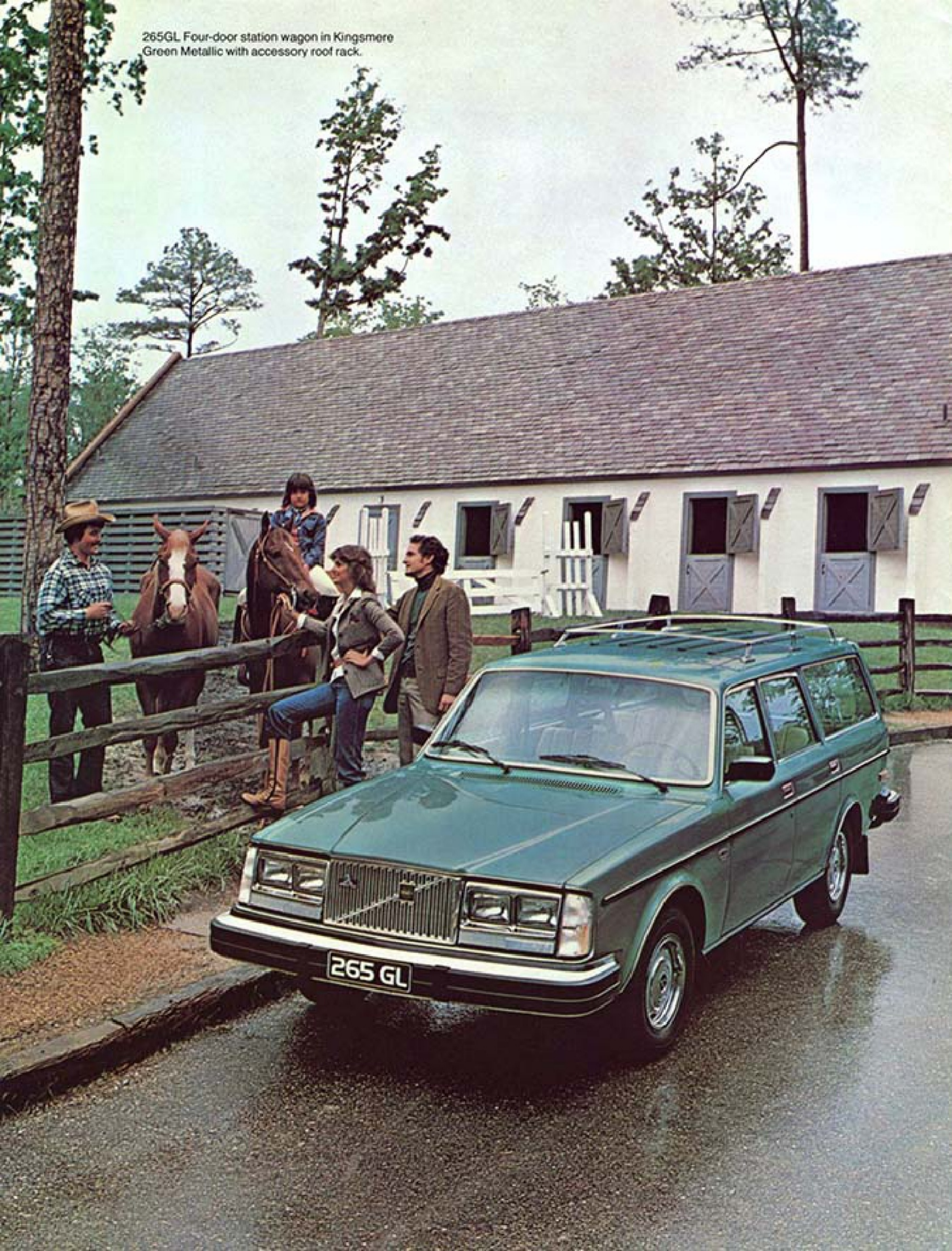
265GL Four-door station wagon in Kingsmere Green Metallic with accessory roof rack.