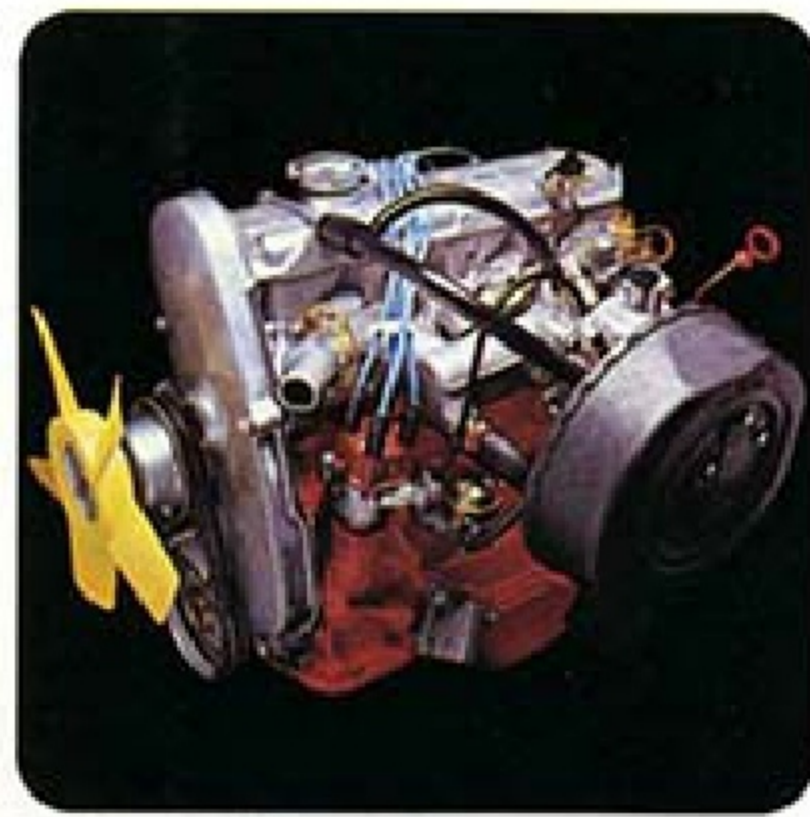
B21A, in-line, four-cylinder engine.

grams. Because Volvo believes you deserve the best in durability, every Volvo body receives a comprehensive application of rust-preventive measures: zinc coating of rust-susceptible components, factory undercoating, "Slipstream" ventilated rocker panels that prevent moisture accumulation, the injection of rust-preventive fluids into closed body cavities, and a multi-layer exterior finish that keeps its good looks for years.