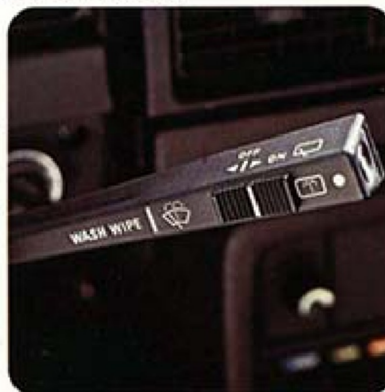
The rear window wiper, has an intermittent cycle on the 265GL, which is available for the 245. The control is on the steering column.

be changed by resetting a few bolts). The seats are supported internally for long-lasting resiliency and comfort and are designed, statistically, to fit 95% of the North American adult population. The rear seat is supported by springs and foam padding for greater comfort. There's ample leg and headroom for five adults. And, when you need extra cargo area, the rear seat conveniently folds forward.