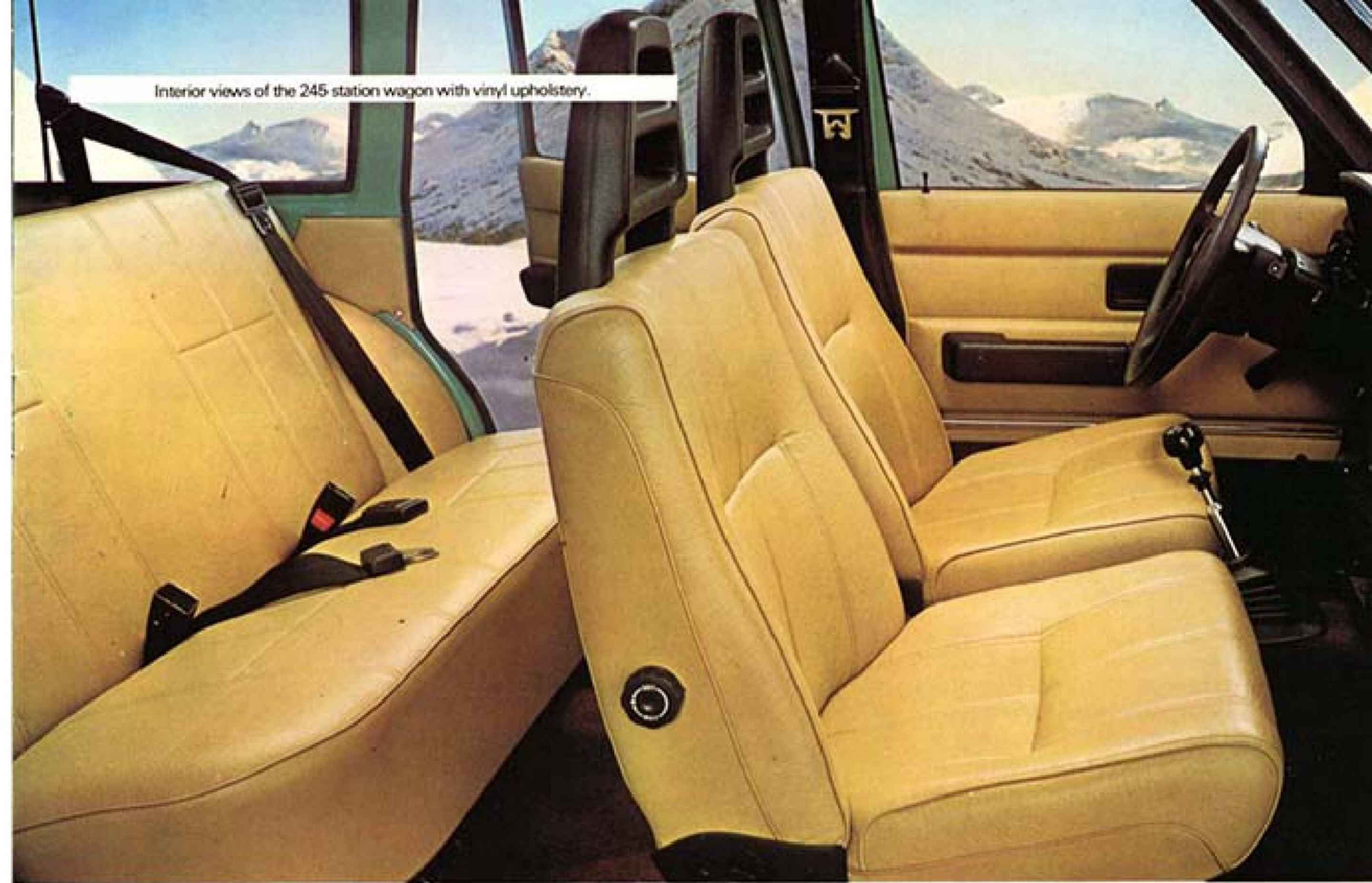
Interior views of the 245 station wagon with vinyl upholstery.

Other passenger comfort and convenience features include: tinted glass with a dark tint band in front for greater glare reduction, convenient storage compartment