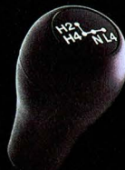
2-SPEED TRANSFER CASE