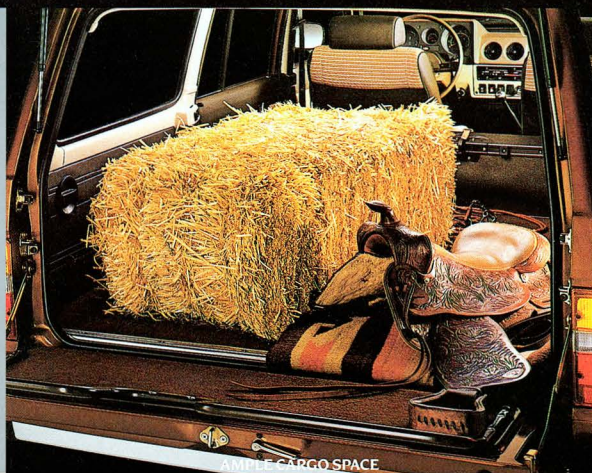
7-CUBIC-FOOT CARGO SPACE