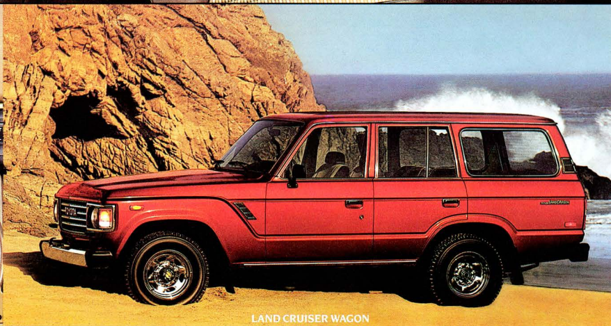
LAND CRUISER WAGON