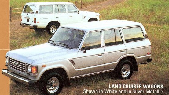
LAND CRUISER WAGONS Shown in White and in Silver Metallic