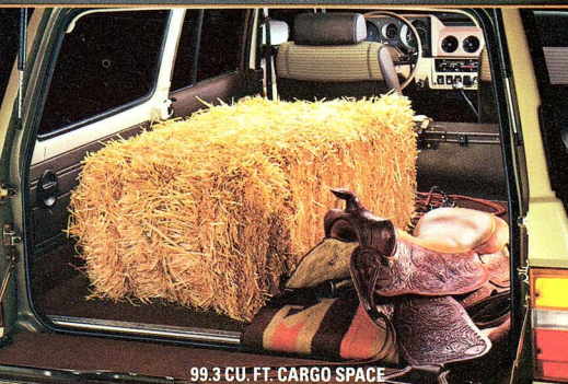
99.3 CU. FT. CARGO SPACE