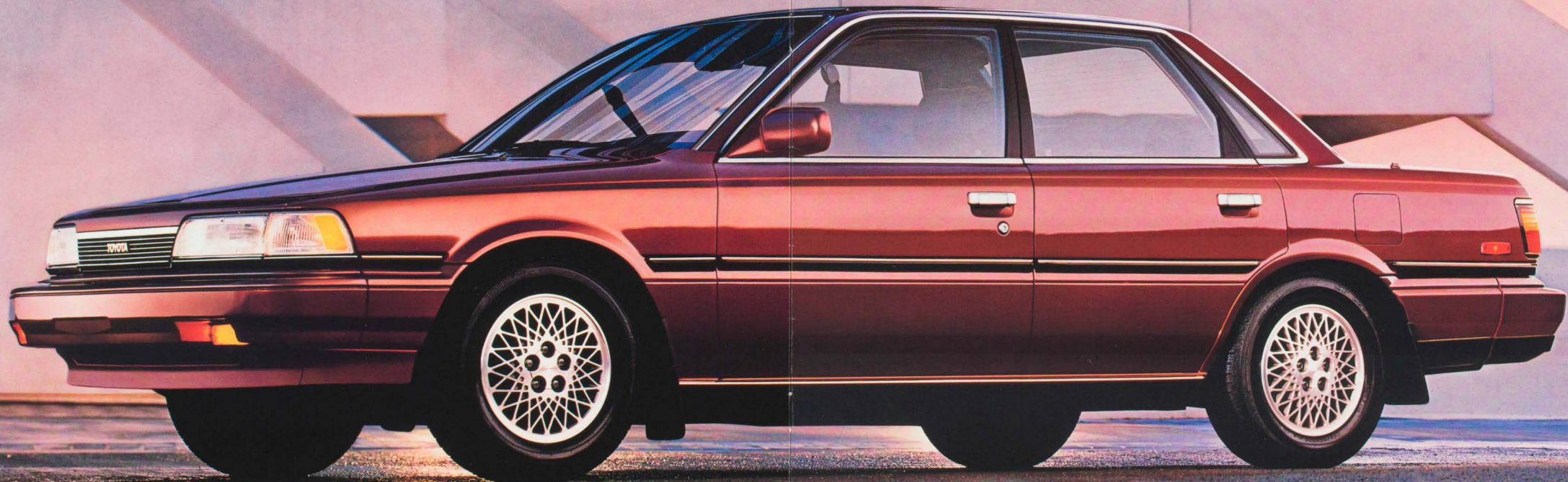
LE Sedan Shown in Dark Red Pearl

TRULY EXCEPTIONAL IN FORM AND FUNCTION. CAMRY DEFINES THE STANDARDS FOR COMFORT, QUALITY, STYLE AND PERFORMANCE.