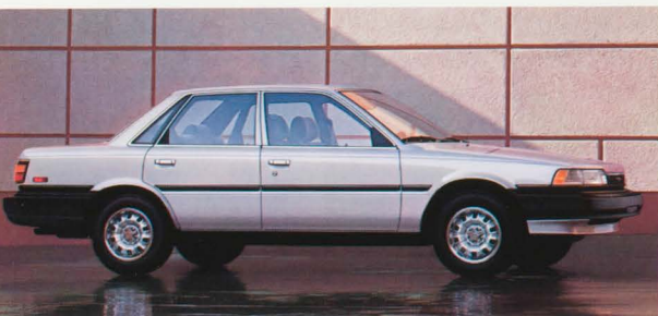
4-Door Sedan (Shown in Silver Metallic)

**1988 EPA estimated mileage figures shown for Camry Deluxe with 3-speed manual overdrive transmission. See page 15 for complete information.