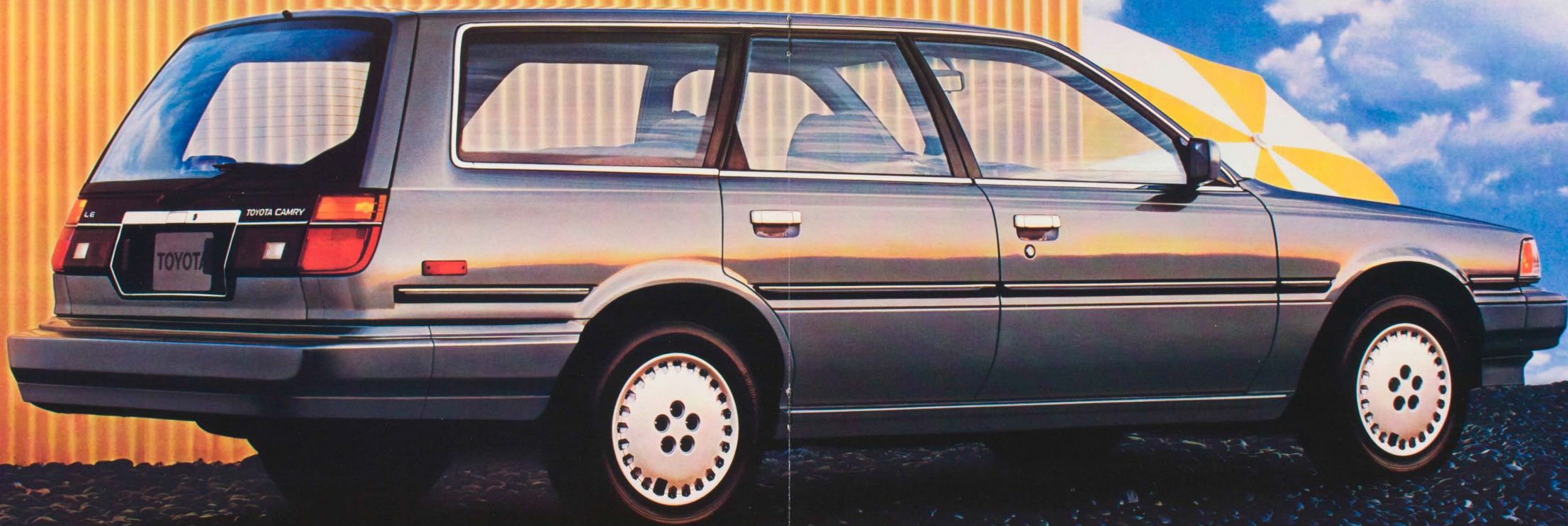
LE Wagon Shown in Gray Metallic

EVEN THE MOST DIVERSE LIFESTYLES SHARE A NEED FOR VERSATILITY, A DEMAND FOR QUALITY, AND A DESIRE FOR STYLE. IN ALL, CAMRY WAGON IS RIGHT FOR TODAY AND TOMORROW.