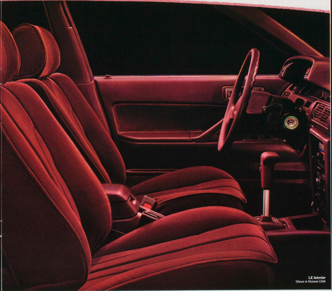
LE Interior Shown in Maroon Cloth