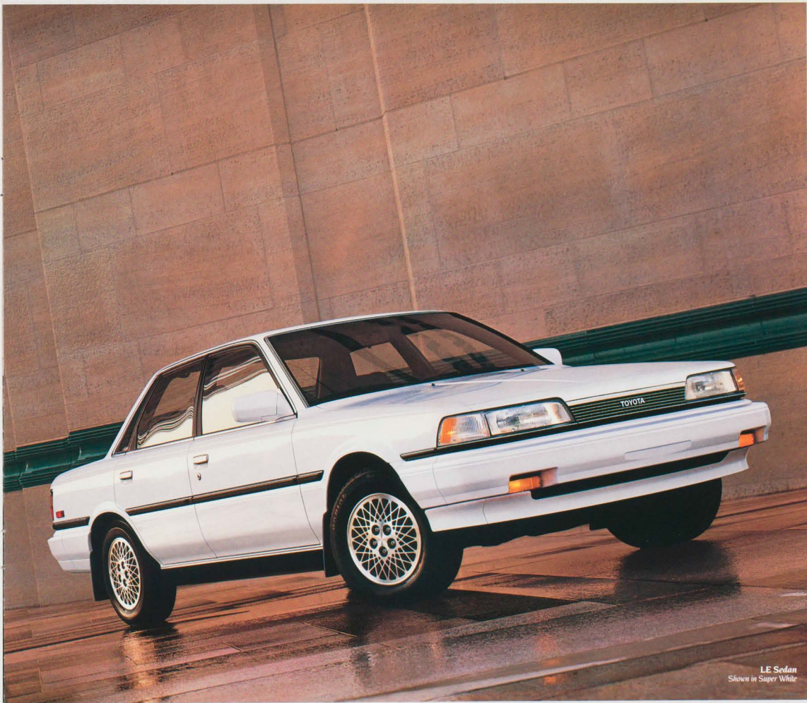
LE Sedan Shown in Super White