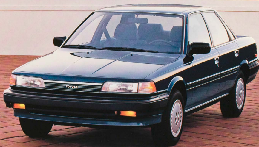
Deluxe Sedan and Deluxe Wagon Shown in Dark Blue Pearl and Light Blue Metallic