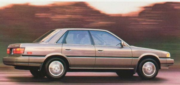
All-Trac LE Sedan (Shown in Rose Gray Metallic)

*J.D. Power & Associates' 1987 Customer Satisfaction with Product Quality and Dealer Service (for 1986 vehicles). **See mileage statement on page 15 for details. †Motor Trend Magazine May, 1987.