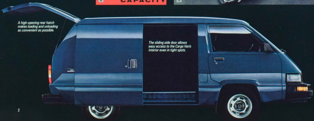
A high-opening rear hatch makes loading and unloading as convenient as possible.