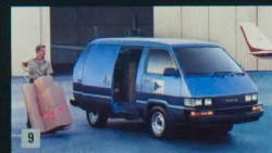
Shown with optional equipment.