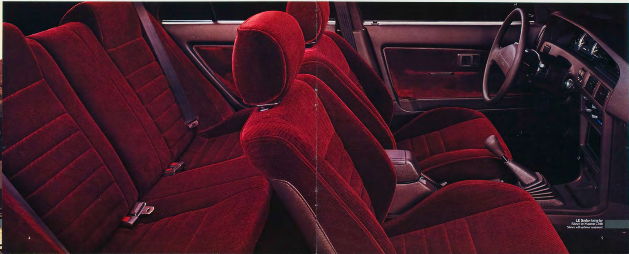
LE Sedan Interior Shown in Maroon Cloth Shown with optional equipment.