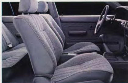
Deluxe Cloth Interior Shown in Gray Cloth

Illuminated controls are positioned close to the driver and arranged for operating ease. Corolla's ventilation system has ample capacity while its optional air conditioning keeps you comfortable even in the hottest weather or traffic.