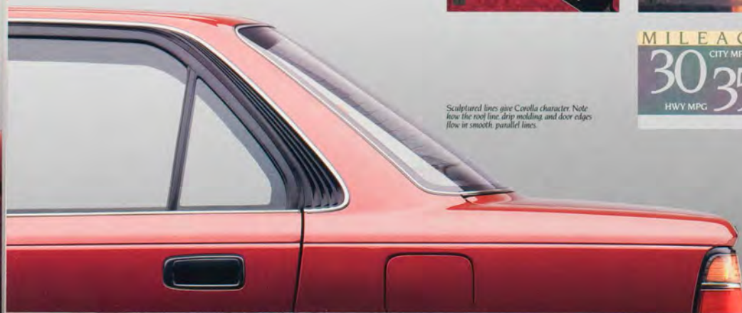
Sculptured lines give Corolla character. Note how the roof line, drip molding and door edges flow in smooth, parallel lines.