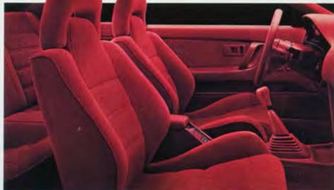
Sport Seat Interior Shown in Red Cloth