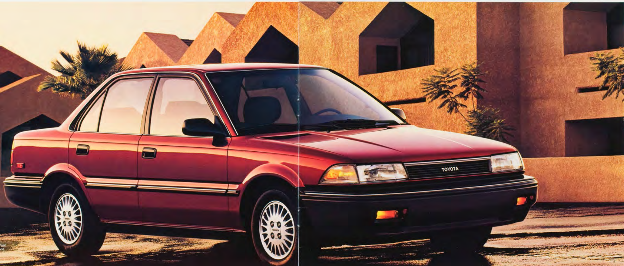
LE Sedan Shown in Medium Red Pearl. Shown with optional equipment.

and Wagons tackle the weather with all-wheel drive confidence. For a well-equipped, contemporary car with sleek styling, you'll find that the Corolla SR5 or GTS Sport Coupe sets new standards in sporty value.