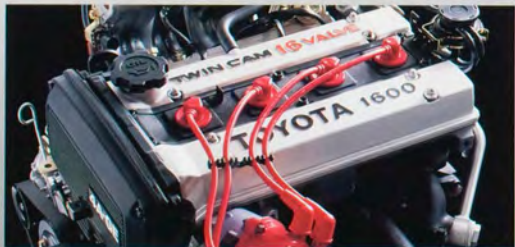
Twin-Cam 16-Valve Power

You scan the large analog speedometer and tachometer cluster that's flanked by fuel level and coolant temperature gauges. Note how the low instrument panel flows smoothly into the door panels for a clean, integrated appearance and all controls are carefully grouped in an ergonomic, wrap-around cockpit. The shift lever of the standard 5-speed manual overdrive transmission is just a short reach away. Color-keyed carpeting and door trim add style, while thoughtful details such as a dual cup holder and door pockets add convenience. The 60/40 fold-down split rear seatbacks give added carrying versatility.