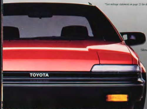
SR5 Sport Coupe Shown in Super Red Shown with optional equipment.

*See mileage statement on page 23 for details.