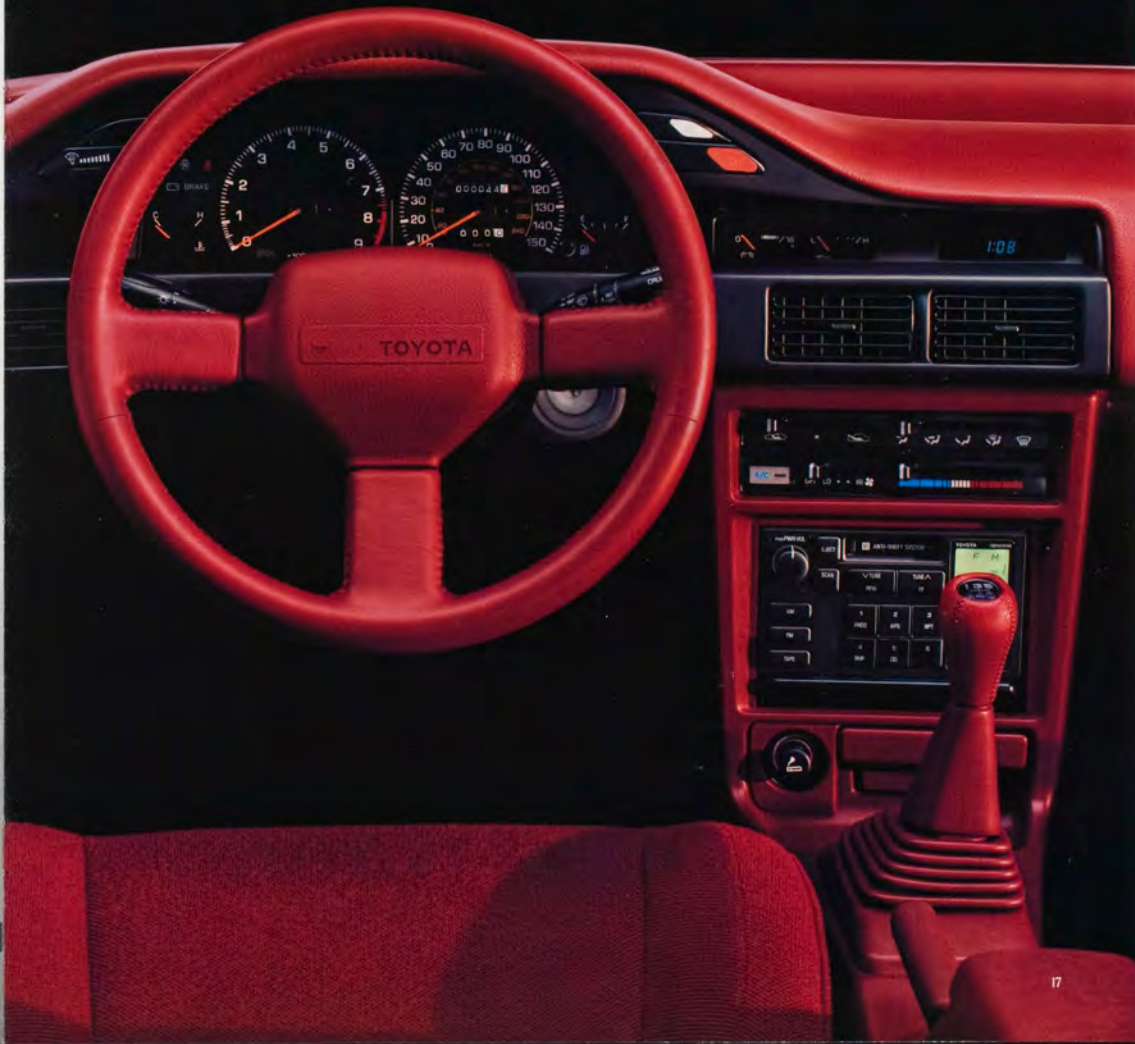
GTS Instrumentation Shown in Red Shown with optional equipment

Whenever the open road calls you to adventure and you demand the quality and reliability of Toyota in a responsive, sporty coupe, the GTS is the answer.