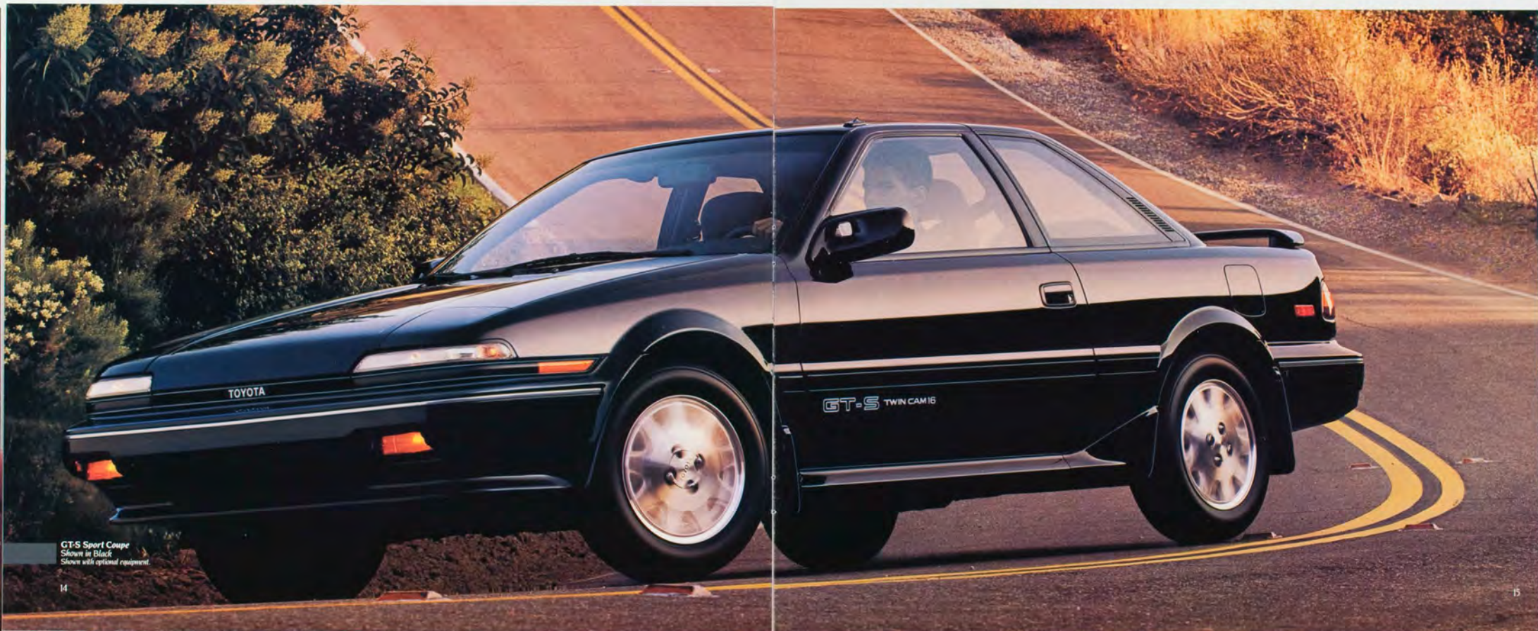
GTS Sport Coupe Shown in Black Shown with optional equipment.

raked profiles highlight a slim grille and stylish integrated sidelamps. And because they are Corollas, GTS and SR5 also provide reassuring economy, reliability and traditional Toyota Quality.