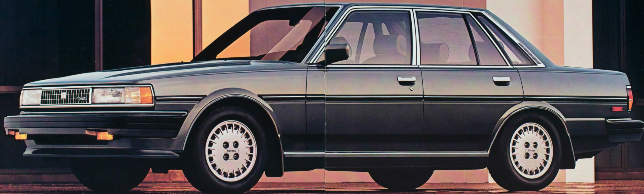
Luxury Sedan Shown in Gray Metallic

"MOST TROUBLE-FREE NEW CAR SOLD IN AMERICA" CRESSIDA'S TITLE BRINGS YOU UNEQUALED CONFIDENCE AND DRIVING PLEASURE, PLUS UNMATCHED LEVELS OF LUXURY, COMFORT, AND PERFORMANCE.