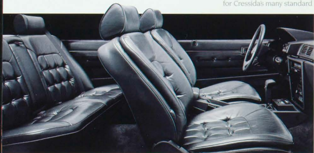
Luxury Sedan Leather Interior (Shown in Gray)

††See mileage statement on page 6 for details.