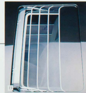
Shown with optional equipment.