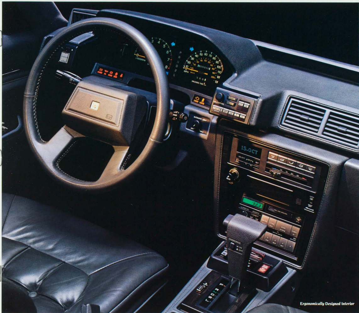
Ergonomically Designed Interior