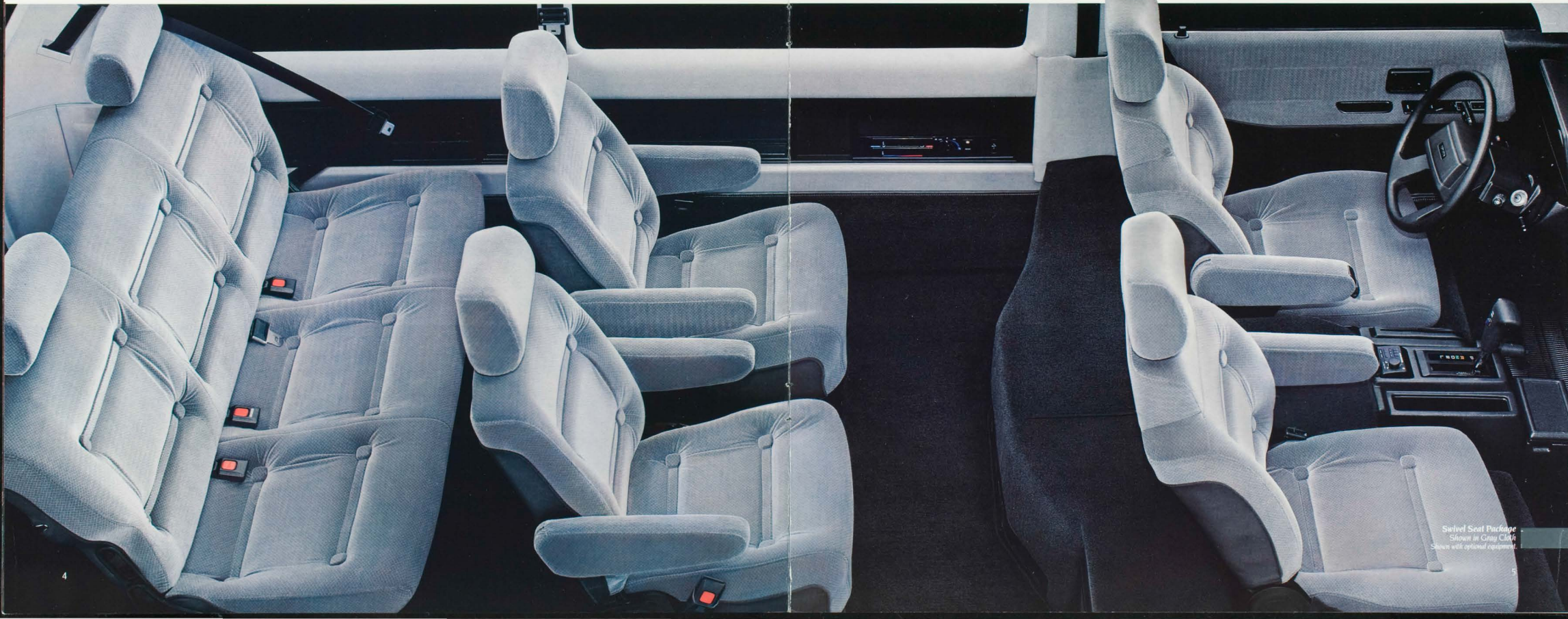
Swivel Seat Package Shown in Gray Cloth Shown with optional equipment.

a cooler ice maker to the optional dual air conditioner for traveling convenience. A spacious place with all the comfort features you'll need to take a first-class voyage. That's the Passenger Van.