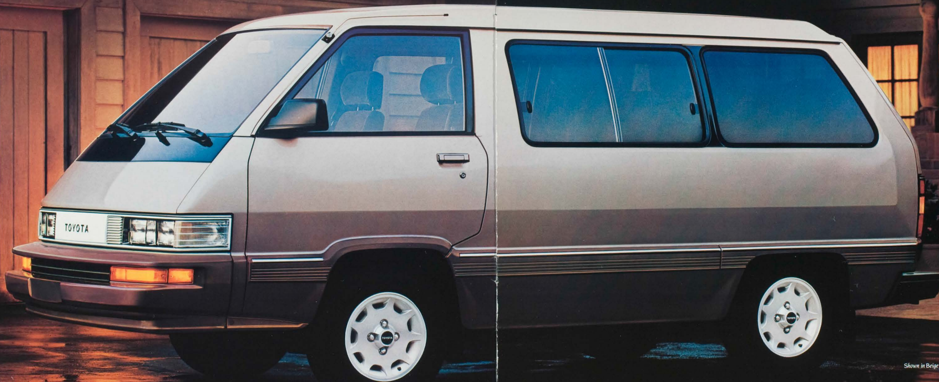
LE Van Shown in Beige Metallic/Taupe Metallic Two-Tone Show with optional equipment.

*Based on problems encountered in first 90 days of ownership—J.D. Power & Associates 1988 New Car Initial Quality Survey Van Supplement.