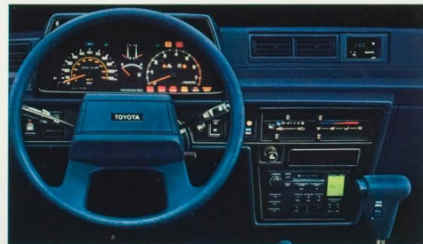
4WD LE Van Instrumentation Shown in Blue

horsepower with responsiveness and efficiency, packing plenty of muscle for full loads and long trips. There's a standard 5-speed manual overdrive transmission, and optional 4-speed automatic overdrive** Rack-and-pinion steering and a tight turning circle give an agile nimbleness that makes driving fun and enjoyable. Power-assisted ventilated front disc brakes help make secure stops.