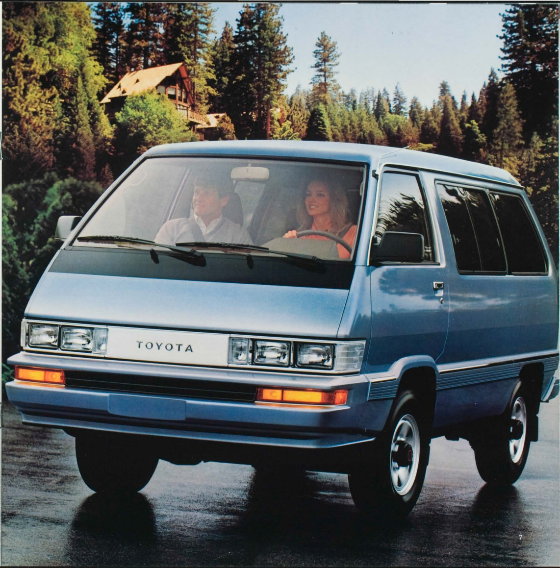
4WD LE Van Shown in Light Blue Metallic Shown with optional equipment