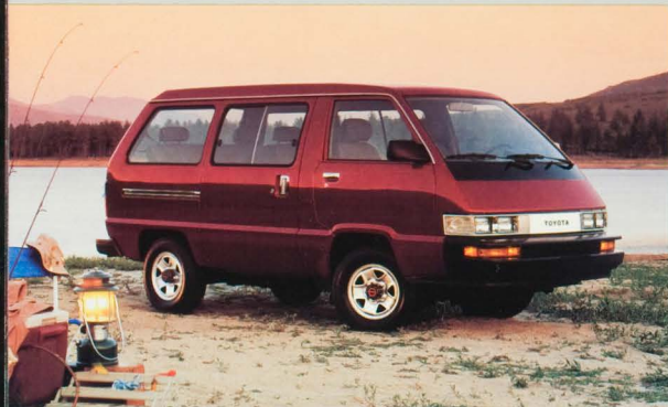
4WD Deluxe Van Shown in Medium Red Pearl

*Based on problems encountered in first 90 days ownership—J.D. Power & Associates 1988 New Car Initial Quality Survey Van Supplement. **Standard on 4WD LE Van.