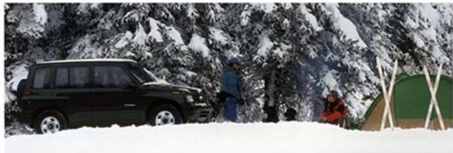
Top to bottom: Geo Prizm, Geo Metro and Geo Tracker.