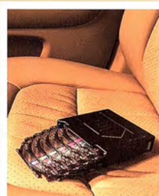
SIX CD AUTO-CHANGER