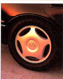
EXCLUSIVE ALLOY WHEELS