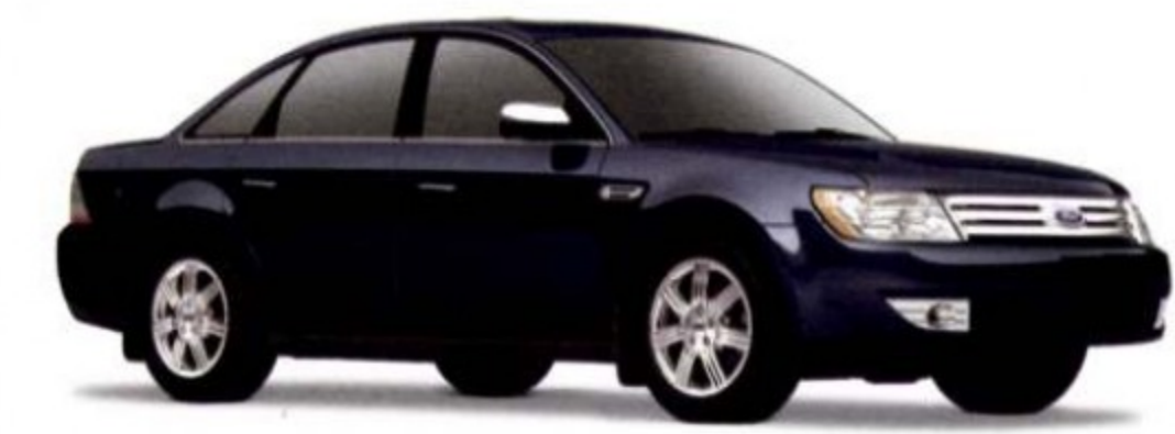
Dark Ink Blue Metallic