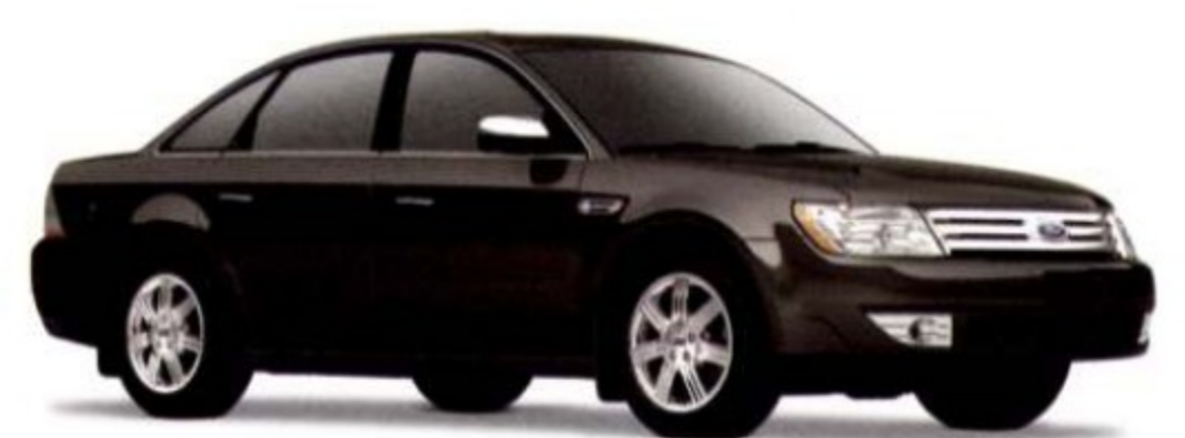
Tuxedo Black Metallic