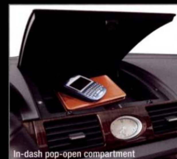
In-dash pop-open compartment