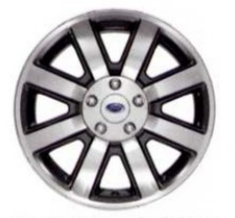
17" 8-Spoke Bright-Finish Aluminum with Painted Pockets Standard on SEL