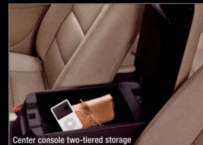
Center console two-tiered storage