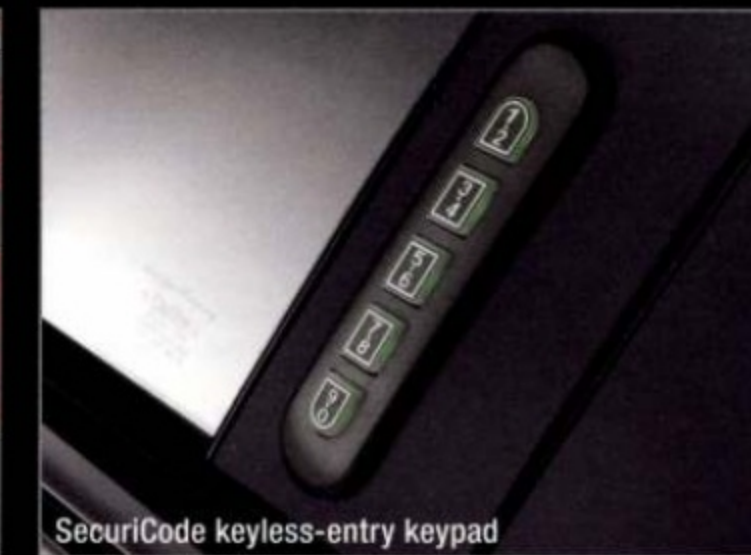
SecuriCode keyless-entry keypad