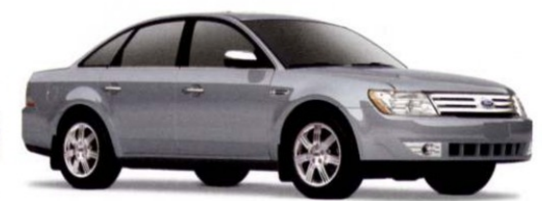
Light Ice Blue Metallic