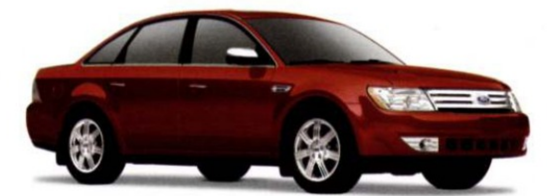
Sangria Red Metallic