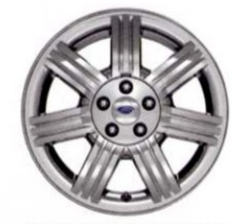
18" 7-Spoke Chrome-Clad Aluminum Standard on Limited