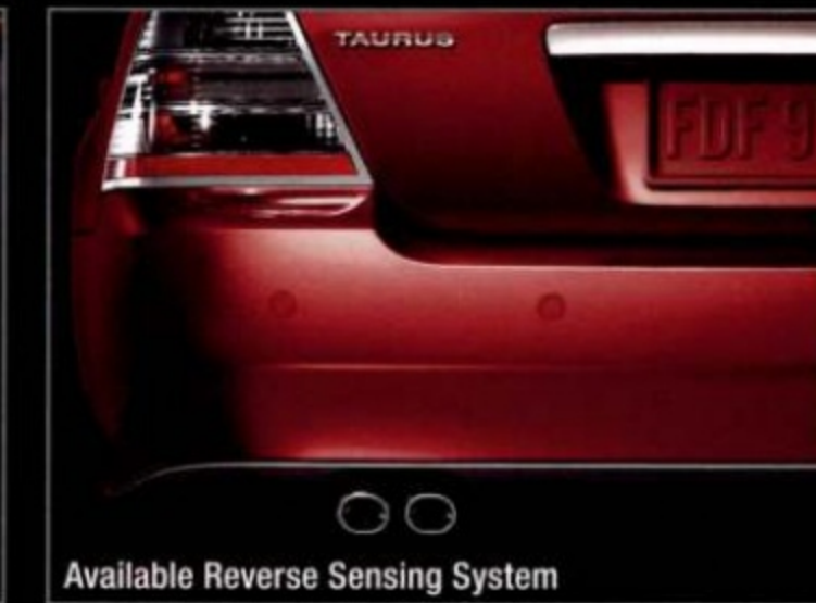
Available Reverse Sensing System