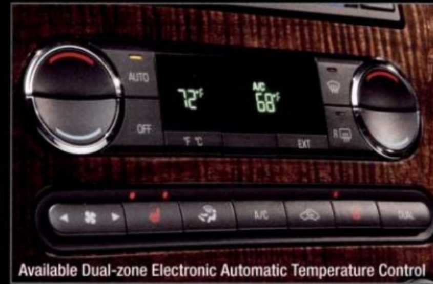
Available Dual-zone Electronic Automatic Temperature Control