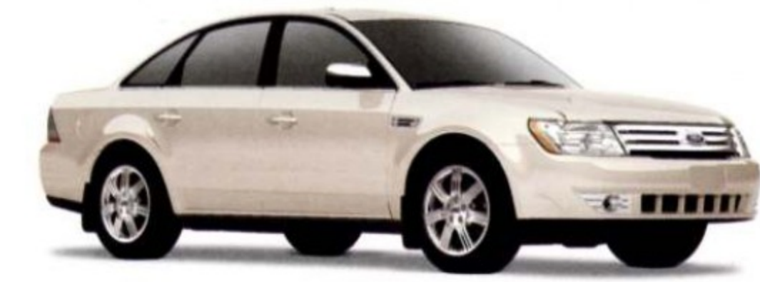
White Sand Tri-Coat Metallic