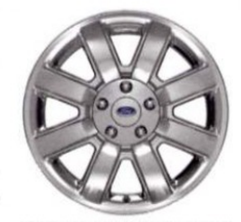
17" 8-Spoke Bright-Finish Aluminum Standard on SE