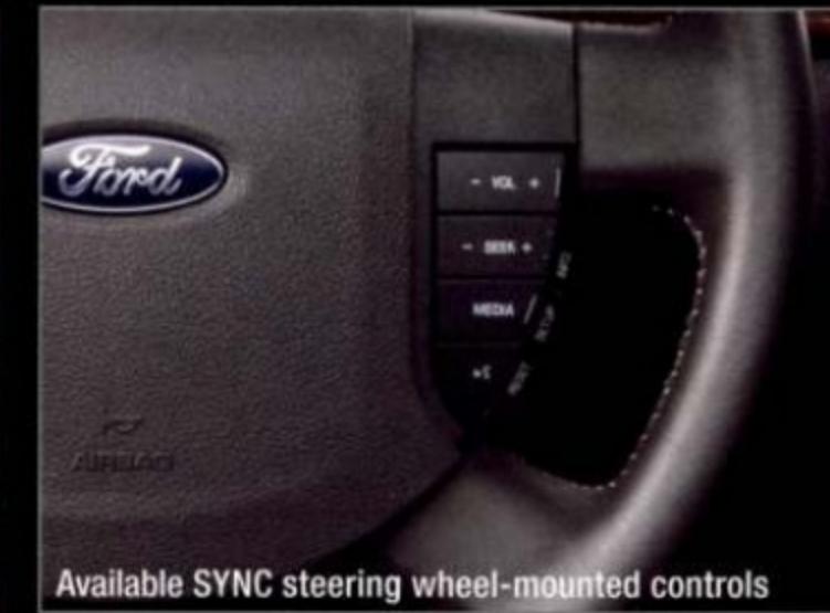
Available SYNC steering wheel-mounted controls