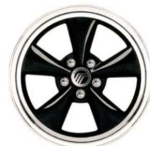
17" PAINTED BLACK ALUMINUM AVAILABLE AS A MERCURY ACCESSORY