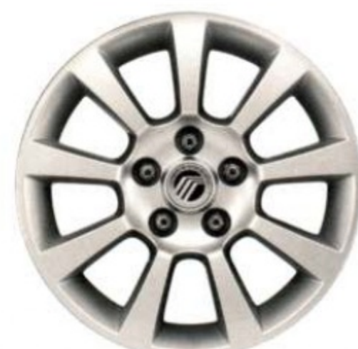
16" 9-SPOKE PAINTED-ALUMINUM STANDARD ON V-6 MILAN AND V-6 MILAN AWD; AVAILABLE WITH I-4 AUTO PACKAGE