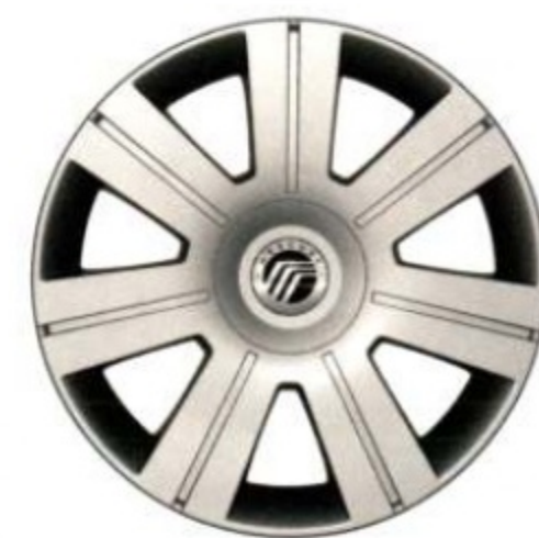
16" 7-SPOKE DELUXE STEEL WHEEL COVERS STANDARD ON I-4 MILAN

Mercury uses clearcoat paint for beauty and protection. All exterior paints are Metallic except for White Suede. Colors are representative only. 1 New for 2009. 2 Available with Appearance Package. 3 Available with VOGA Package. 4 Available with Camel interior only. 5 Available on Milan Premier only.