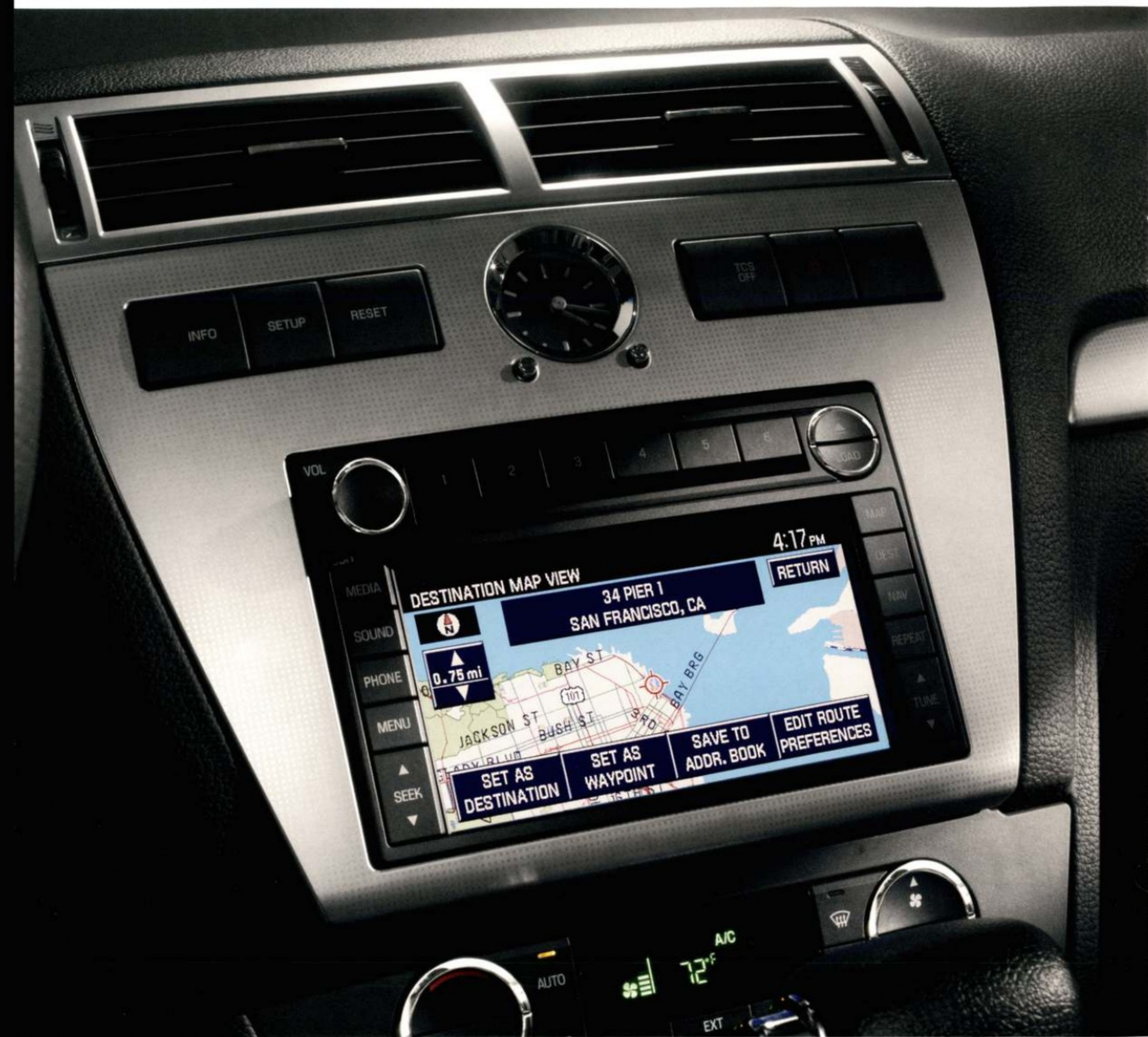
There's no need to ask for directions when they're available by simply issuing a voice command. Combining Global Positioning System (GPS) technology with DVD mapping, Milan's available voice-activated Navigation System provides turn-by-turn voice guidance in English, French or Spanish; allows you to save destinations; gives you the shortest route; and will even reroute you if you miss a turn.