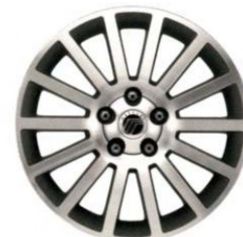
17" 14-SPOKE MACHINED-ALUMINUM WITH PAINTED POCKETS AVAILABLE WITH APPEARANCE PACKAGE

■ MILAN ■ MILAN PREMIER □ AVAILABLE ■ APPEARANCE PACKAGE ■ VOGA PACKAGE