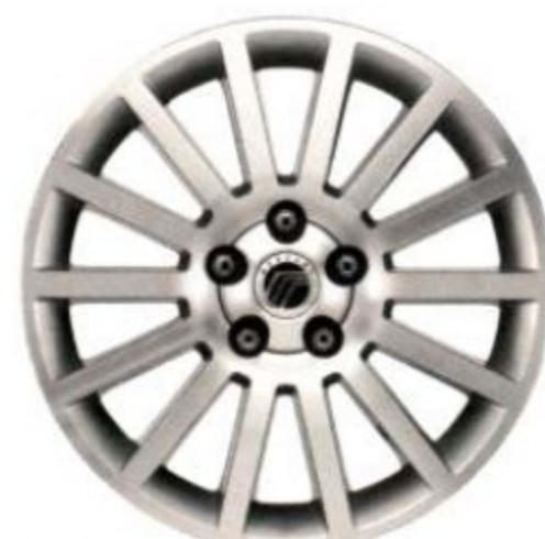
17" 14-SPOKE MACHINED-ALUMINUM STANDARD ON I-4 PREMIER AND V-6 PREMIER