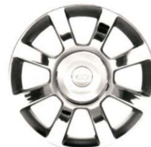
17" 8-SPOKE CHROME-CLAD AVAILABLE WITH VOGA PACKAGE