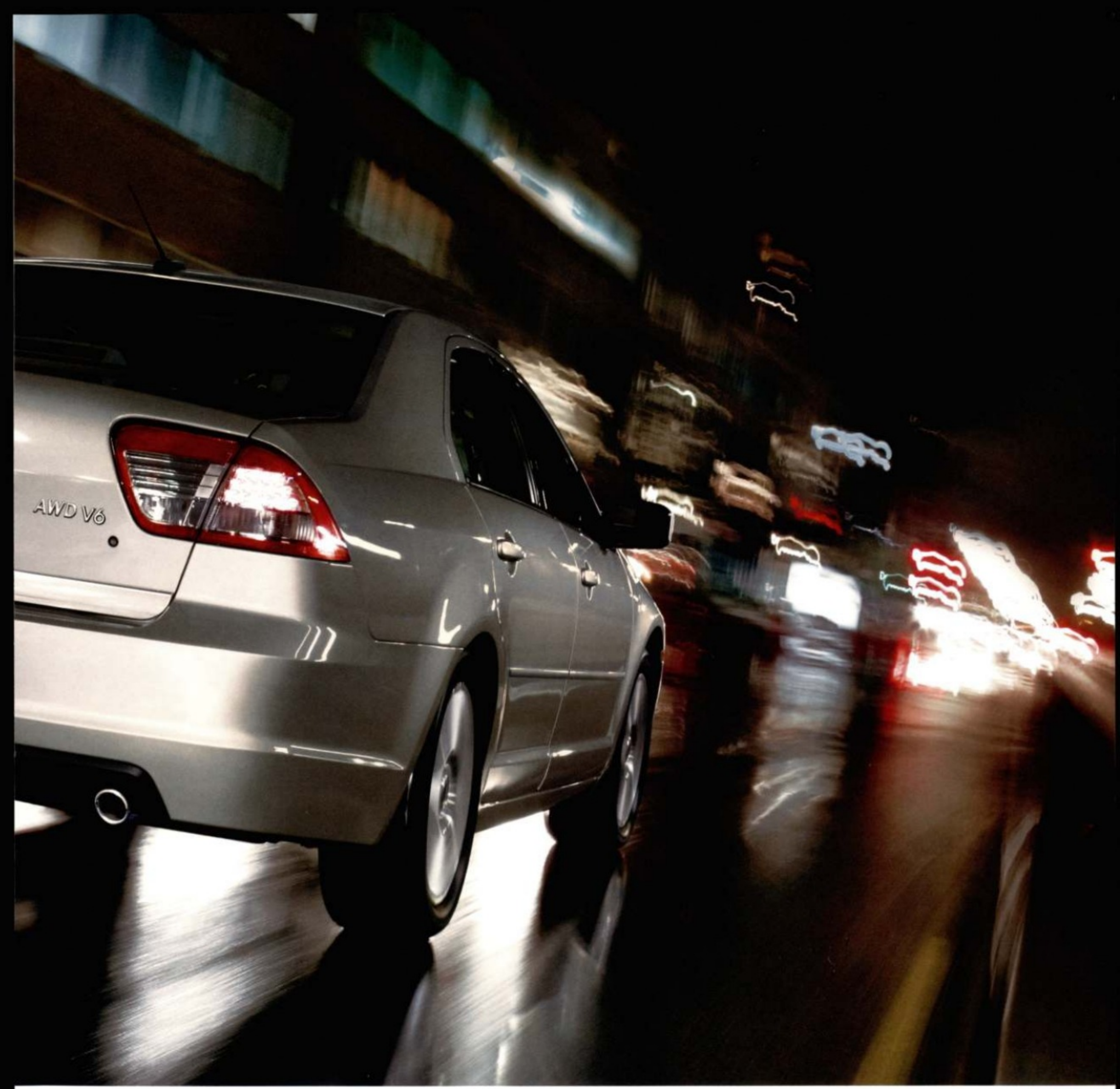
MILAN PREMIER V-6 IN BRILLIANT SILVER METALLIC WITH AVAILABLE EQUIPMENT.