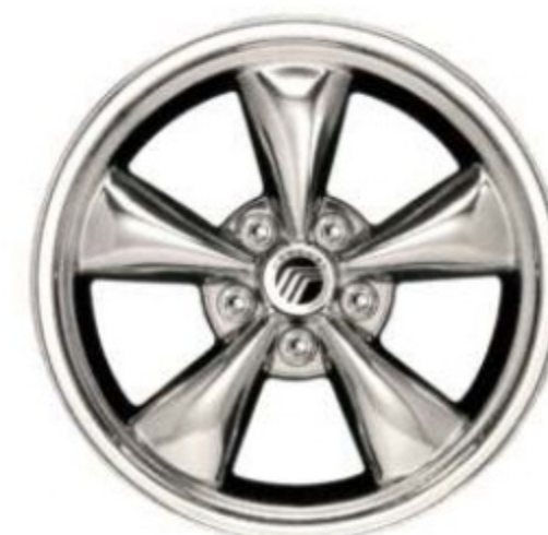
17" POLISHED-ALUMINUM AVAILABLE AS A MERCURY ACCESSORY