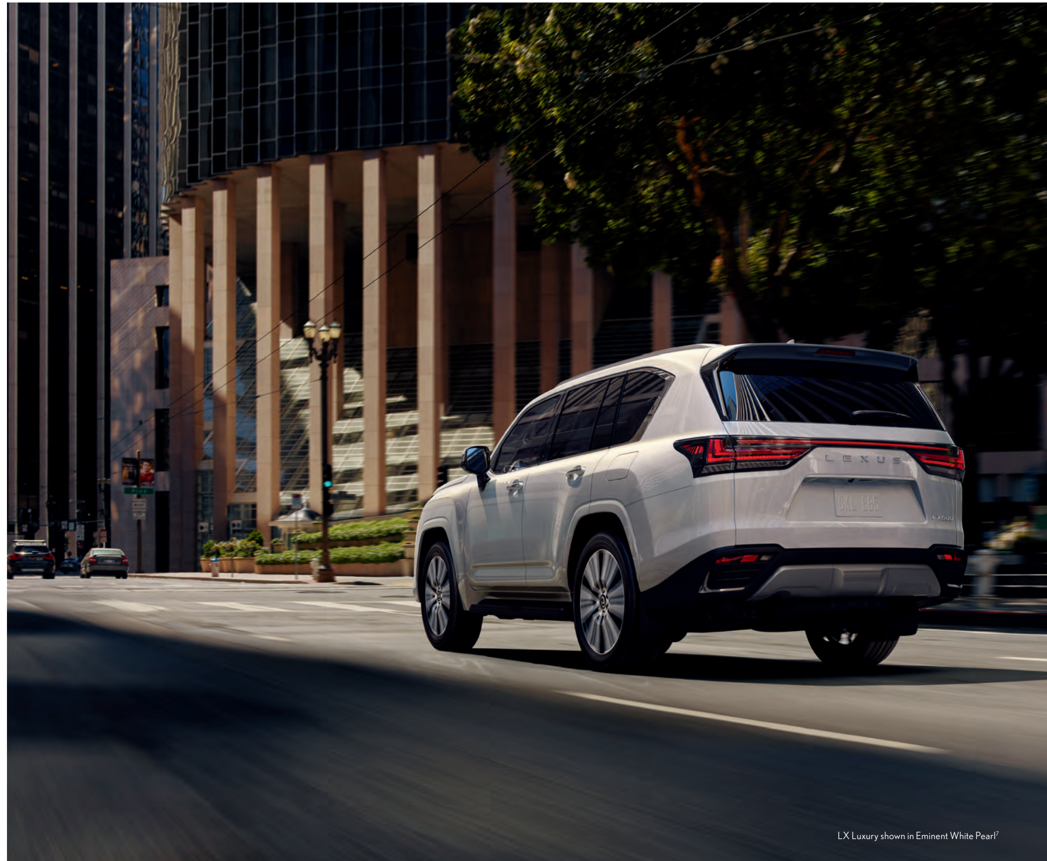
LX Luxury shown in Eminent White Pearl 1