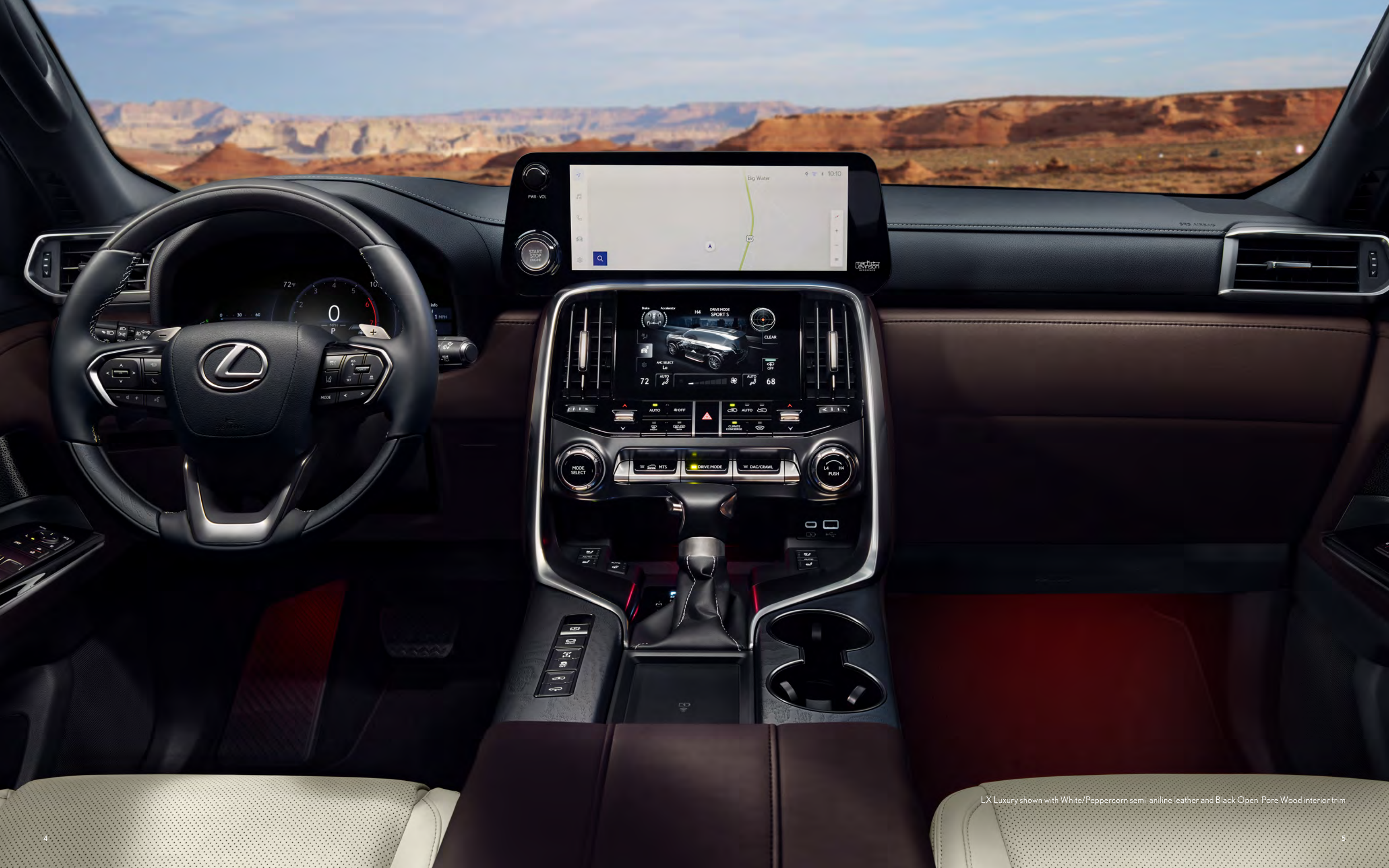
LX Luxury shown with White/Peppercorn semi-aniline leather and Black Open-Pore Wood interior trim