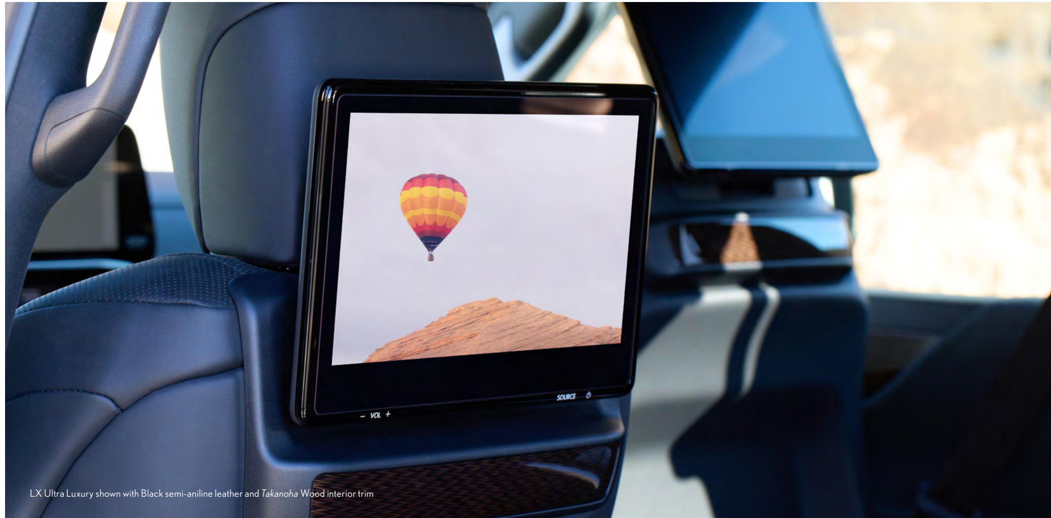
LX Ultra Luxury shown with Black semi-aniline leather and Takanoha Wood interior trim