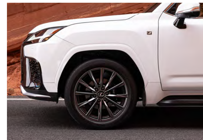
LX F SPORT Handling shown in Ultra White 7