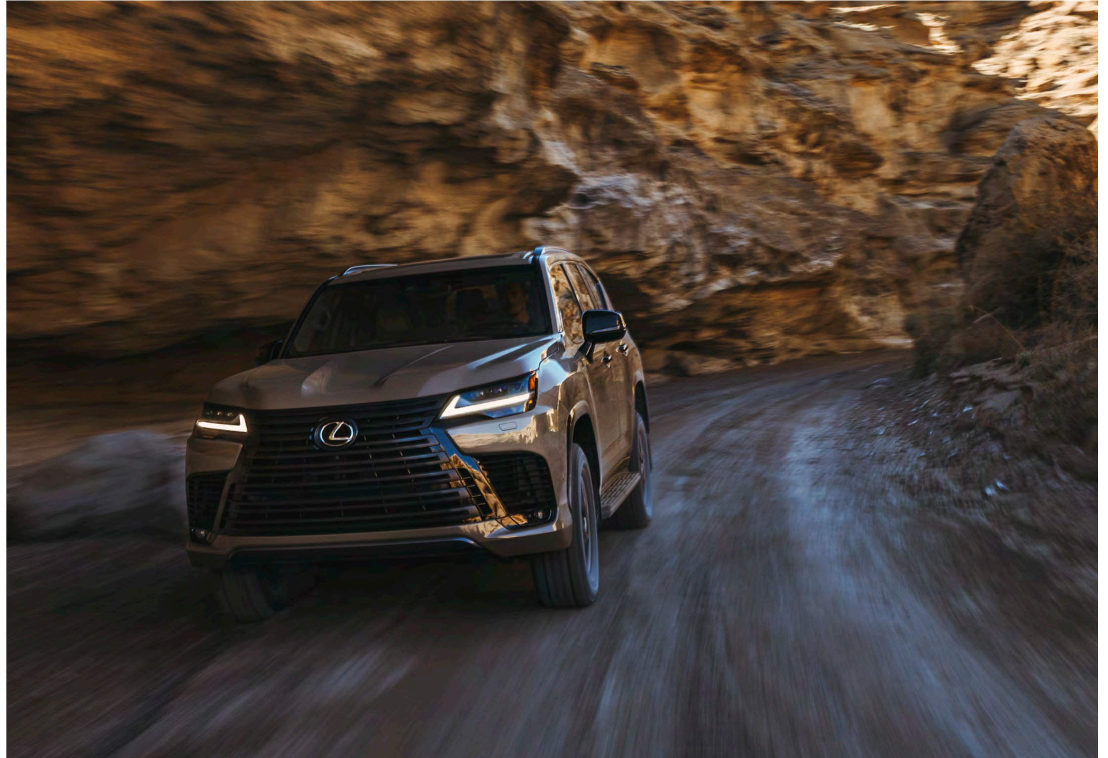
LX Overtrail shown in Earth

Outside, the LX Overtrail stands apart with distinct features that include a Matte Gray grille, darkened exterior accents, black overfenders and an available Earth exterior color. While inside, this SUV rewards with luxuries that include semi-aniline leather-trimmed seating and Black Open-Pore Wood-trimmed accents.