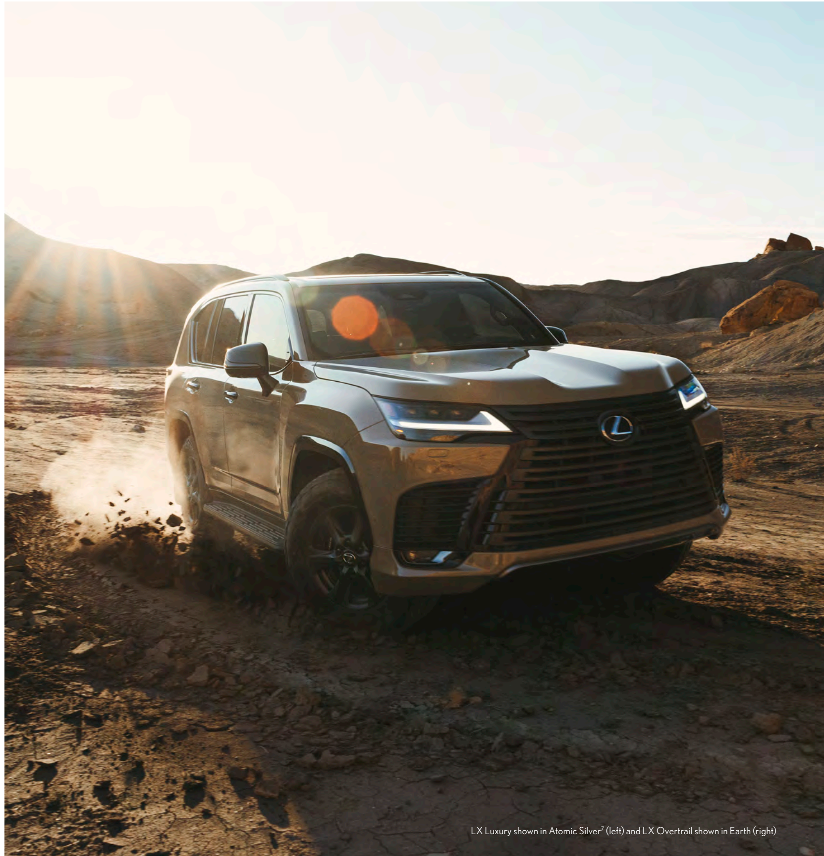
LX Luxury shown in Atomic Silver 7 (left) and LX Overtrail shown in Earth (right)