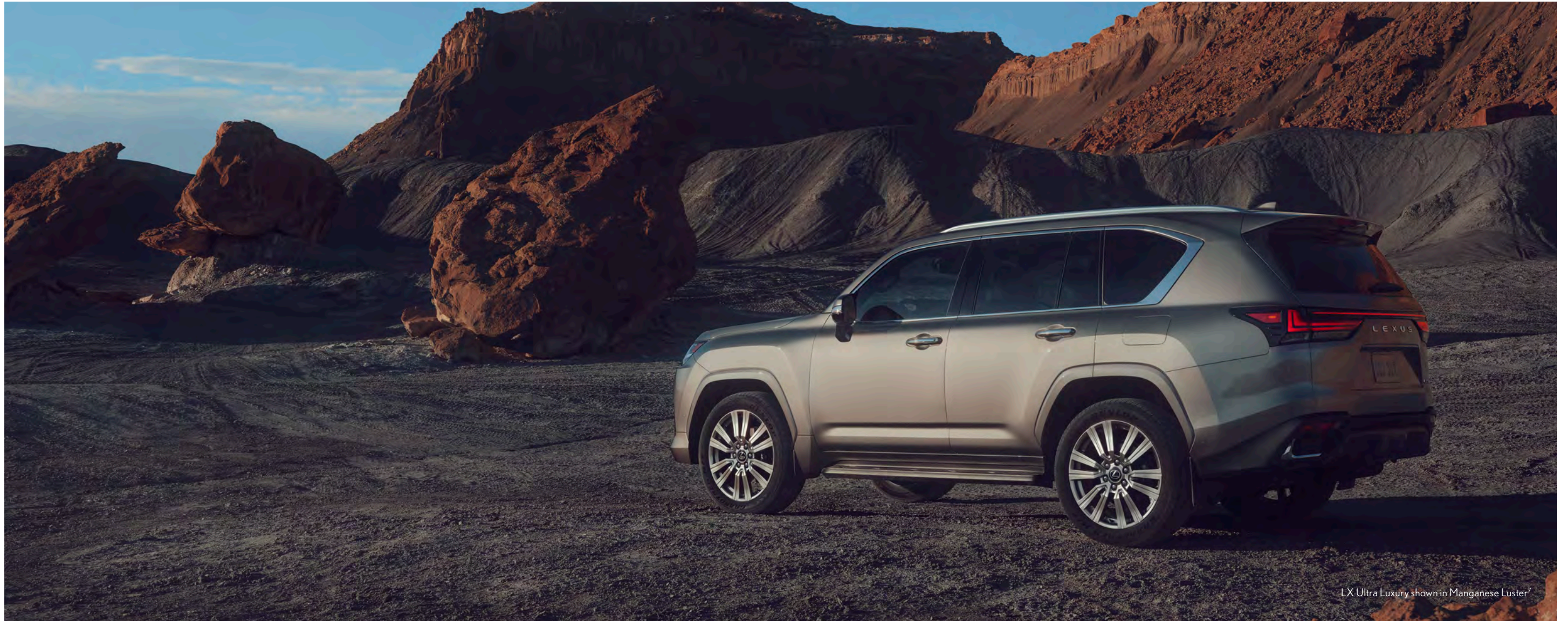
LX Ultra Luxury shown in Manganese Luster 7