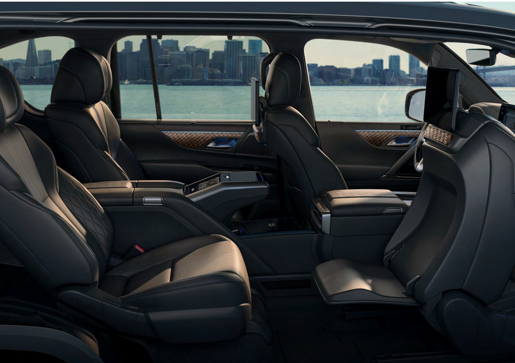
LX Ultra Luxury shown with Black semi-aniline leather and Takanoha Wood interior trim