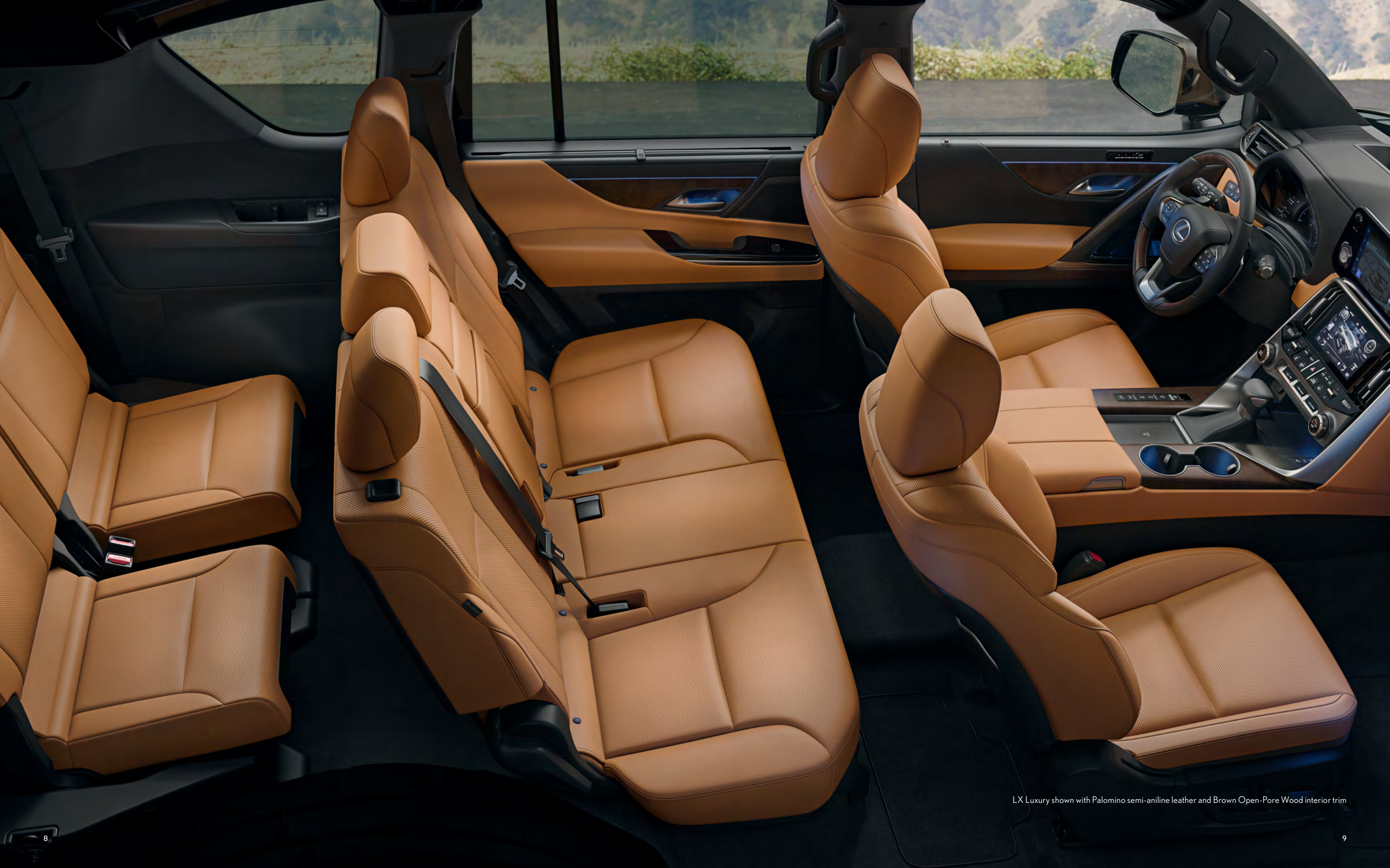
LX Luxury shown with Palomino semi-aniline leather and Brown Open-Pore Wood interior trim