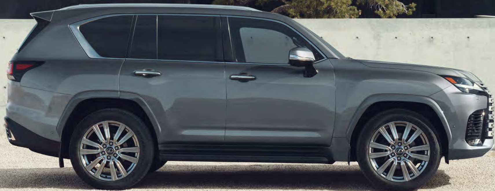
LX Ultra Luxury shown in Manganese Luster

Not just a hybrid. A Lexus. The first-ever LX 700h takes luxury to even greater heights with a newly developed electrified powertrain. Engineered for effortless response on-road and durability off-road, 2 this parallel hybrid system pairs the powerful twin-turbocharged V6 engine with a proven nickel-metal hydride (NiMH) battery pack and high-torque electric motor. The result: a mighty 457 net combined horsepower 1 and 583 lb-ft of torque—making the 700h our most powerful LX ever.