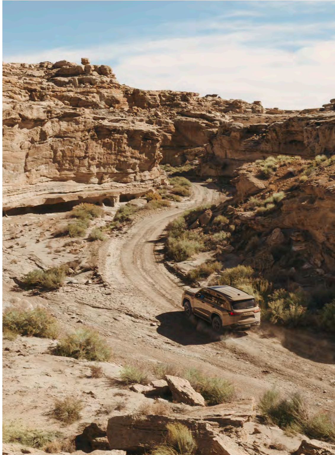
LX Overtrail shown in Earth. Off-roading is inherently dangerous. Abusive use may result in personal injury or vehicle damage.