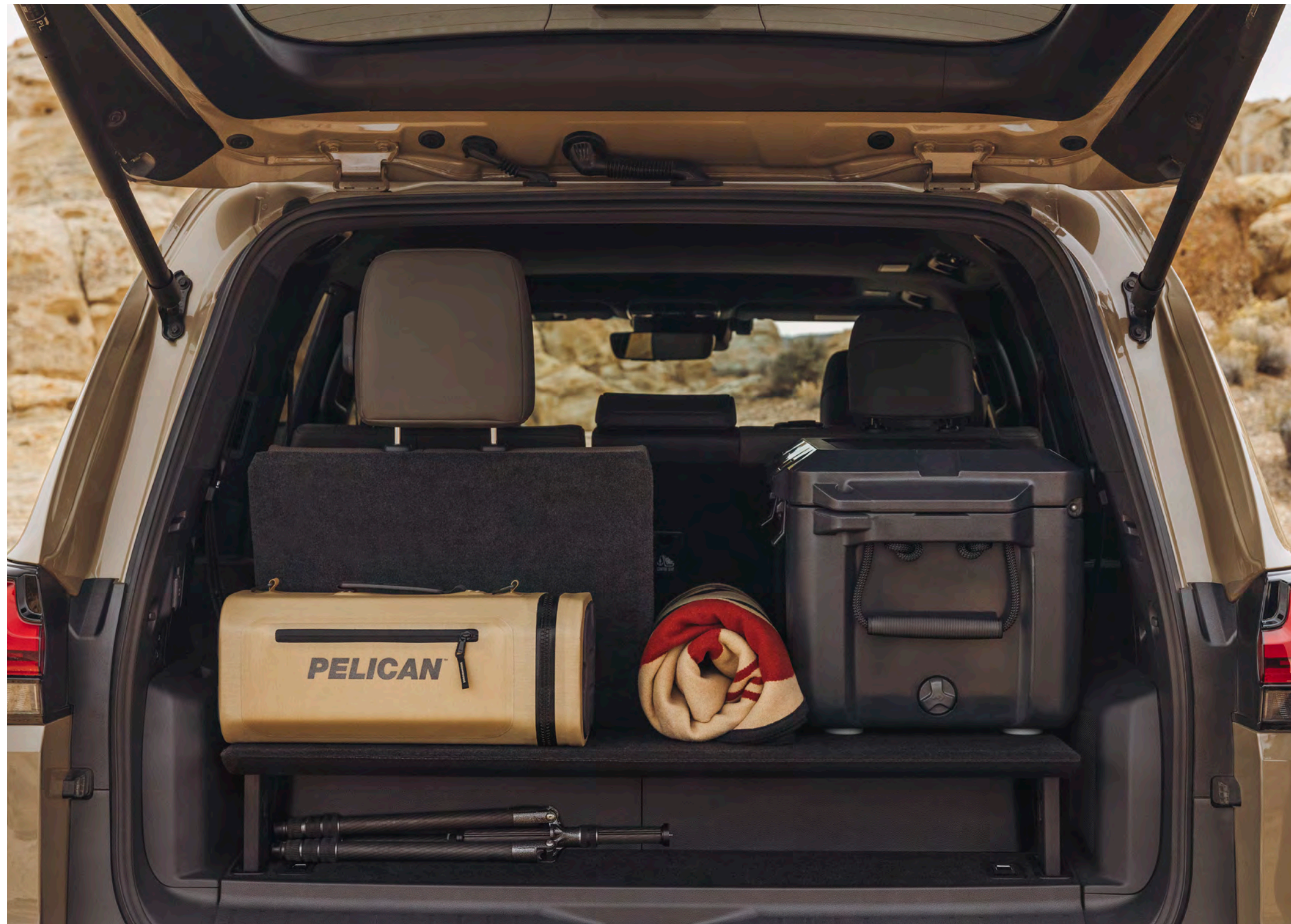
LX Overtrail shown with Stone Brown semi-aniline leather and Black Open-Pore Wood interior trim

LX 700h models feature a configurable cargo shelf located behind the third-row seats. Designed with a load capacity of up to 175 pounds, 11 this shelf can also be folded out of the way to allow taller items to be stored in the rear. And with the third-row seats folded down, this shelf can be lowered to help create a fully flat cargo-area floor.