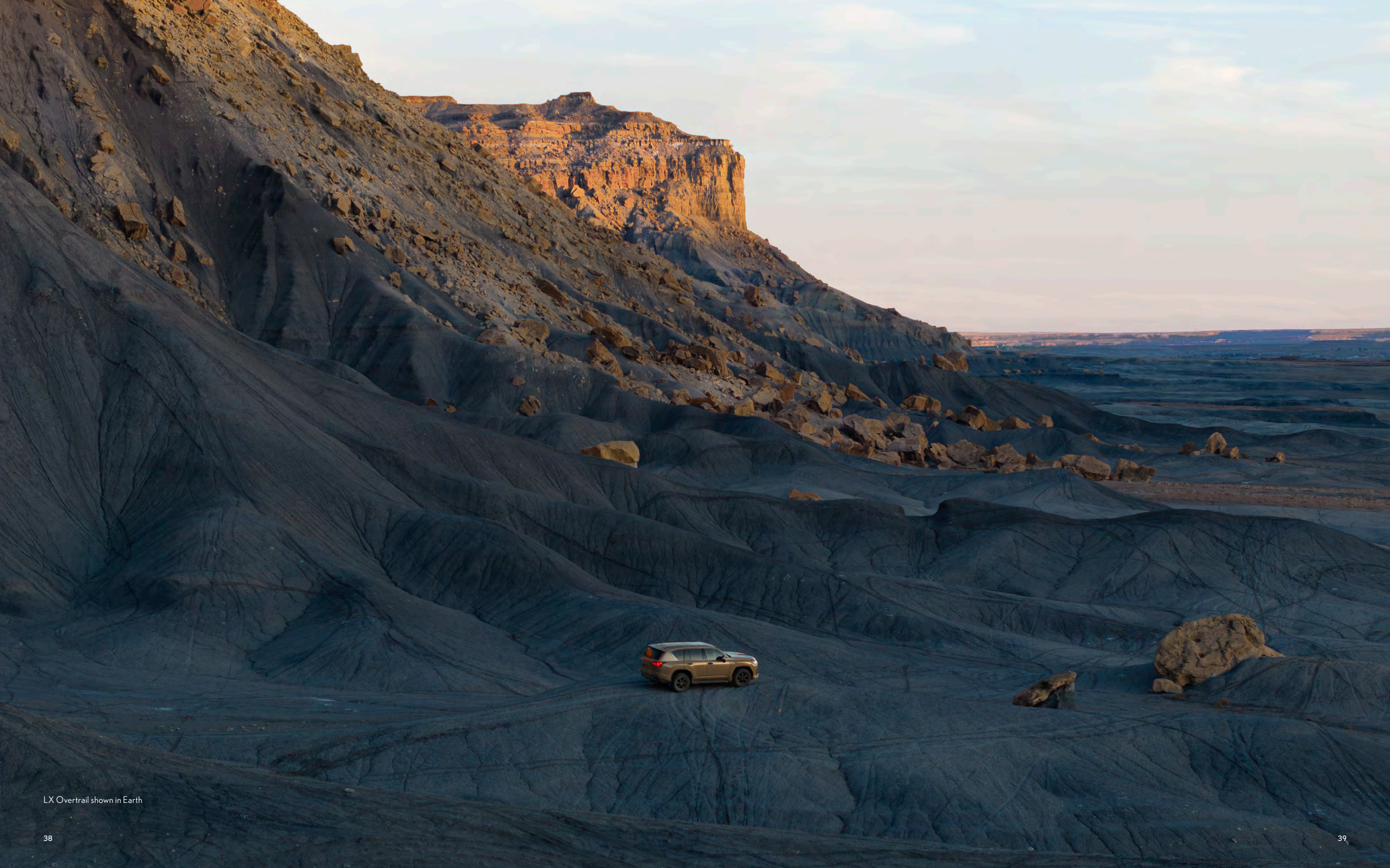
LX Overtrail shown in Earth