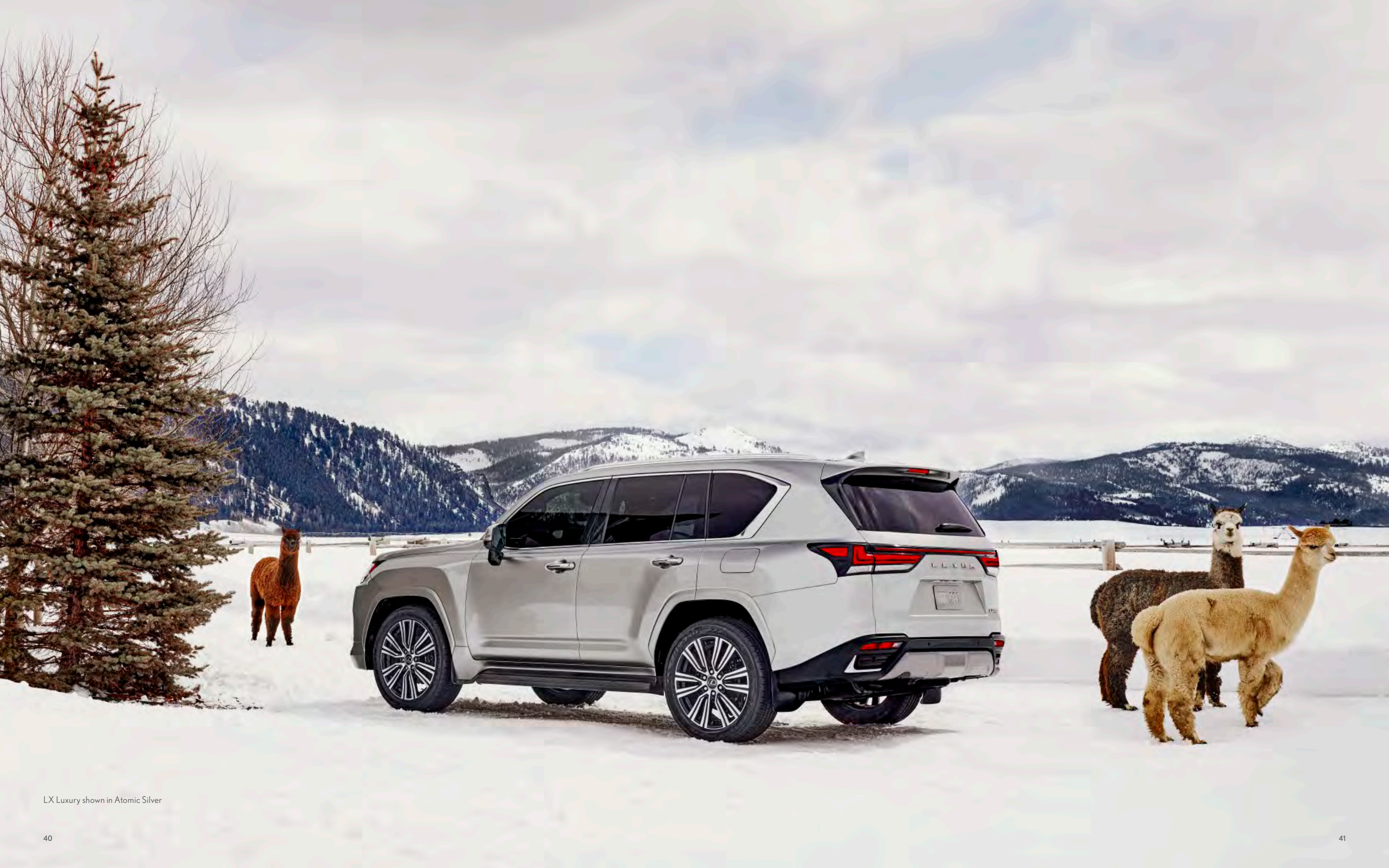
LX Luxury shown in Atomic Silver