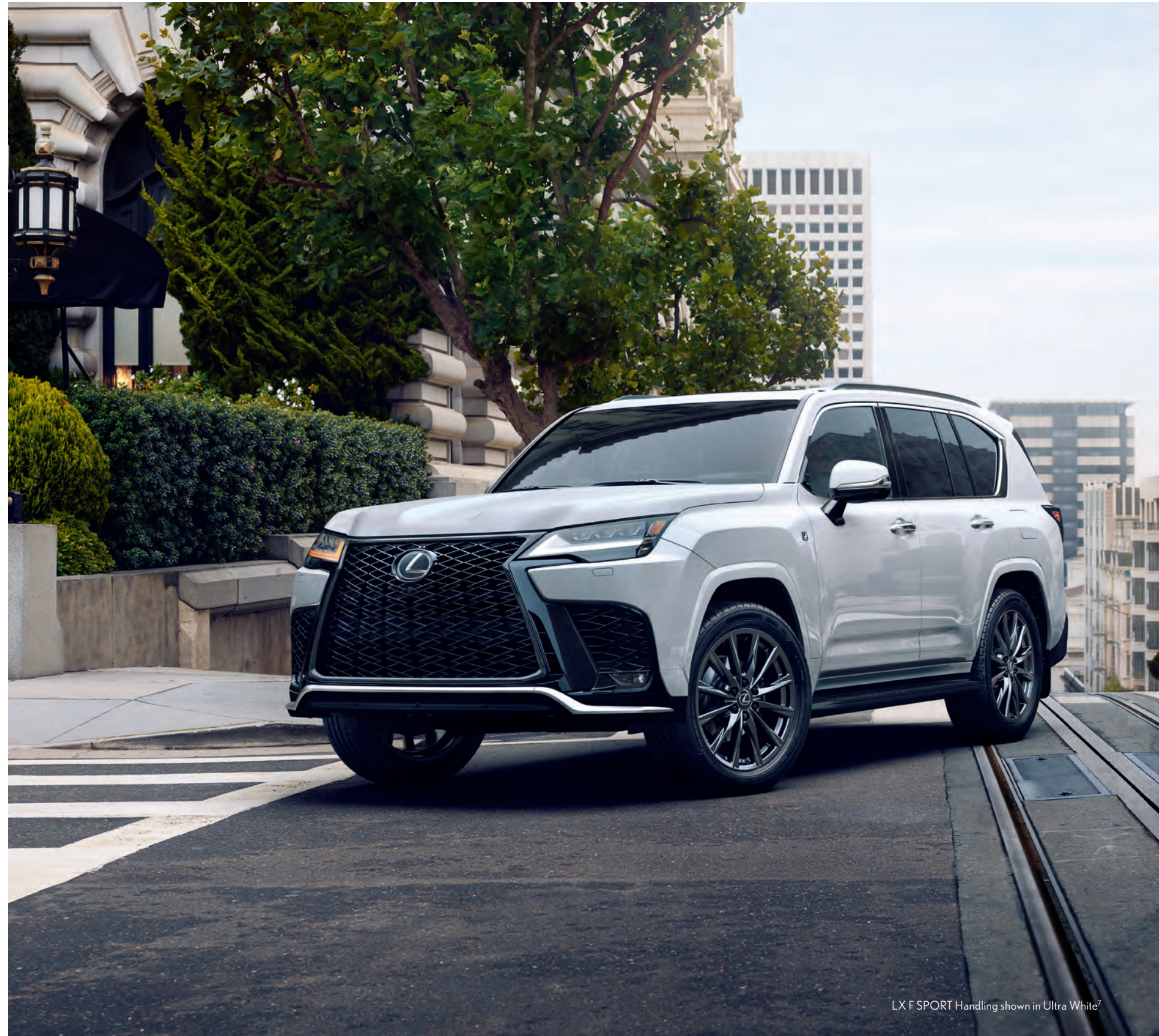
LX F SPORT Handling shown in Ultra White ®

Forged alloy wheels with Silver finish STANDARD LX Ultra Luxury