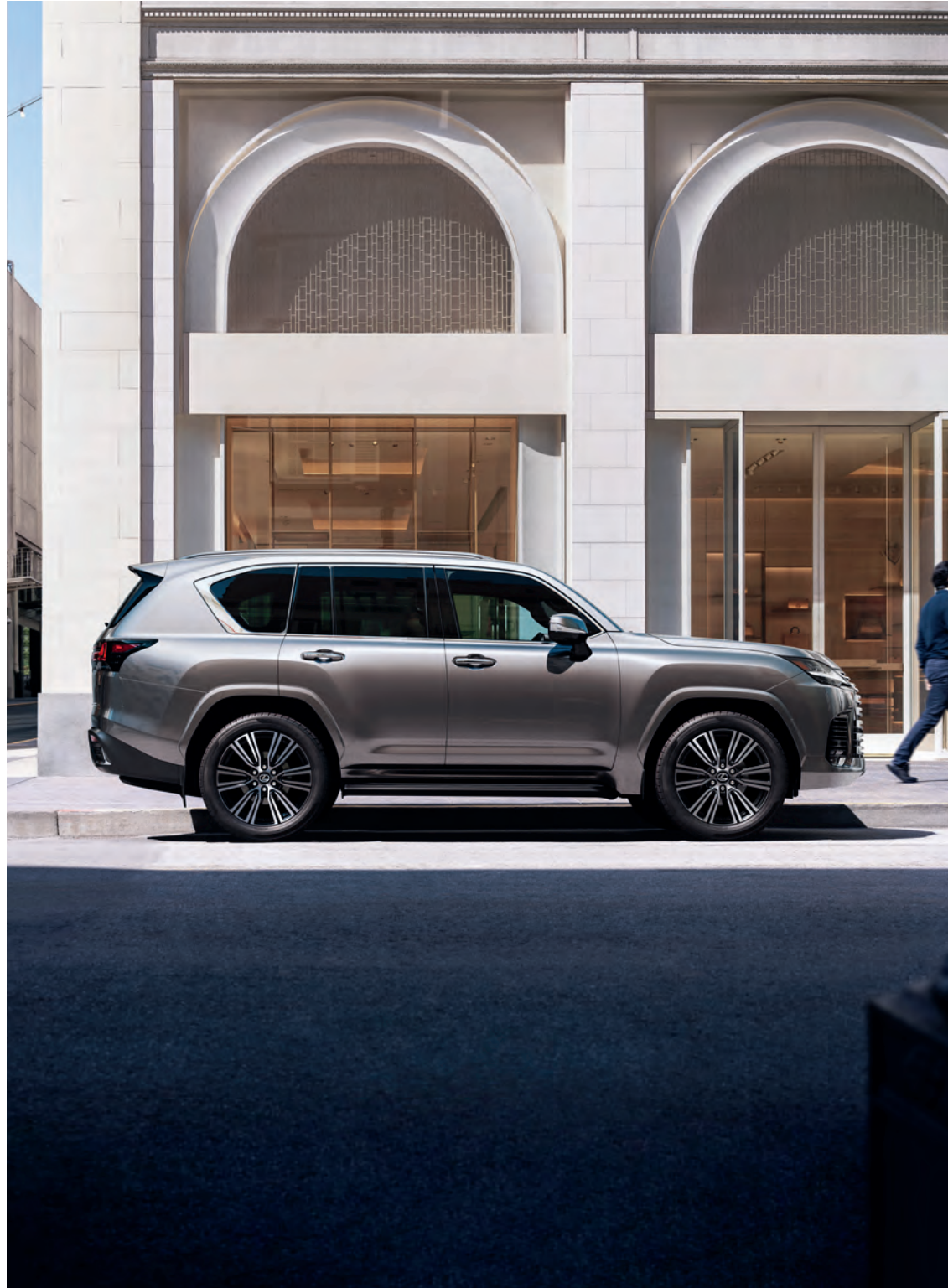
LX Luxury shown in Atomic Silver