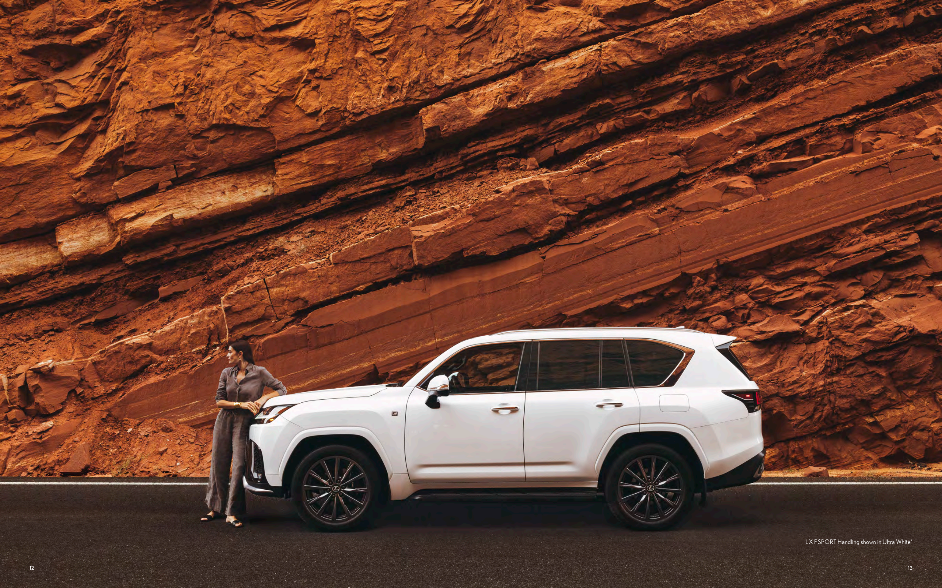
LX F SPORT Handling shown in Ultra White 1