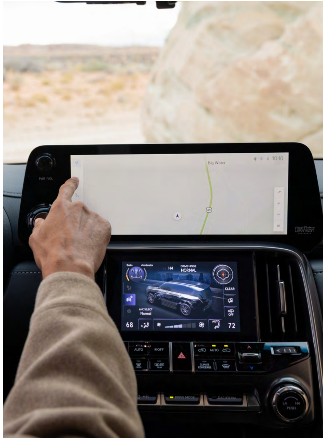
LX Luxury shown with Black semi-aniline leather and Black Open-Pore Wood interior trim (left); LX interior shown with Apple CarPlay 12 integration for iPhone ®13 (right)

The greatest technology is that which takes the least effort to understand—technology so intuitive that having more of it actually feels like less. Case in point: Lexus Interface 14 seamlessly connects you via touchscreen—or voice—to the many benefits of an active Drive Connect 15 trial or subscription. Its Intelligent Assistant feature gets smarter over time, and Cloud Navigation offers more accurate directions. Lexus Interface also wirelessly integrates with Apple CarPlay ®12 for your iPhone, ®13 or Android Auto ™16 for your Android ™ phone. It's the convenience of more than 19 inches of screen access, including a lower display that's designed to inform, not distract. The product of relentless imagination and human-centered design, this is technology as it should be.