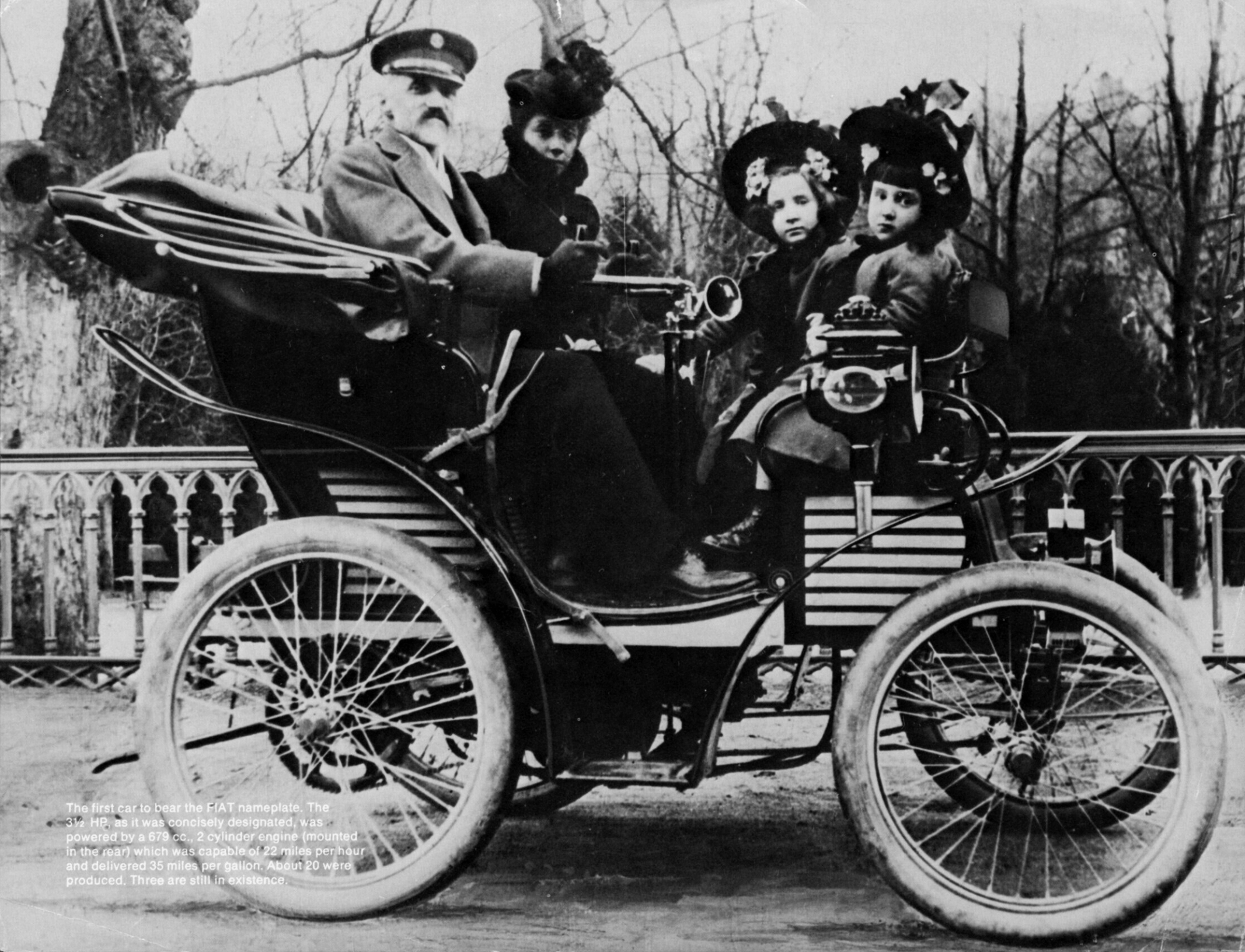
The first car to bear the FIAT nameplate. The 3 1/2 HP, as it was concisely designated, was powered by a 679 cc., 2 cylinder engine (mounted in the rear) which was capable of 22 miles per hour and delivered 35 miles per gallon. About 20 were produced. Three are still in existence.