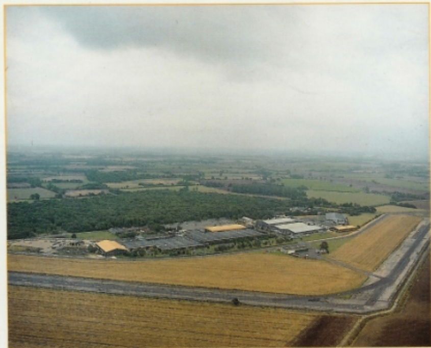
The Lotus factory, Hethel, Norfolk.

As a result of the V.A.T. rate increase, with effect from 1st April 1991 the retail price of the Hethel Celebration Excel is £29,630.