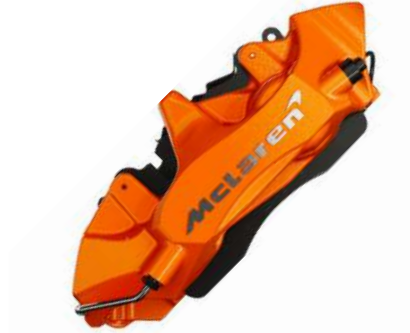
McLaren Orange with Silver Machined McLaren Logo