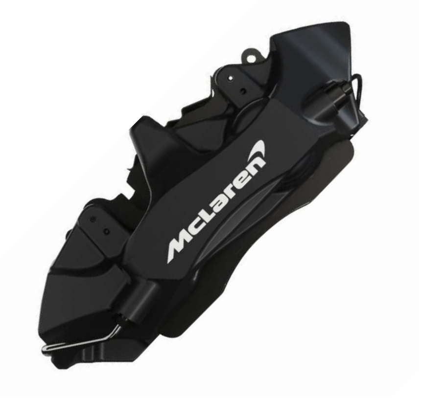
Black Anodised with White Printed McLaren Logo