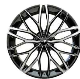
Gloss Black Diamond Cut