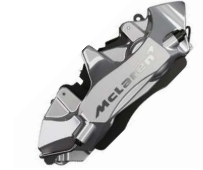
Polished with Silver Machined McLaren Logo