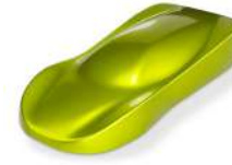
Flux Green II