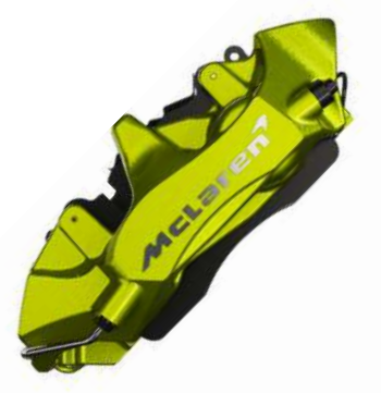
Flux Green with Silver Machined McLaren Logo