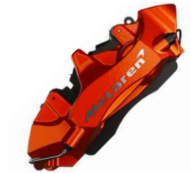
Azores with Silver Machined McLaren Logo