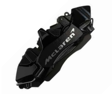
Black with Silver Machined McLaren Logo