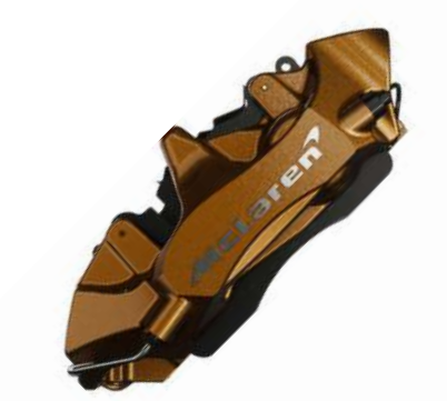
Bronze with Silver Machined McLaren Logo