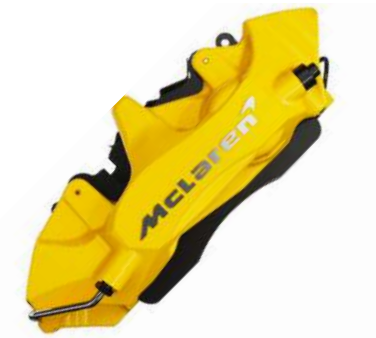
Yellow with Silver Machined McLaren Logo