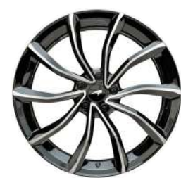
Gloss Black Diamond Cut