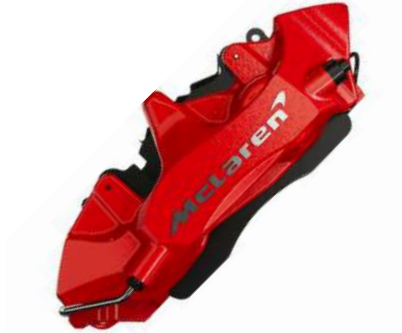
Red with Silver Machined McLaren Logo