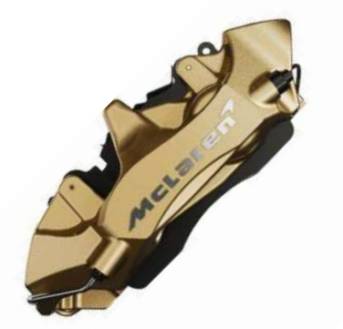
Speedline Gold with Silver Machined McLaren Logo