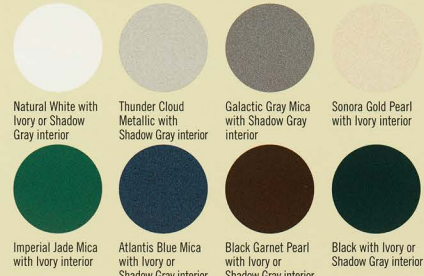
Natural White with Ivory or Shadow Gray interior