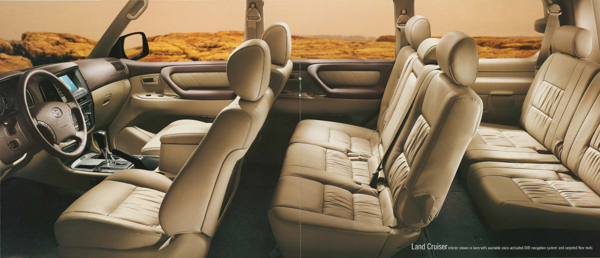
Land Cruiser interior shown in Ivory with available voice-activated DVD navigation system 1 and carpeted floor mats